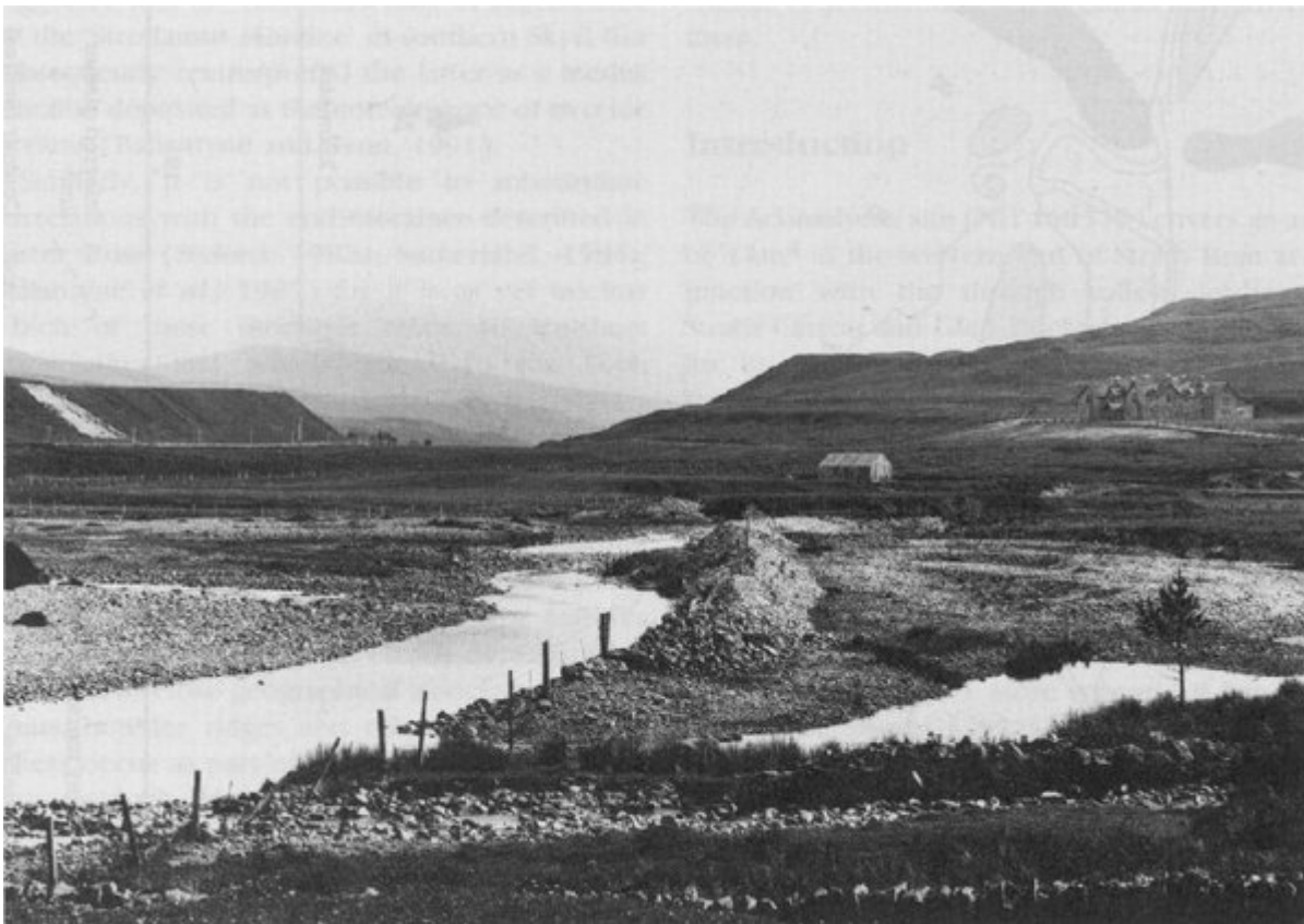
(Figure 6.5) Glaciofluvial terraces at Achnasheen.