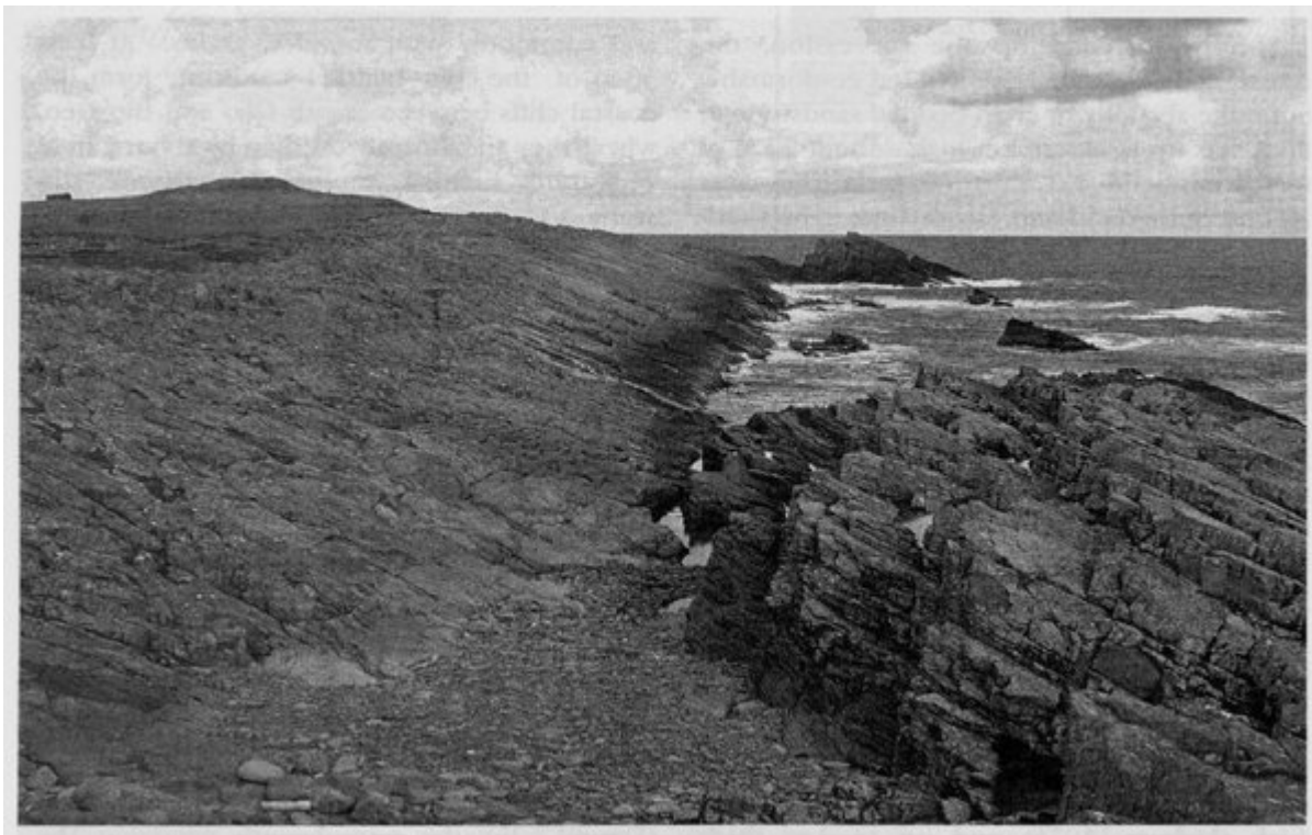
(Figure 2.25) The Cletts (bedding plane of pebbly sandstone, left), and gully eroded through the fish bed.