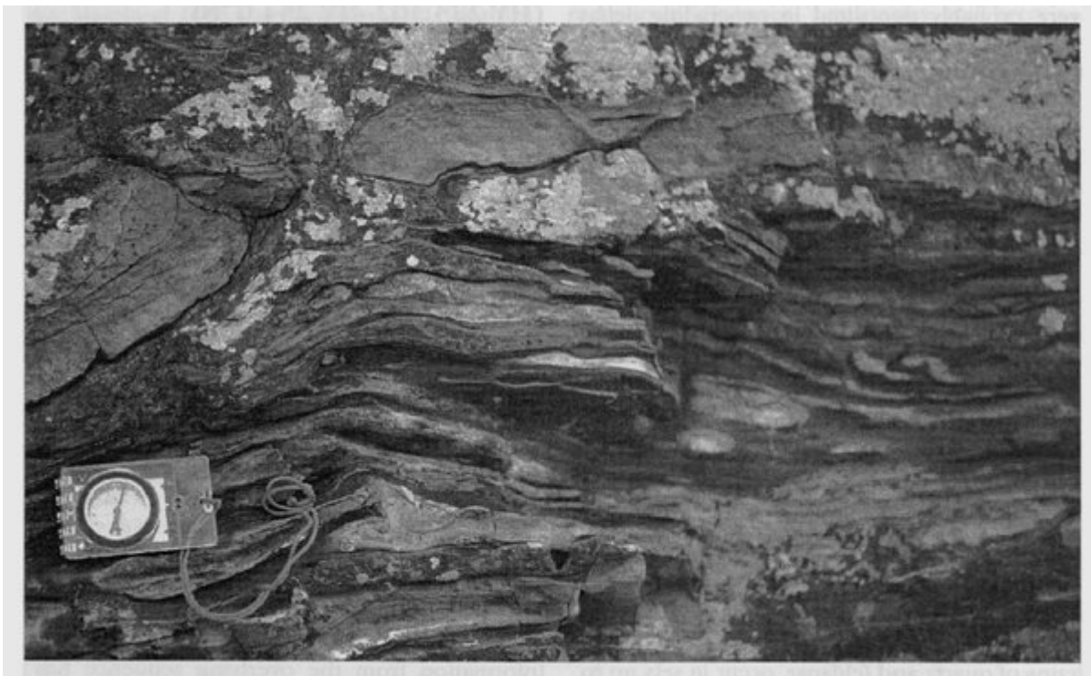
(Figure 2.26) Disrupted dolomitic layers in lacustrine laminites. Exnaboe Fish Bed at The Cletts. (Photo: P. Stone.)