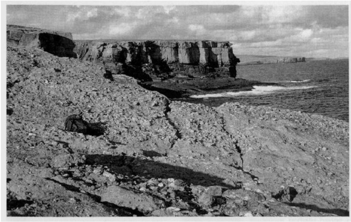
(Figure 2.23) Conglomerates at Vaakel Craigs.