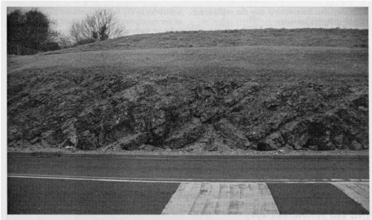
(Figure 6.8) The section at the Entrance Cutting at Bath University GCR site showing the dip-and-fault structures.