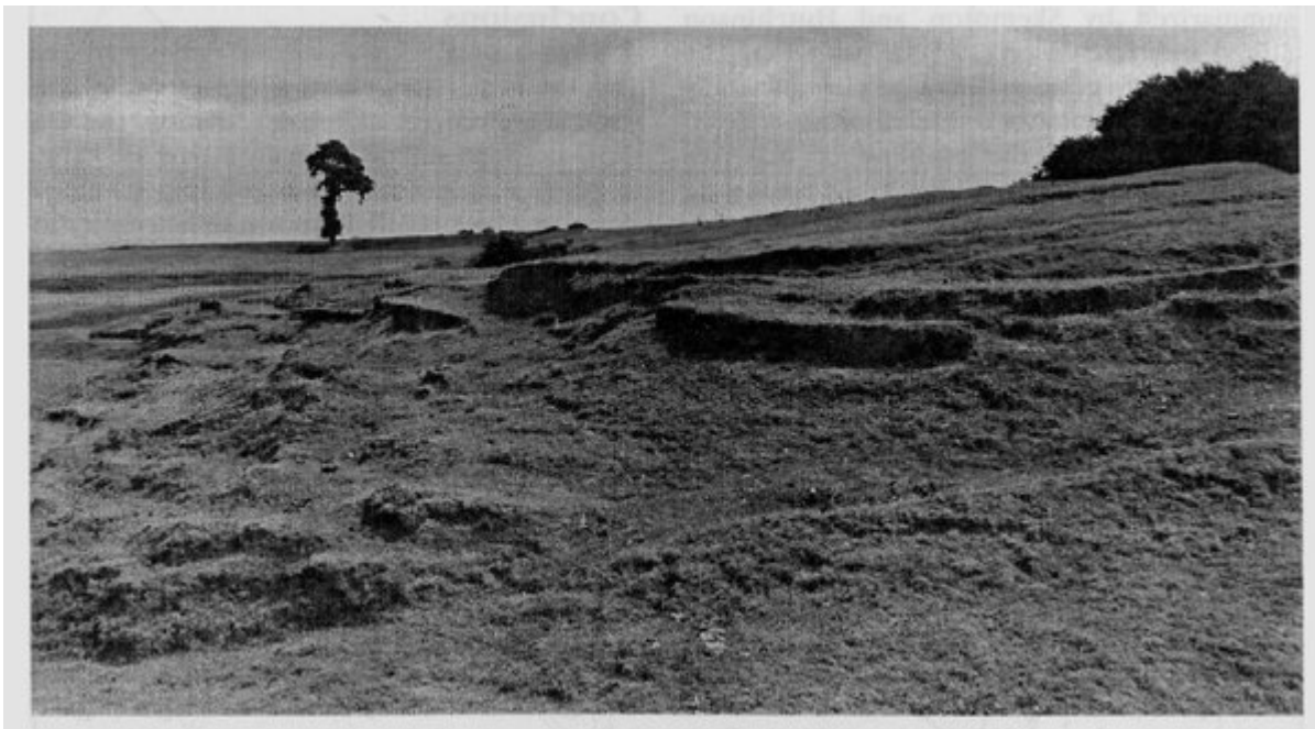
(Figure 8.4) High Halstow in 1938 showing the failure of the lower slopes of the landslide.