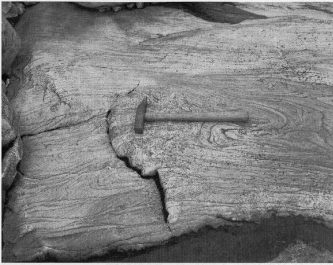
(Figure 7.11) Cross-bedding and slump structures in psammite with micaceous laminae. Succession youngs to the east (top of photo). The hammer is 37 cm long. Abhainn Gleann nan Fiadh [NH 1945 2591].