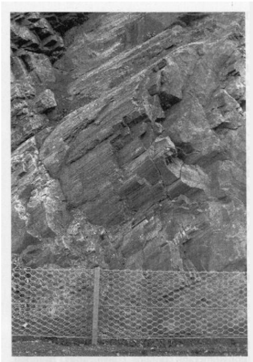
(Figure 6.20) Mullioned and folded psammites and subsidiary semipelites of the Altnaharra Psammite Formation. Road (A836) cutting at the western end of Coldbackie village. The chain fence is 2 m high.