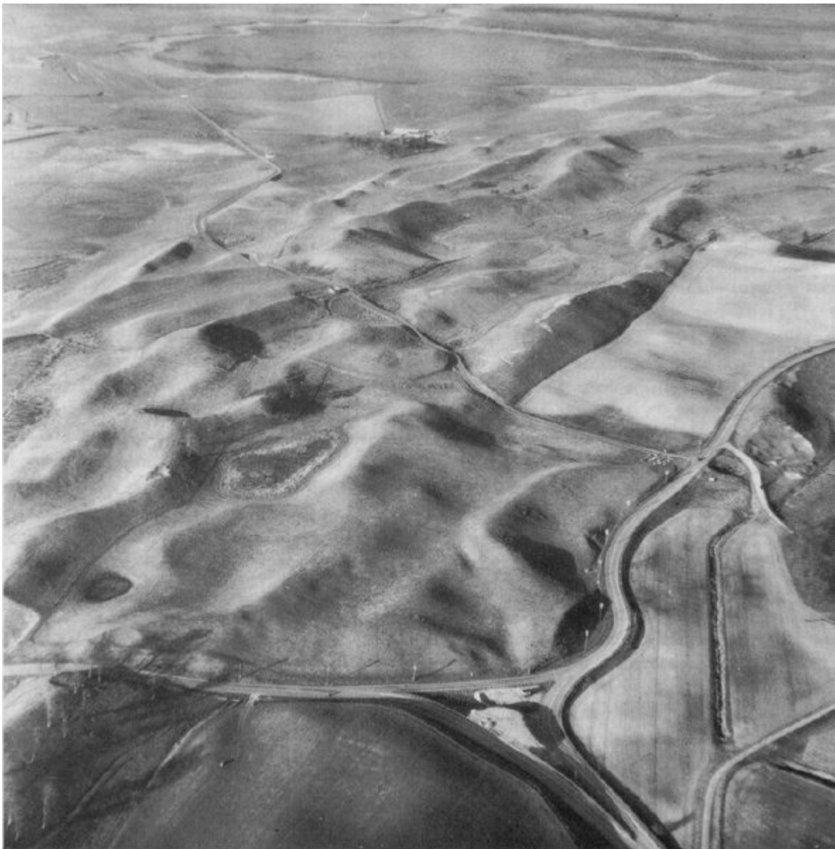
(Figure 16.4) Carstairs Kames showing the interlinked form of the ridges and mounds, with intervening kettle holes.