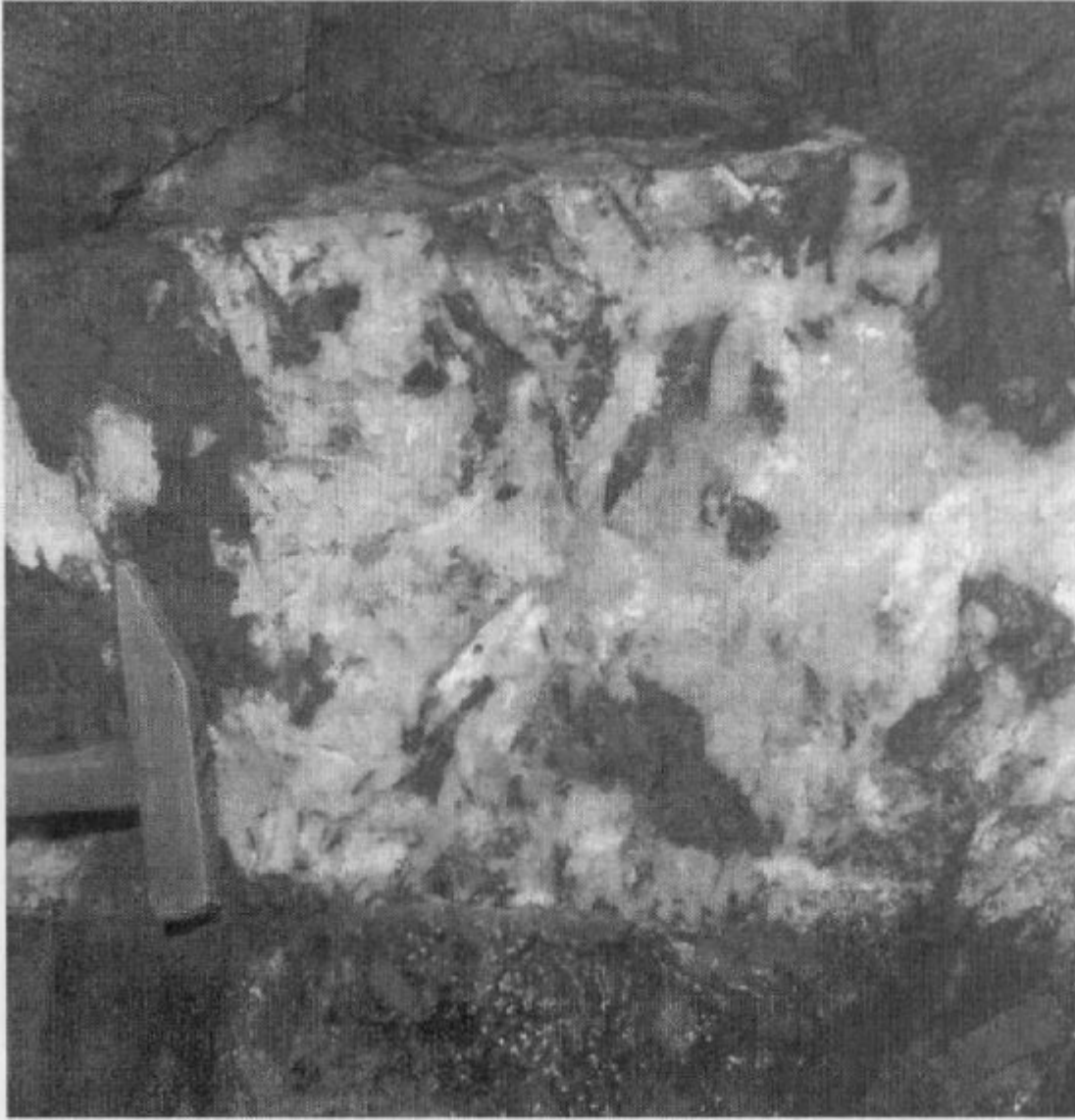
(Figure 2.13) Harding Vein, between gabbro wall-rocks, exposed underground at Carrock Mine–Brandy Gill. Clusters of large wolframite crystals are prominent within massive white quartz. Other conspicuous constituents of the vein include arsenopyrite and a little scheelite.