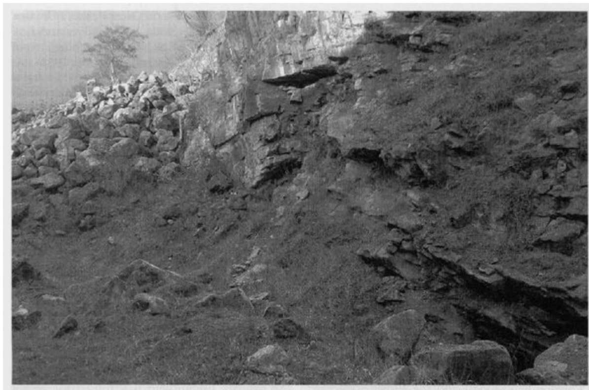
(Figure 4.19) Fall Hill Quarry.