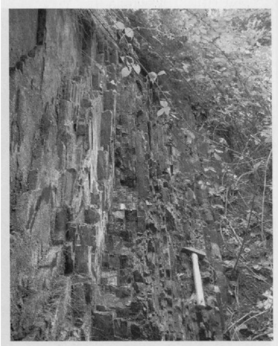
(Figure 7.57) Black carbonaceous cherty shales of the Codden Hill Beds, exposed at High Down Quarry