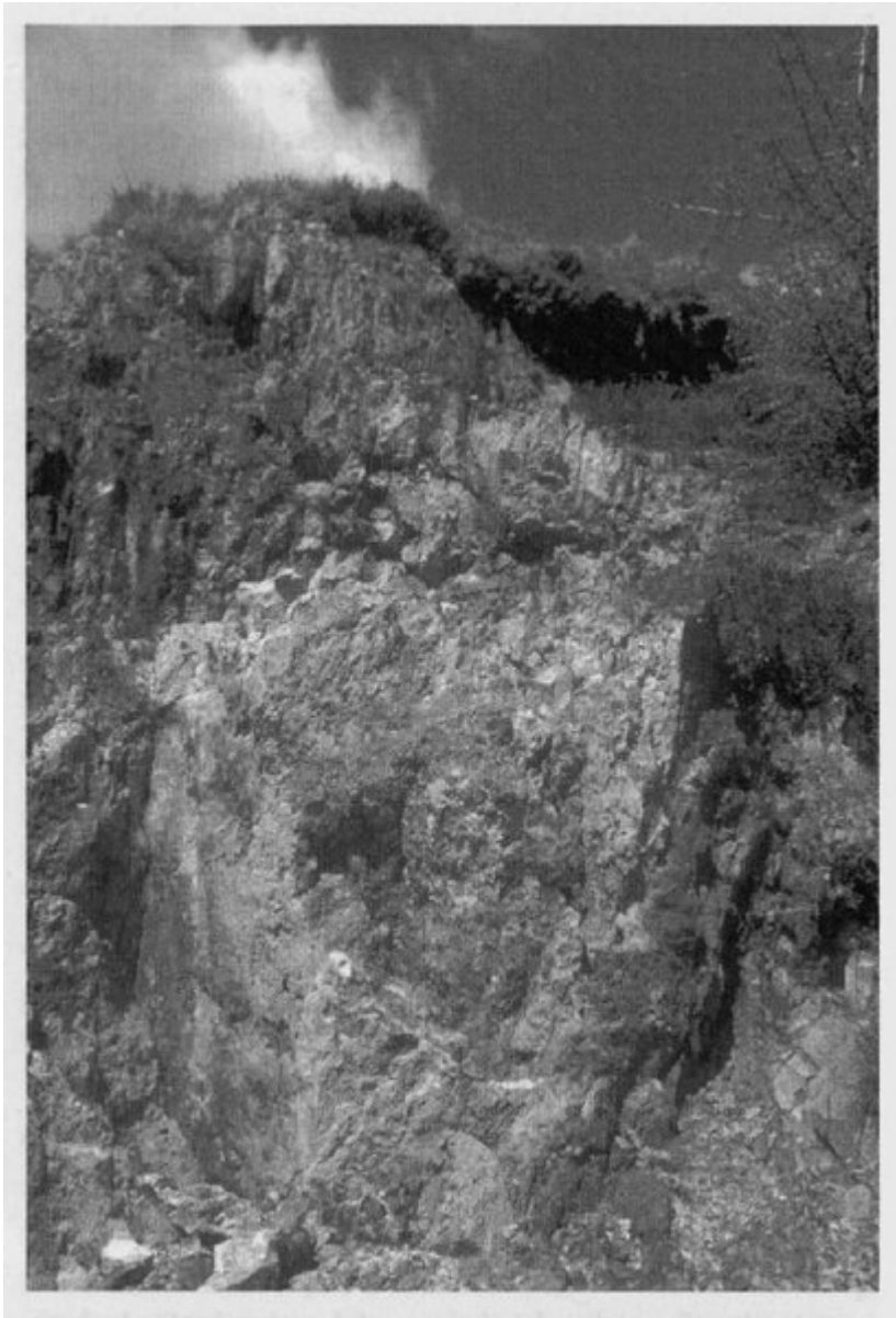
(Figure 5.15) Photograph of the Moel Hafod-Owen GCR site.