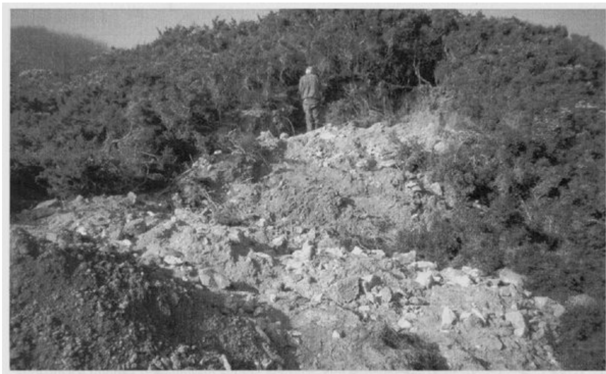
(Figure 7.50) Wheal Alfred.