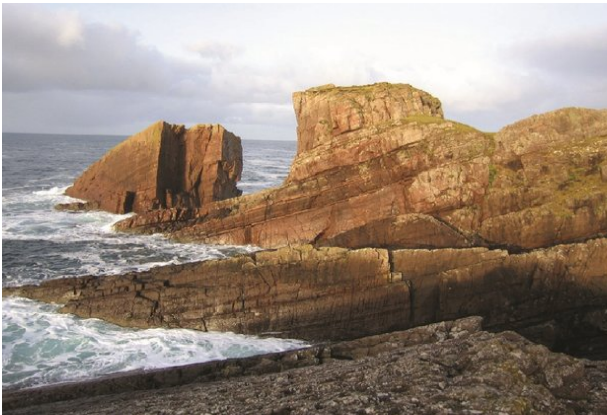
(Figure 31) A' Clach Thuill, the Split Rock, formed of sandstone of the Bay of Stoer Formation.