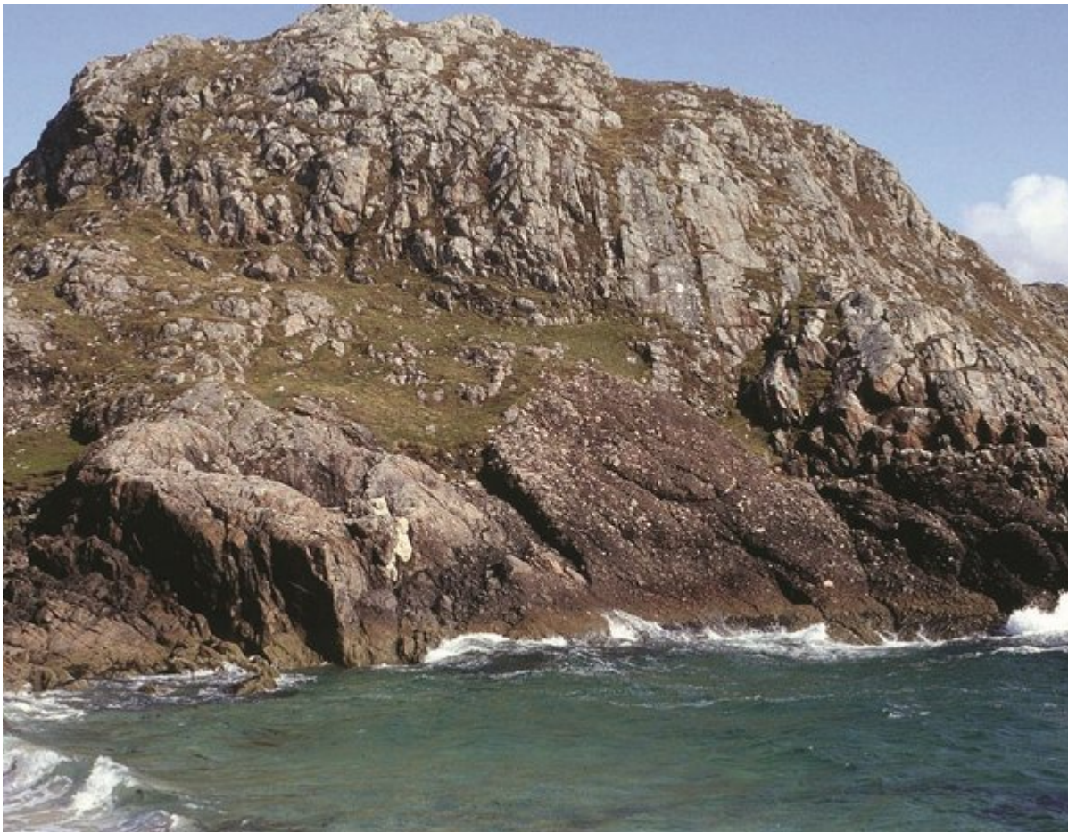
(Figure 30) Basal breccia of the Stoer Group in a palaeovalley (centre) resting unconformably against Lewisian gneiss on both sides.