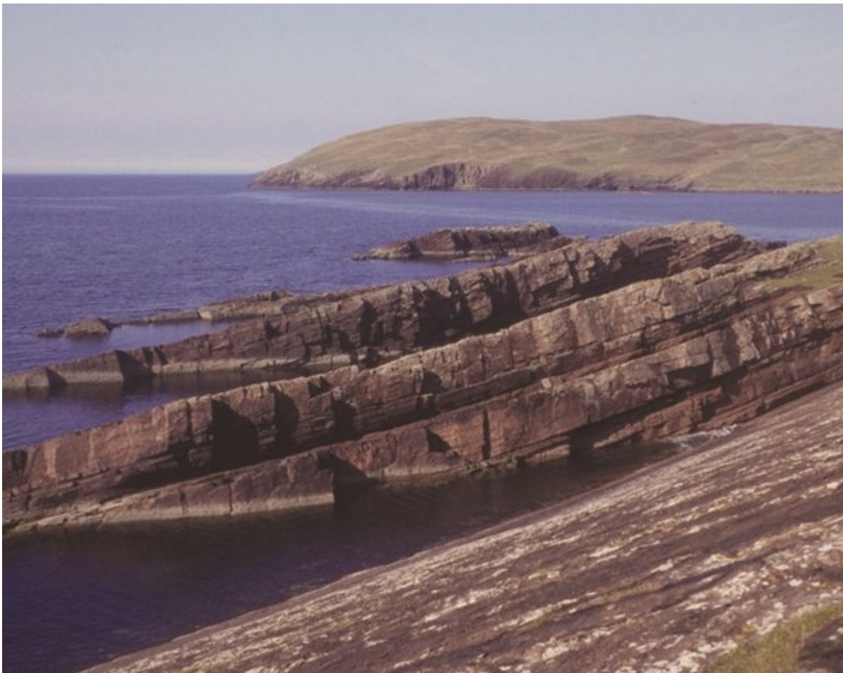
(Figure 33) Outcrops of the Bay of Stoer Formation, containing alternating mudstone and sandstone beds, at Locality 3.6.