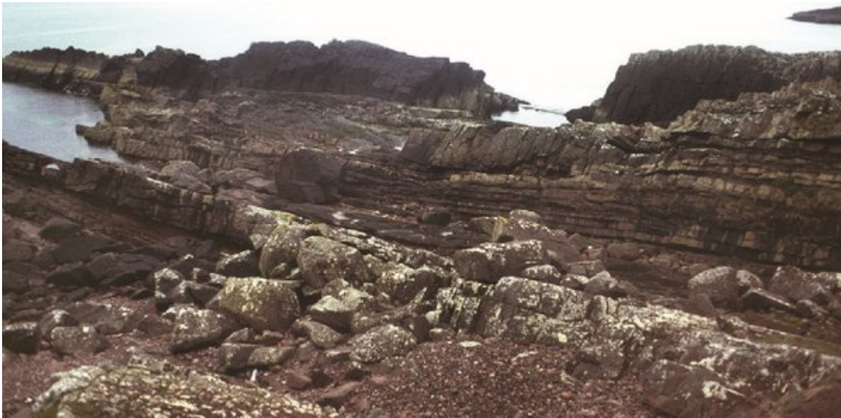
(Figure 35) Outcrops of the Stac Fada Member on the Stac Fada peninsula.