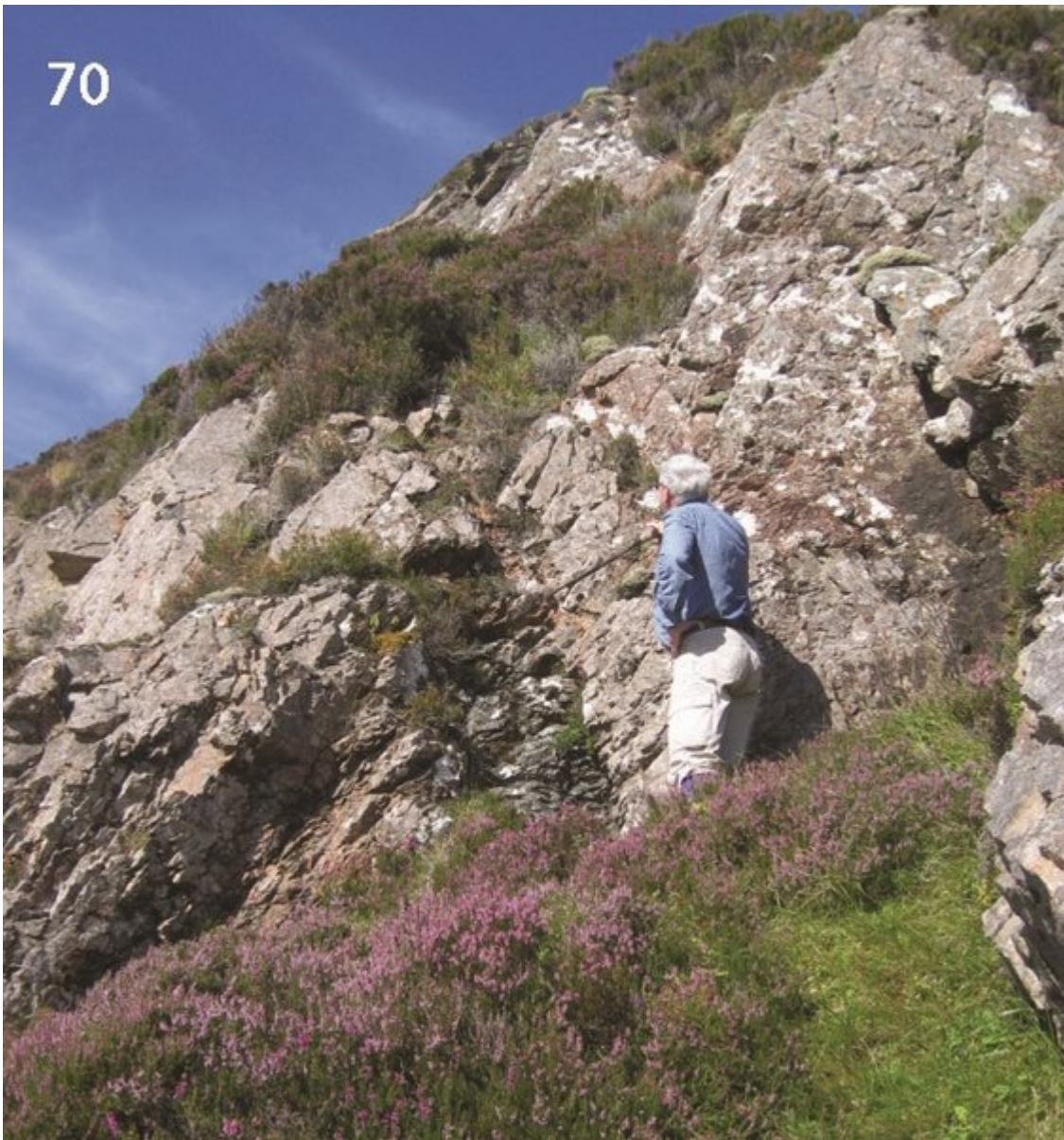
(Figure 70) The overturned, steeply dipping unconformity between Lewisian gneiss and Basal Quartzite Member in the Cam Loch Klippe. The geologist's hand is resting on Lewisian gneisses, but immediately to his left is the weathered-out unconformity, with Basal Quartzite outcrops further left.