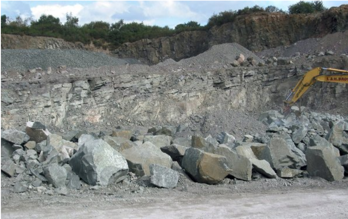
(Plate 15.3) Locality 15.5. Bedded sandstone and mudstone dipping under andesitic lava flows of the Ochil Volcanic Formation, Friarton Quarry.