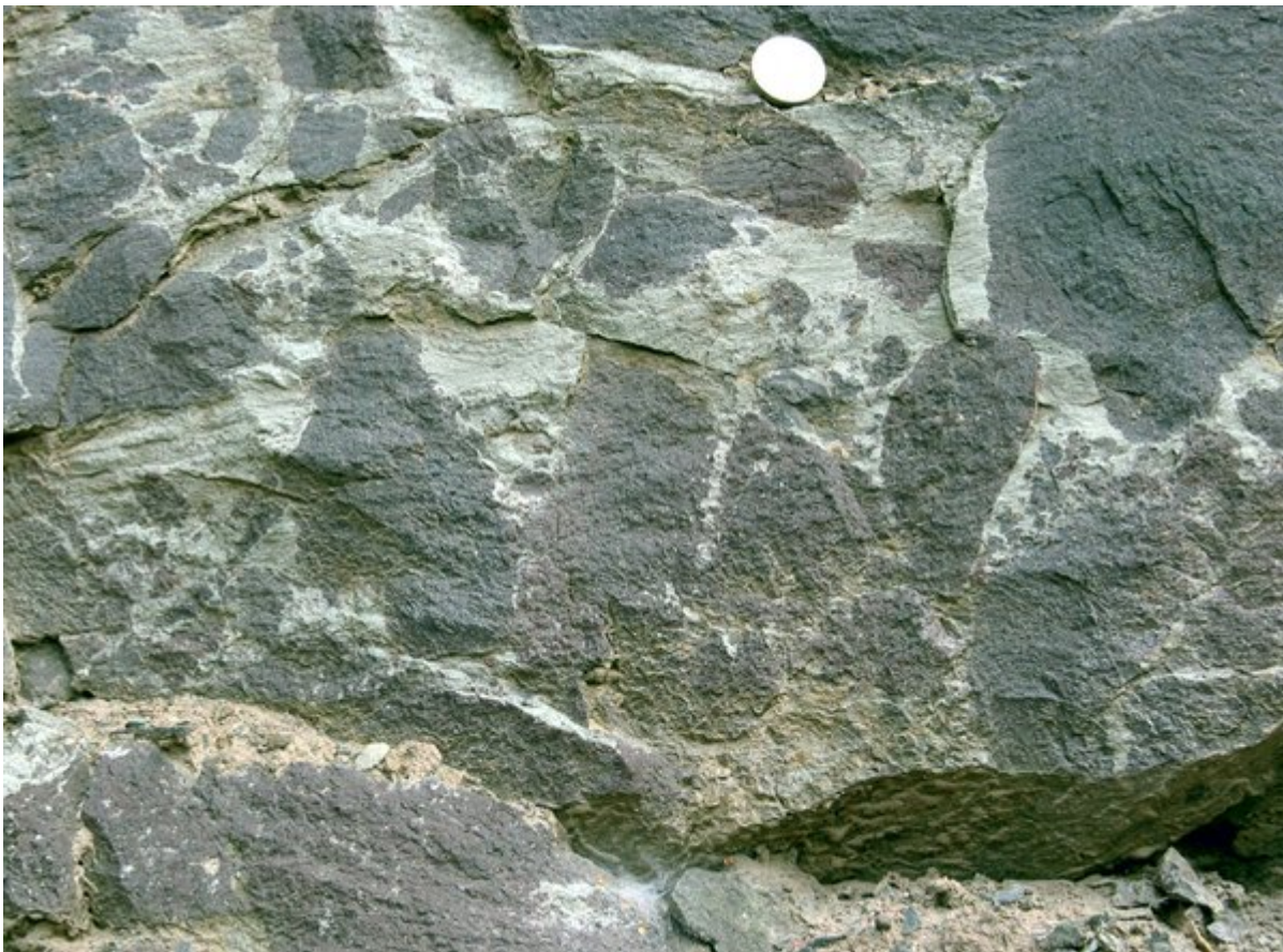
(Plate 15.4) Locality 15.5. Detail of loose block showing subangular to well-rounded masses of fine-grained igneous material within a matrix of green silty sandstone—peperitic texture as a result of injection of magma into wet, unconsolidated sediment, Friarton Quarry.