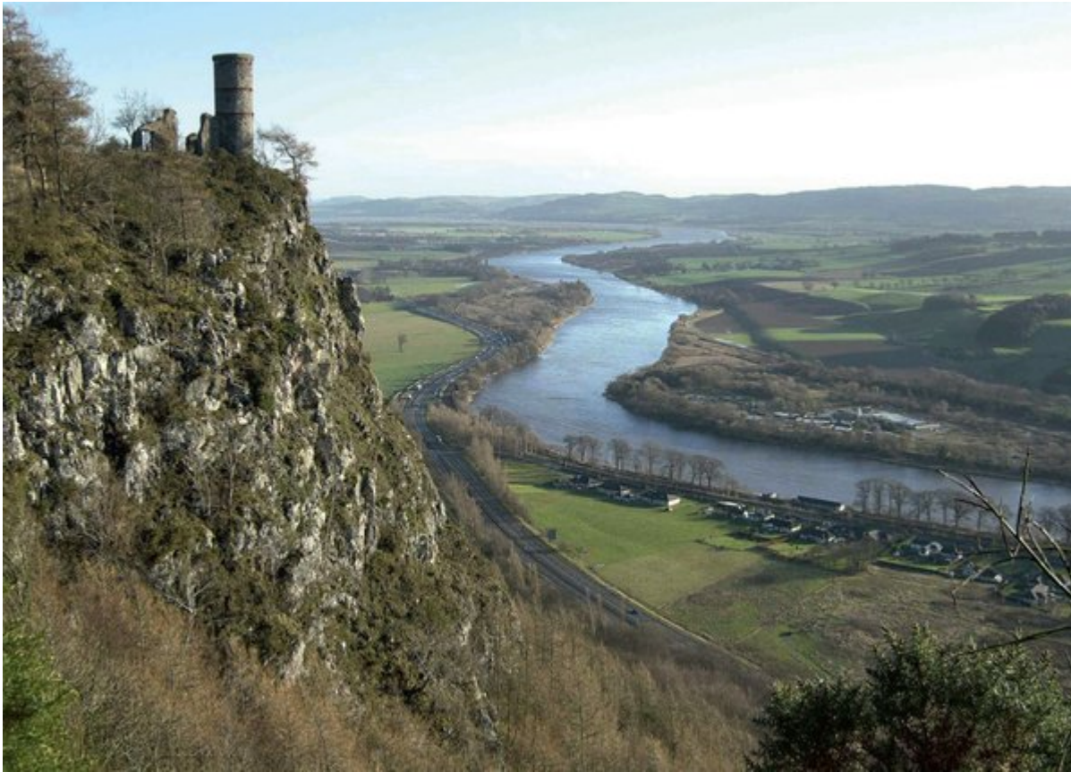
(Plate 15.1) Locality 15.2. Kinnoull Hill viewpoint – Ochil Volcanic Formation, North Tay Fault scarp and view eastwards towards Tay estuary.