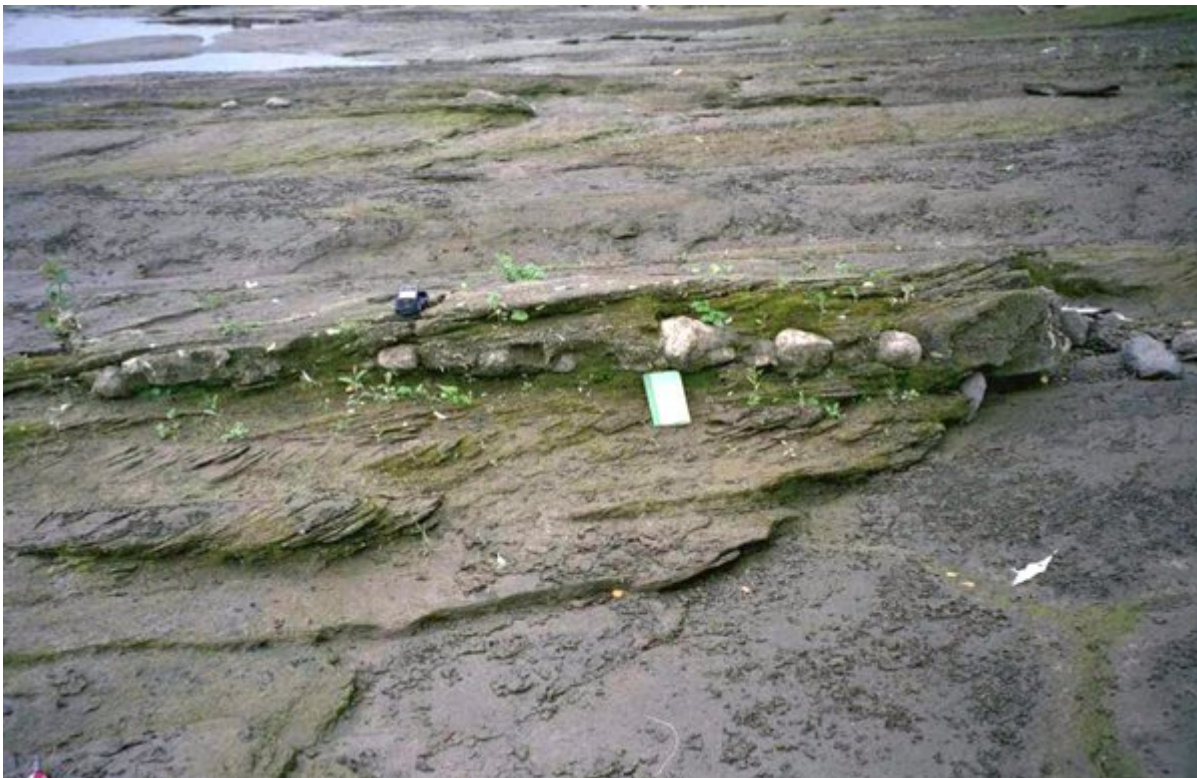
(Plate 15.2) Locality 15.4. Trough cross-bedding and calcrete nodules in Scone Sandstone, River Tay, Scone Palace.