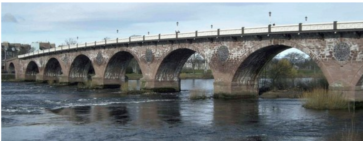
(Plate 16.3) Locality 16.5a. Smeaton Bridge; sandstone from Scone Sandstone Formation, Quarrymill.