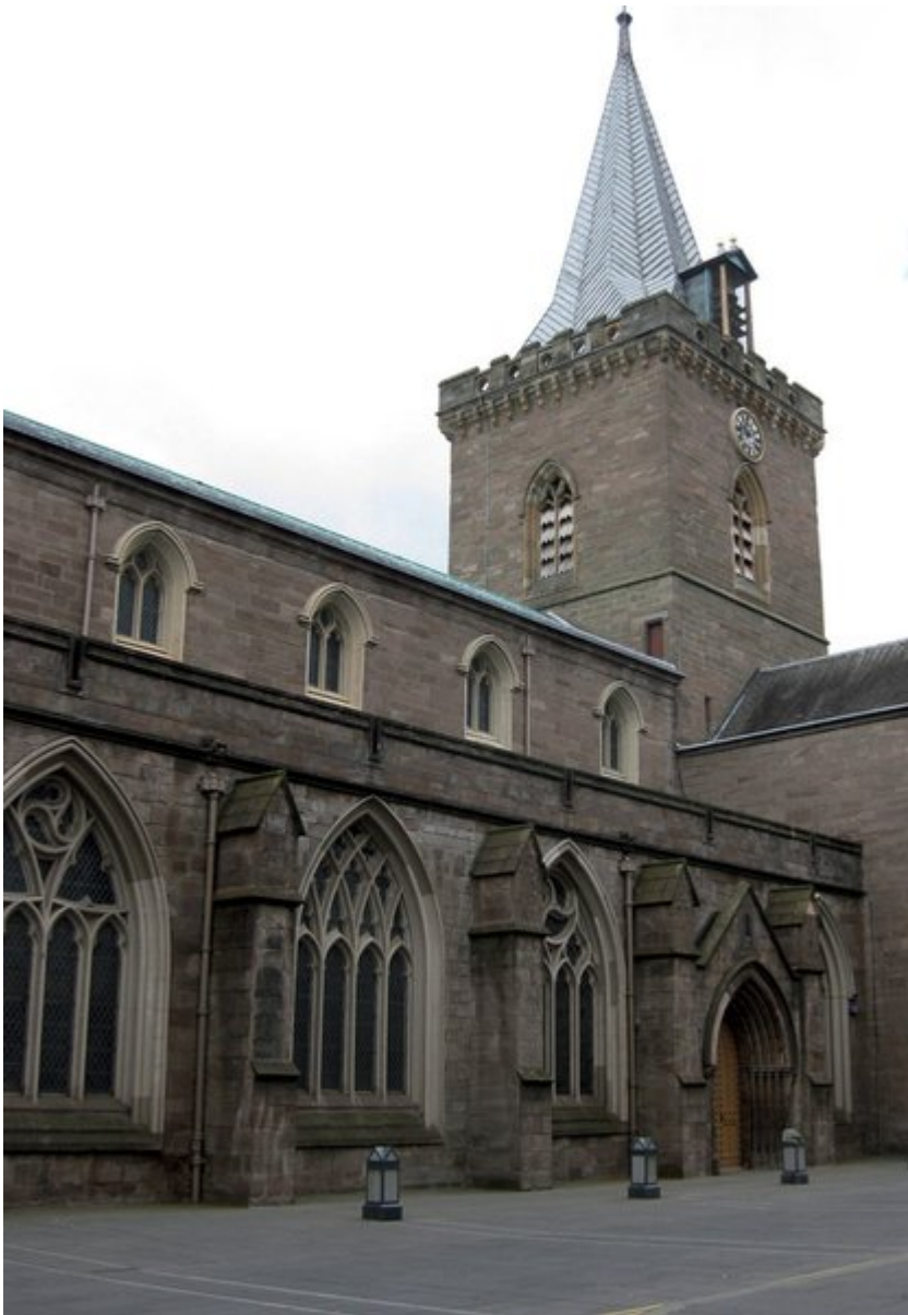
(Plate 16.1) Locality 16.1. St John's Kirk; sandstones from various quarries in Scone Sandstone Formation.