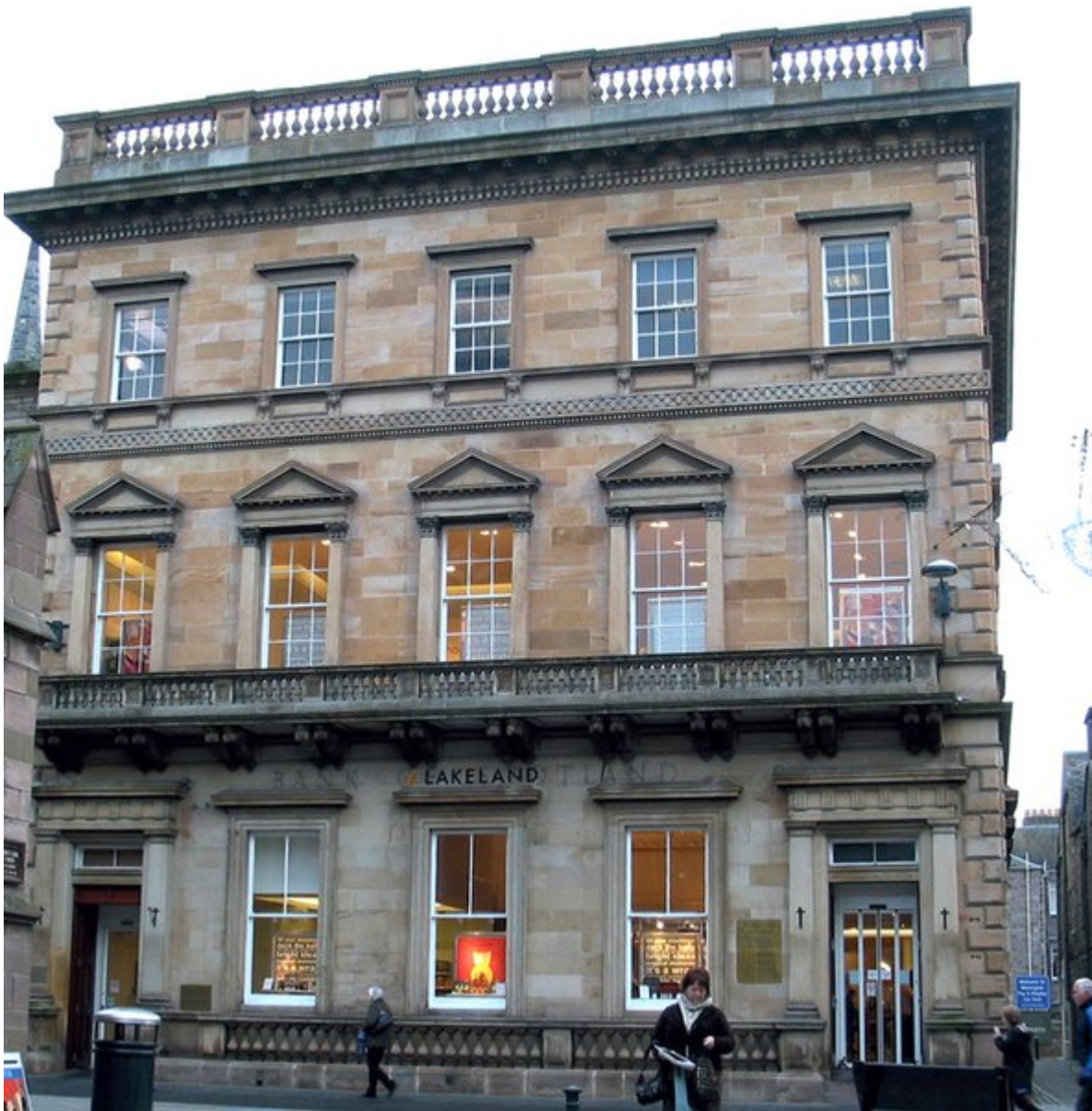
(Plate 16.2) Locality 16.2c. Former Bank of Scotland; blonde Carboniferous sandstone.

(Plate S.13) Perth Old City Hall, built of Lower Devonian sandstone from Leoch Quarry, West Dundee. See Excursion 16.