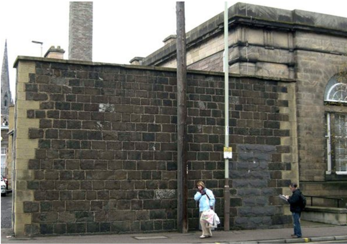
(Plate 16.4) Locality 16.11. Wall of demolished former town jail; quartz-dolerite from Lamberkine Quarry.