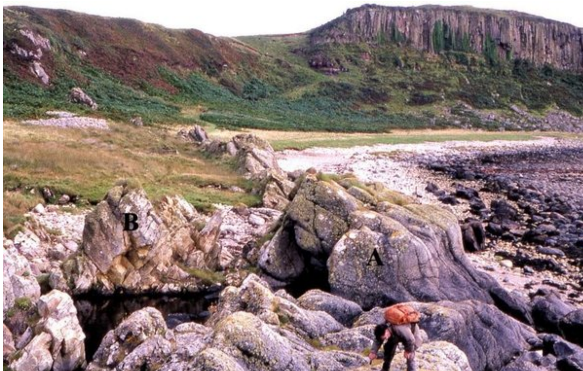
(Figure 4) View from Cleiteadh nan Sgarbh towards the Drumadoon Sill. A — felsite; B — quartz-feldspar porphyry

Geological Society of Glasgow Excursion Itineraries