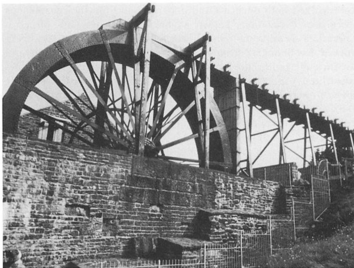
(Figure 14.2) Restored overshot wheel, Killhope Lead Mining Centre, Weardale.