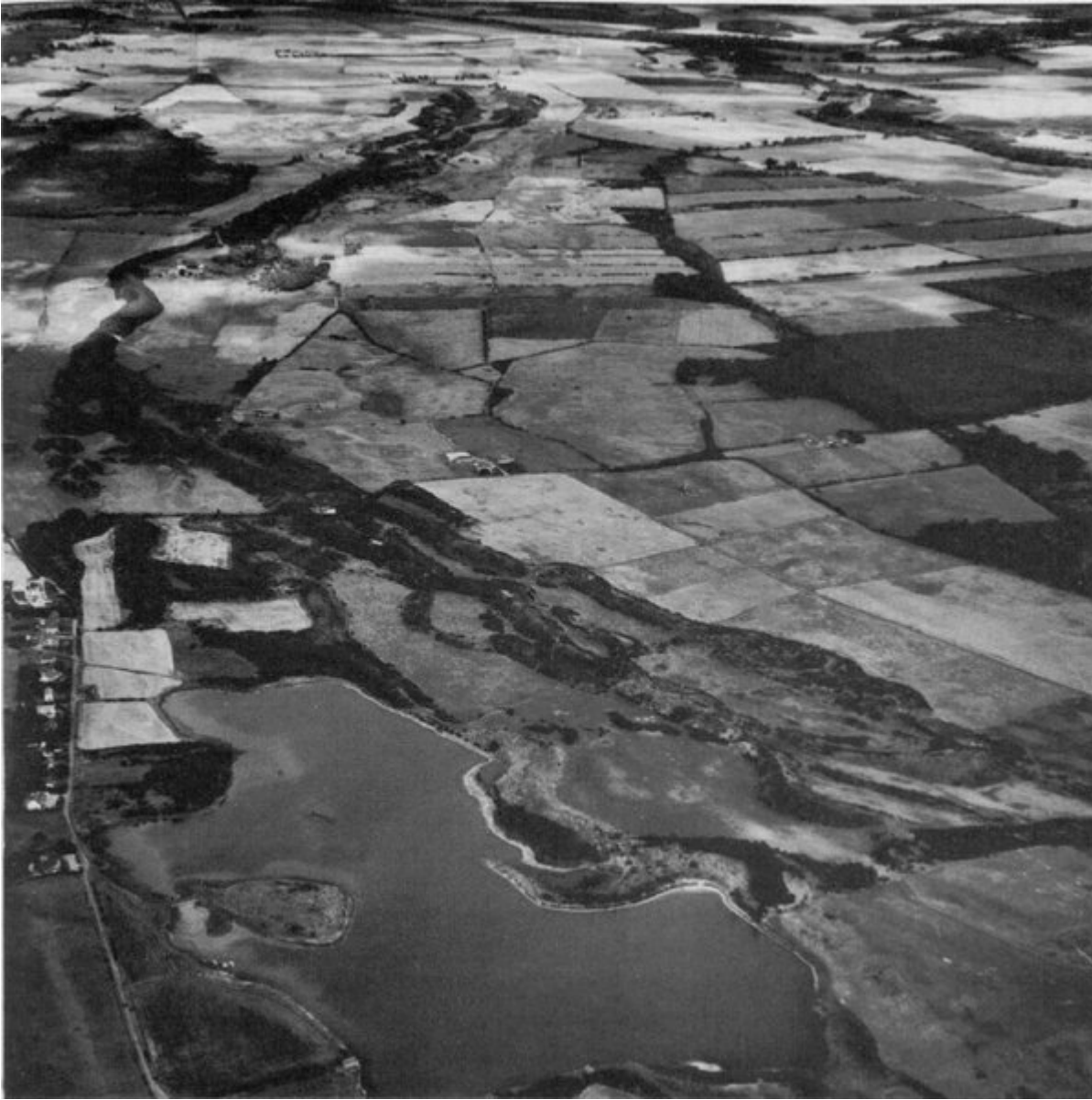
7.12 The Kildrummie Kames esker system viewed towards the east. Two areas of braided ridges (right foreground and centre distance) are linked by a single ridge.