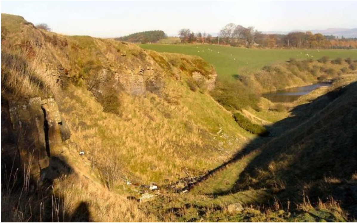
(Figure 96) View north from Hilderston Quarry [NS 9908 7135] (WLGS 28) to Hilderston Silver Mine [NS 9917 7158] (WLGS 29). Silver was worked here intermittently from 1606 to the late 1800s.