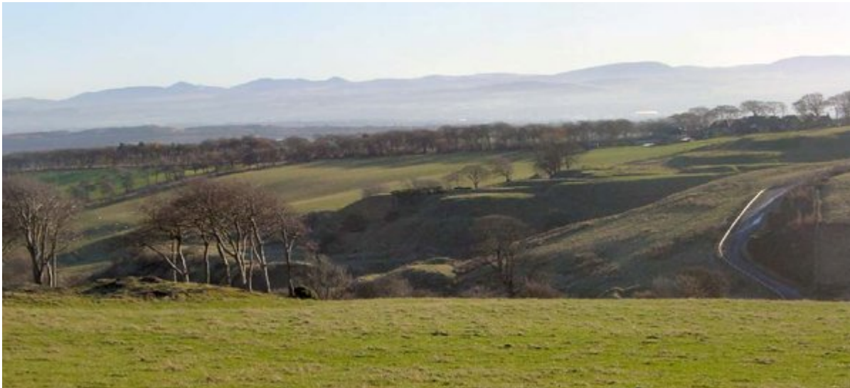
(Figure 95) View south-east from Cairnpapple Hill (WLGS 20) to Hilderston Silver Mine and Quarry [NS 9908 7135] (WLGS 28). Pentland Hills in distance.

(Figure 99) Hilderston Quarry [NS 9908 7135] (WLGS 28). A: Thalassinoides trace-fossils. B: Small-scale cross-bedding in sandstone, Lower Limestone Formation.