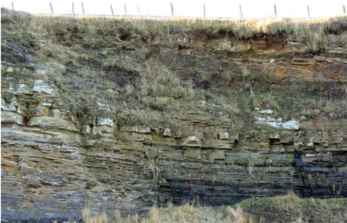
(Figure 98) Main quarry face at Hilderston Quarry [NS 9908 7135] (WLGS 28). Excellent coarsening upward sequences in mudstones, siltstones and sandstones of the Lower Limestone Formation above Petershill Limestone.