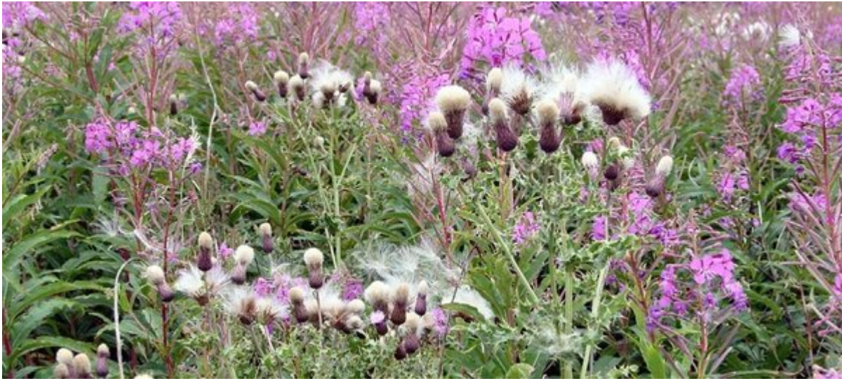
(Figure 105) Thistle and Willowherb at Hillhouse Quarry and Mine [NT 0046 7487] (WLGS 30).