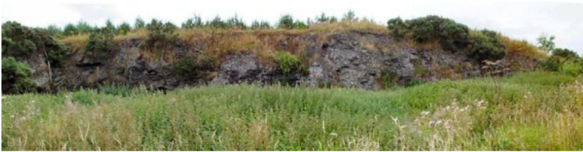
(Figure 106) Small quarry to the north-west of the mine, Hillhouse Quarry and Mine [NT 0029 7517] (WLGS 30).