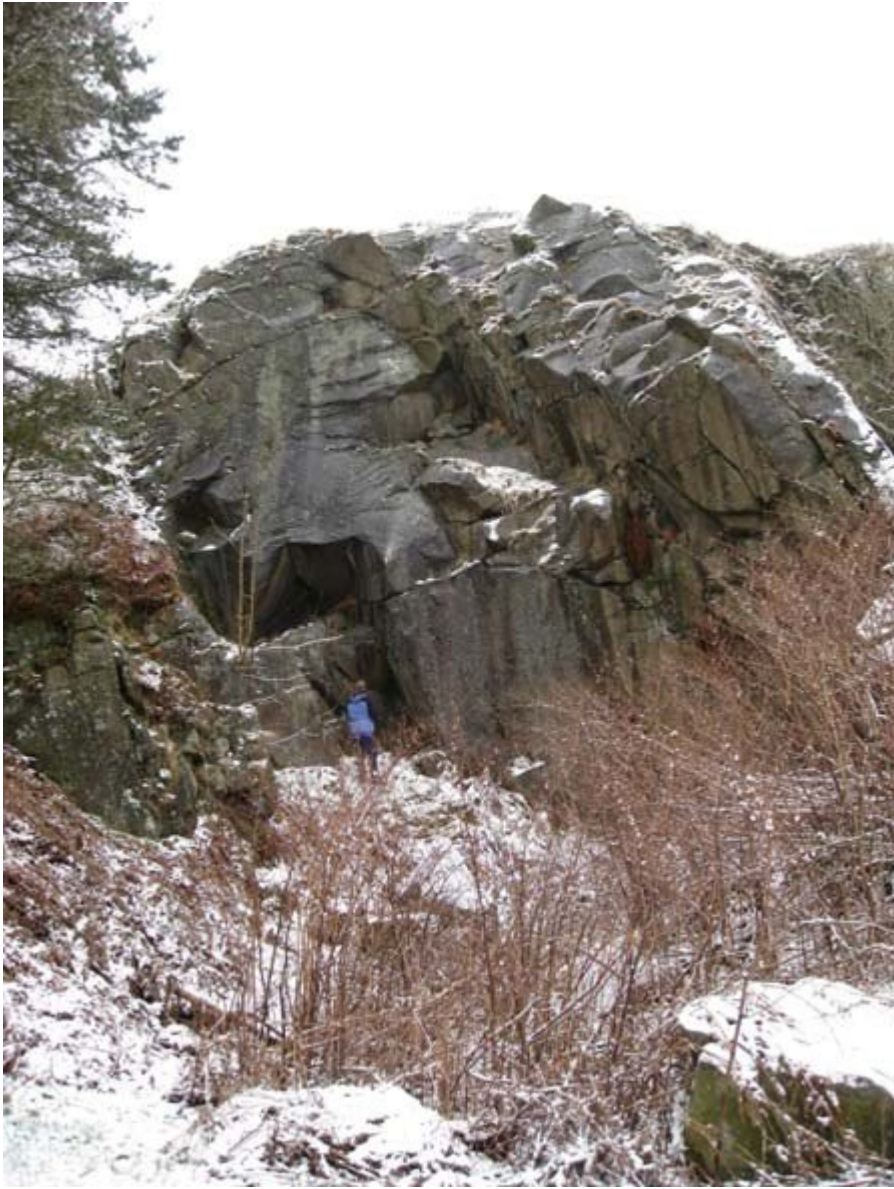
(Photo 8) Quarry face on the southern side of Castle Hill. Note the massive nature of the quartz- microgabbro intrusion. Looking N.