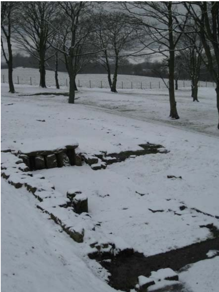
(Photo 7) Although the source of the stone used to build the Roman fort is unknown, it is likely to have been quarried locally. View looking W.