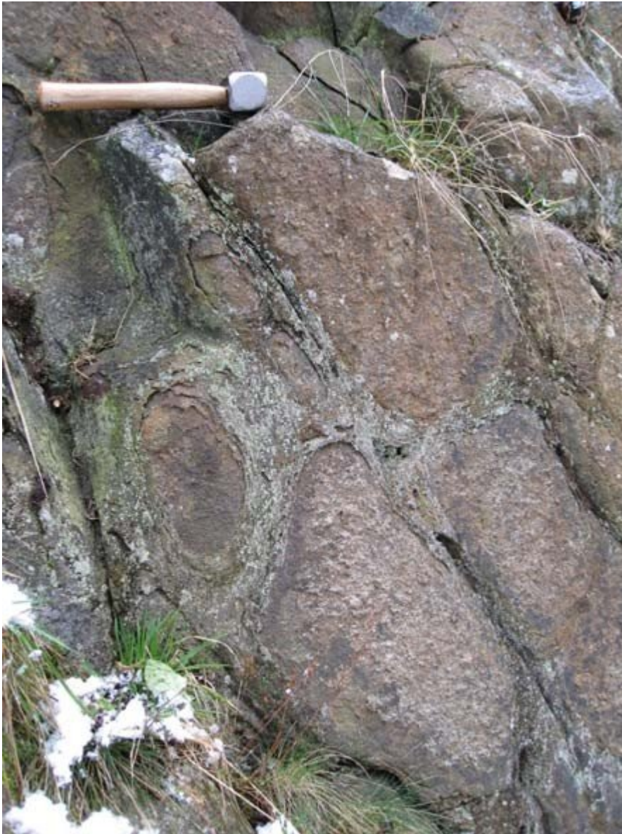
(Photo 9) Good examples of spheroidal or 'onion-skin' weathering can be seen in the quartz-microgabbro.