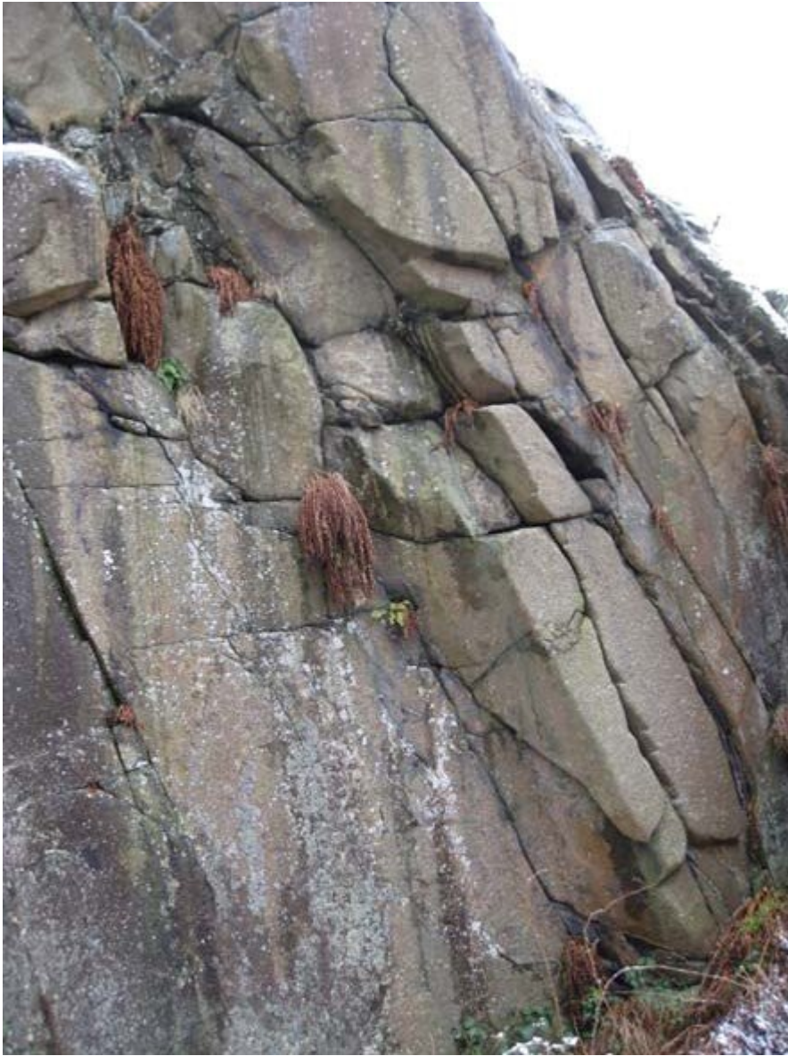
(Photo 10) Widely spaced jointing in the quartz- microgabbro suggests that the quarry is located within the middle part of the intrusion which cooled slowly. Quarry face is approx 5m high. Looking NE.