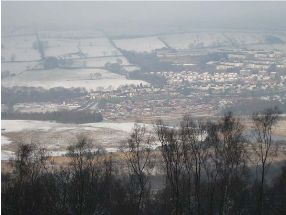
(Photo 11) The resistance of igneous material to erosion means that it often forms high ground; Castle Hill is a typical example. The extensive views from the top of Castle Hill across the Kelvin valley are likely to be a primary reason for the Antonine Wall and the Iron-Age fort being positioned here.