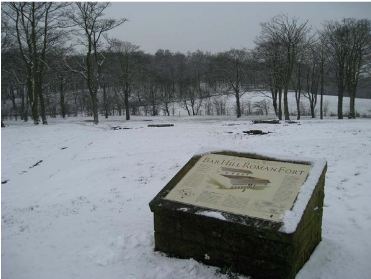
(Photo 6) Information board by Historic Scotland describing the archaeological remains at Bar Hill Roman Fort on the Antonine Wall. View looking SE.