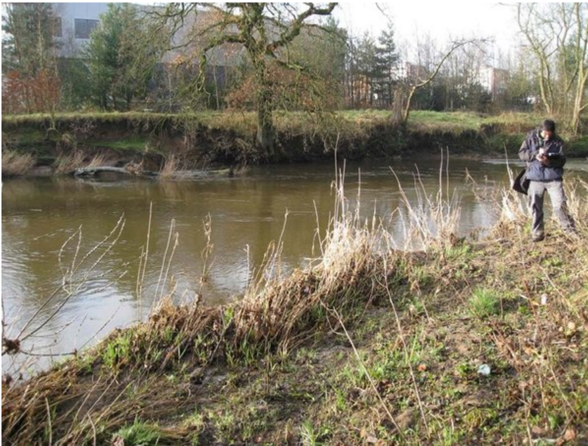
(Photo 31) Looking SW across a meander in the River Kelvin. The foreground contains fine-grained sediment deposited in the slow-moving inside curve of the meander. In contrast, the outside of the meander is subject to erosion and the far bank in the photograph displays the resulting small river-cliff.