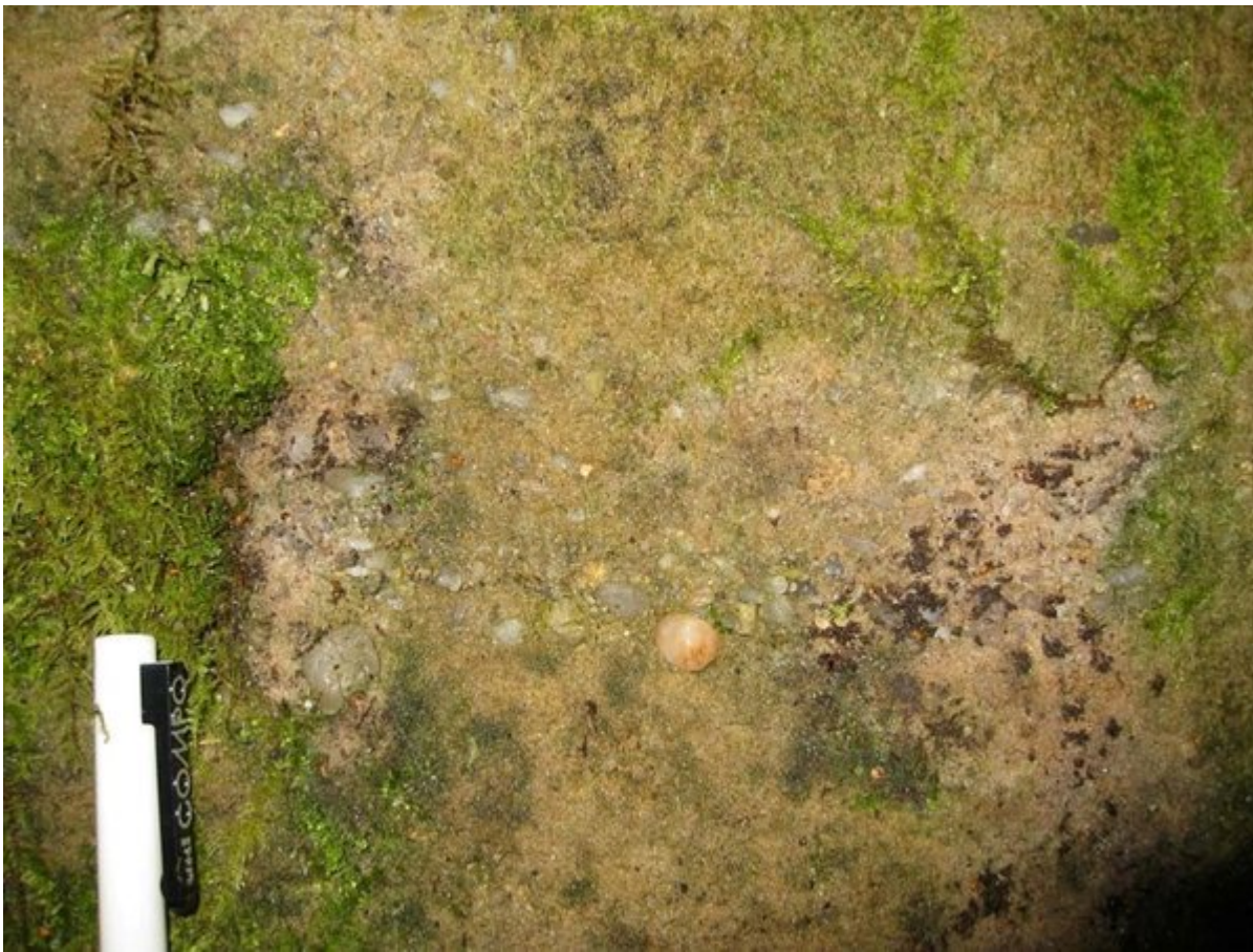
(Photo 51) Massive, coarse-grained 'gritty' sandstone containing scattered white and pink rounded quartz pebbles. Typical exposure of the Douglas Muir Quartz Conglomerate Member. Looking S.