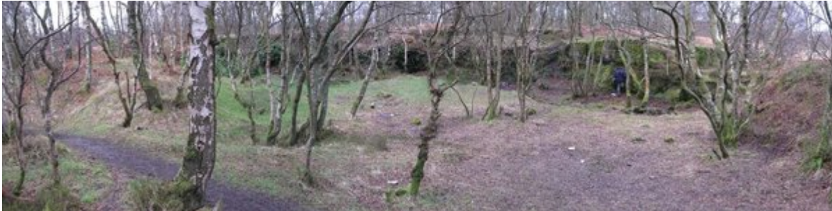
(Photo 52) Panorama of the southern part of Mugdock Quarry, showing the main sandstone faces now partially overgrown. The sandstone from this quarry was used to construct buildings in Milngavie. Most towns and villages in the area are likely to have obtained building stone from local quarries. Differences in the sandstones from quarry to quarry have resulted in buildings throughout the district having slightly different character. Today, stone for repairs is often imported from large quarries which is a poor match to the original quarry source. It is becoming increasingly important to record and where possible safeguard the remaining stone resources at historic quarry sites.