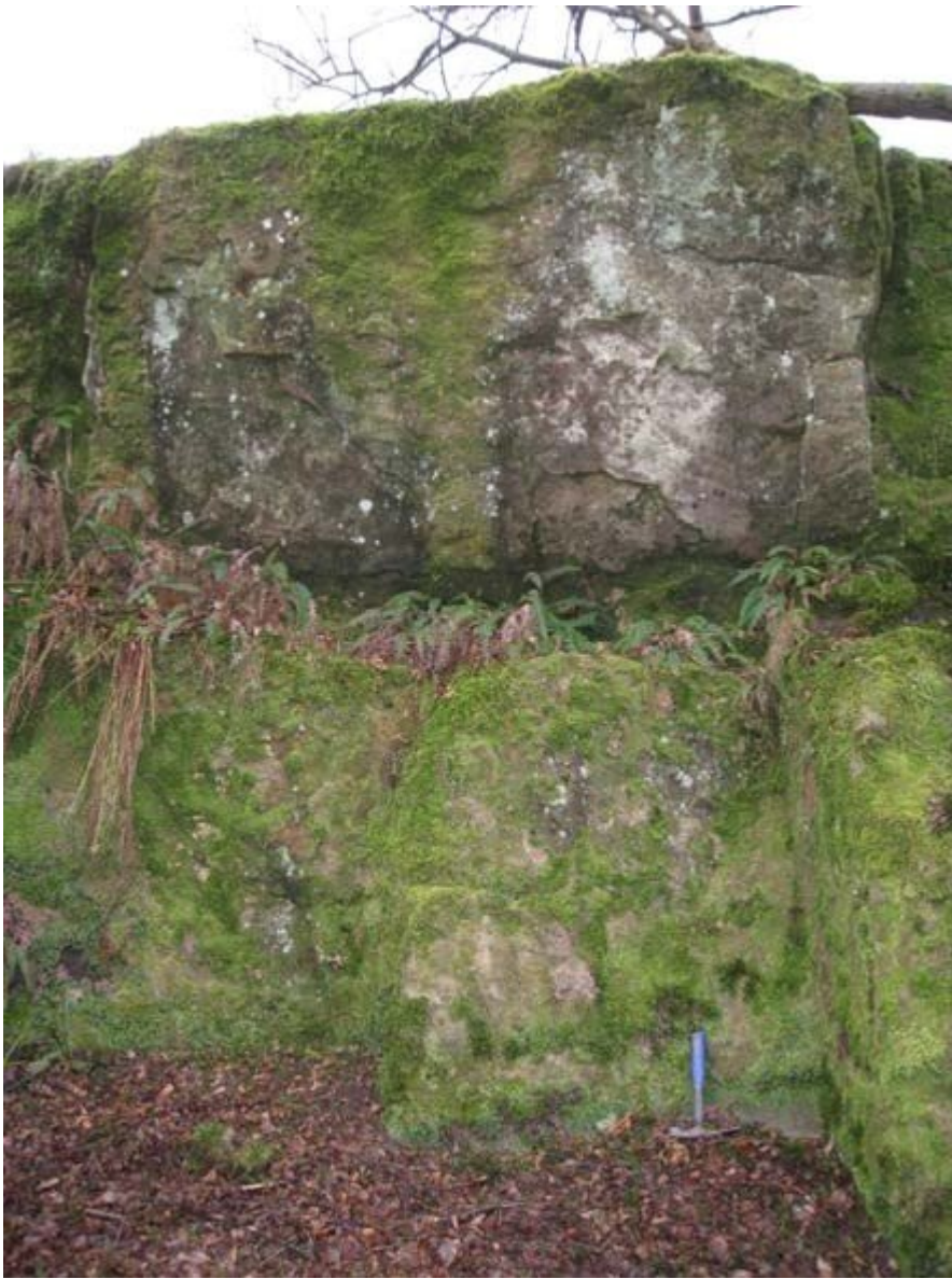
(Photo 50) Thickly-bedded sandstone units in West Mugdock quarry in the southern part of Mugdock Country Park. Looking S.