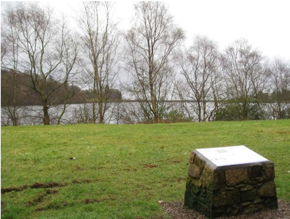
(Photo 53) Information board located at the western end of Mugdock Loch, opposite Drumclog Moor car park. Looking SE.