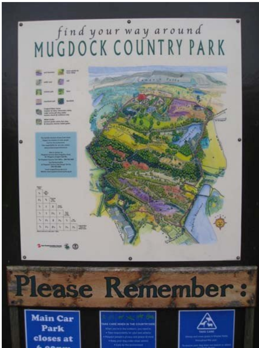
(Photo 49) Site map for Mugdock Country Park, located at the visitor centre (northern part of the park).