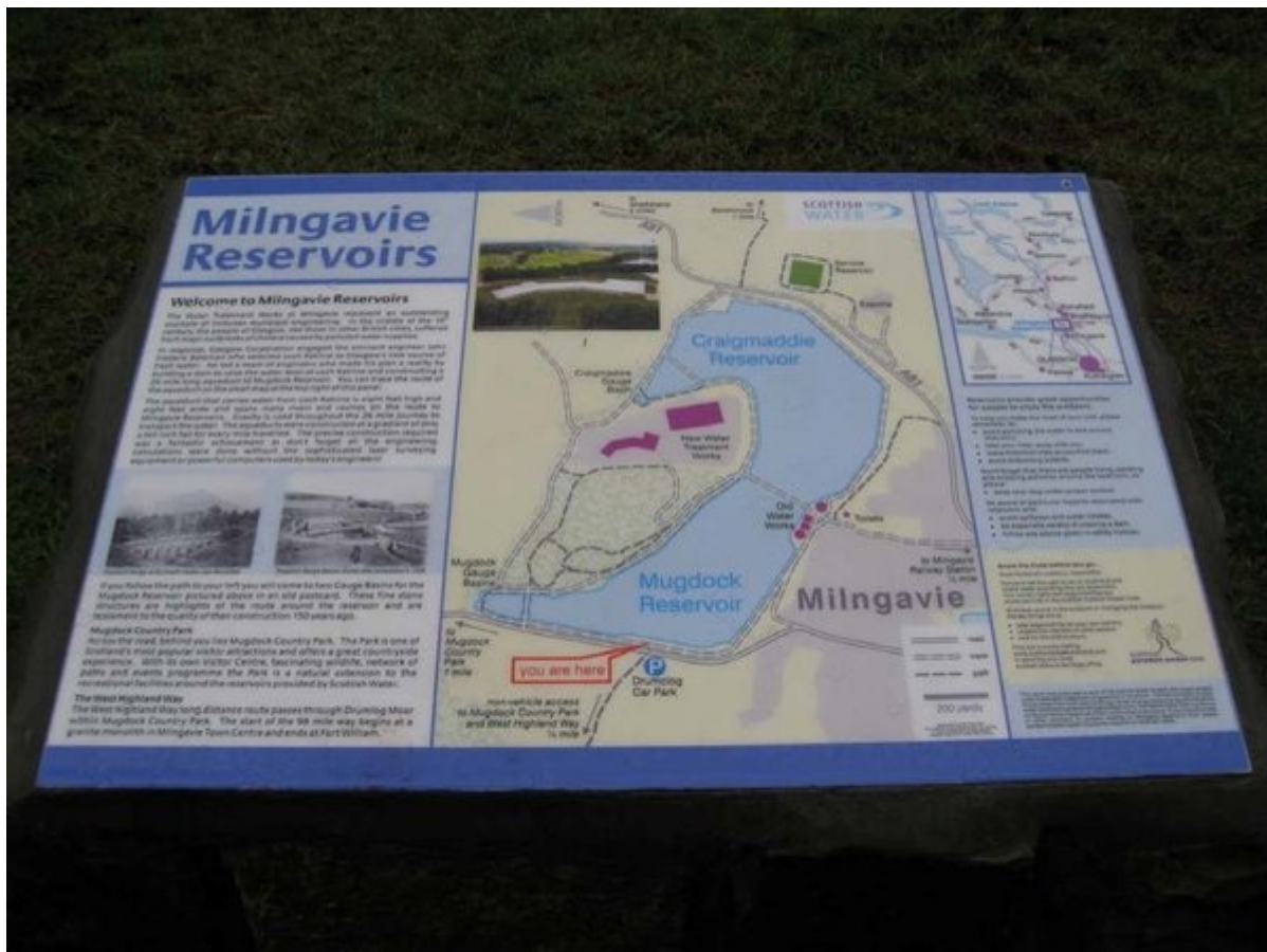
(Photo 54) Close-up of the information board. There is no mention of geology/geomorphology despite this being a primary factor in the location, design and construction of the reservoir.