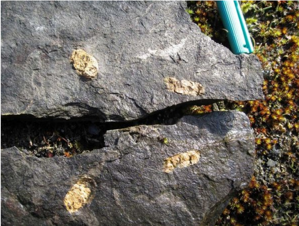
(Photo 67) Pale coloured 'coprolites' (fossilised faecal pellets) within dark mudstones, each containing shiny black fish scales. The size and composition of the coprolites suggests that they are likely to have come from a large predator such as a shark.