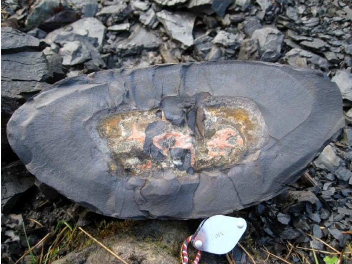
(Photo 64) Ironstone nodules of various sizes can be found lying around the quarry, weathered out of the rock face. Most of these are of iron-carbonate composition and some show 'septarian' structures (internal shrinkage cracks infilled with