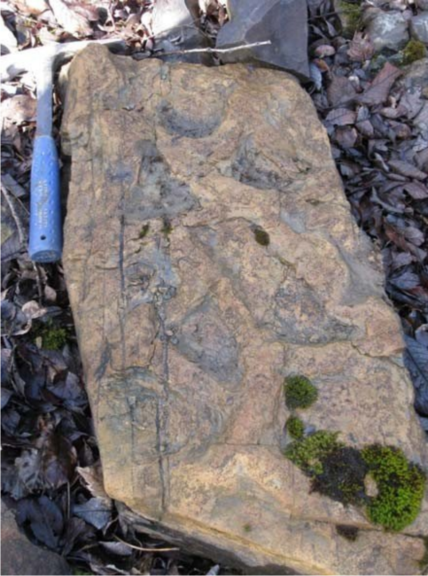
(Photo 65) A fallen block displaying desiccation cracks. The network of ridges on the surface represent infilled cracks which formed as a layer of mud dried out when the sediments were originally deposited.