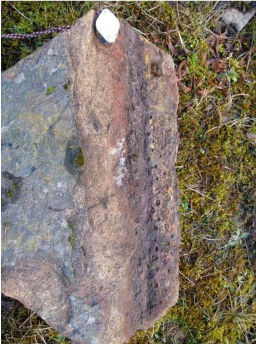
(Photo 69) Fallen block displaying a good example of 'stigma', the fossilised root of a tree. The tiny round holes scattered across the surface of the root are thought to be where smaller rootlets were attached.