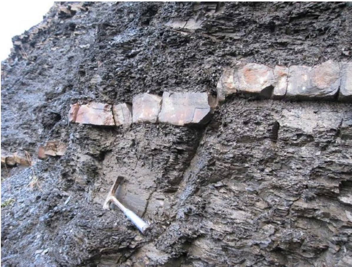
(Photo 63) Small-scale faulting is highlighted by an offset ironstone band with a thick sequence of laminated black mudstones. Looking NE.