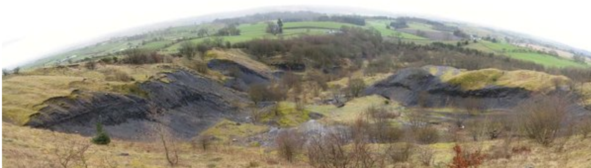
(Photo 62) Panorama across Blairkaith Quarry from the northern edge. This former brick clay pit exposes the Blackhall Limestone and adjacent black mudstones of the Lower Limestone Formation.