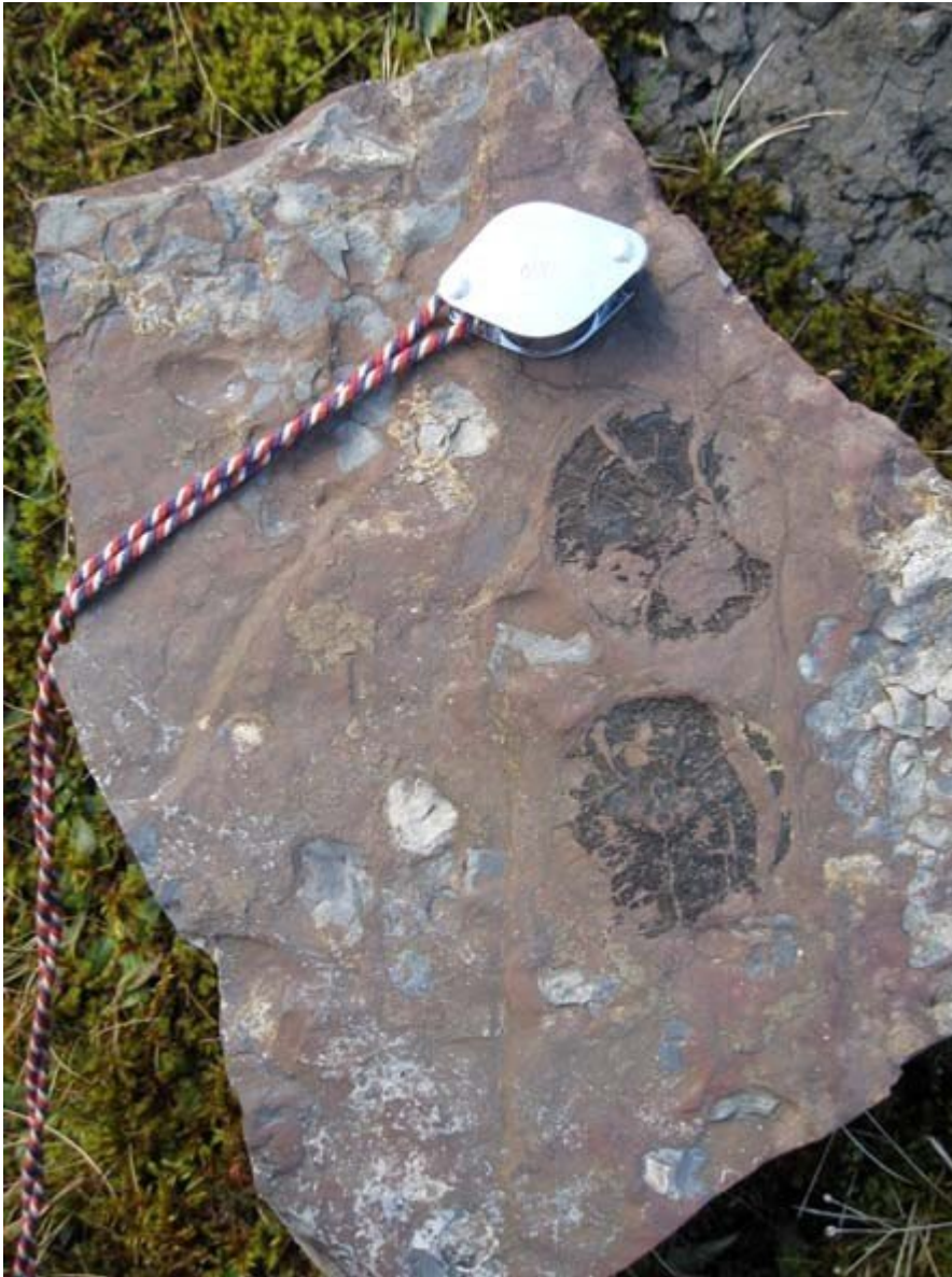
(Photo 70) Fallen block displaying relatively rare examples of 'Ulodendron majus', fossilised fragments of tree bark. The central circular to oval depressions are thought to represent the scars where branches or cones were attached.