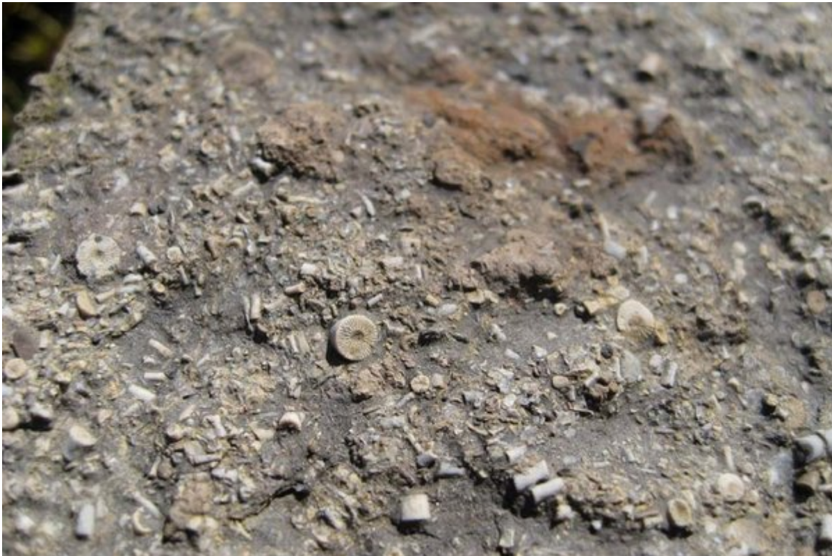
(Photo 68) Fallen block of fossiliferous 'crinoidal' limestone. Most of the fragments visible to the eye are small crinoidal columns which weather proud of the fine-grained lime matrix. The presence of crinoidal fragments suggests that this limestone was formed in fully marine conditions.