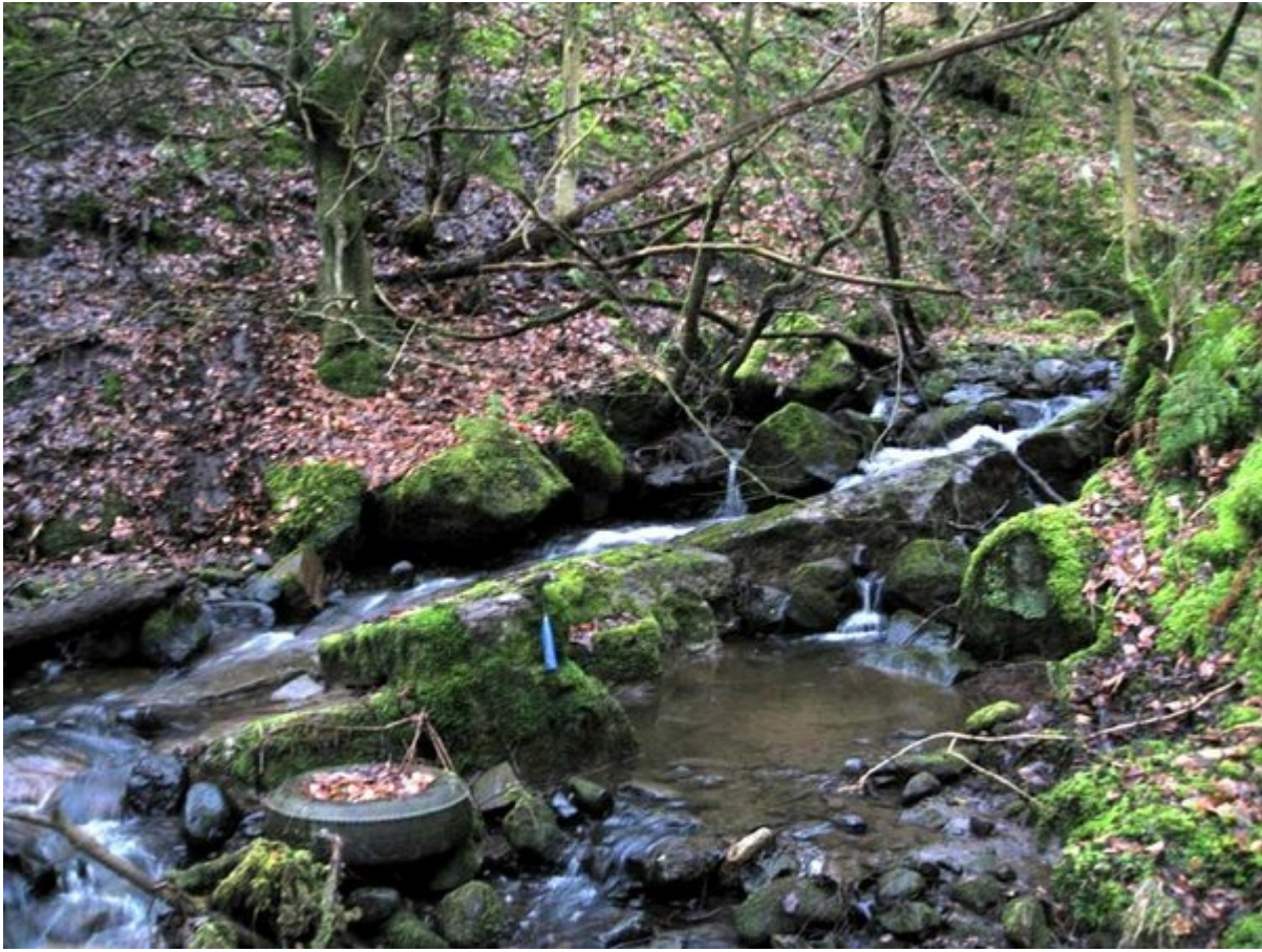
(Photo 84) Beds of crinoidal limestone outcropping in the stream. Looking SW.