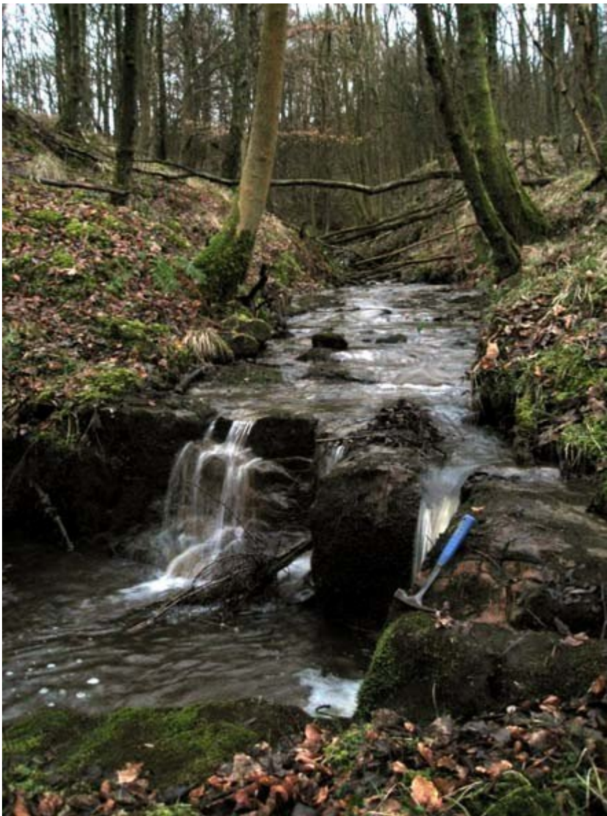
(Photo 85) A more resistant limestone bed forms a small waterfall in the stream. Looking WSW.