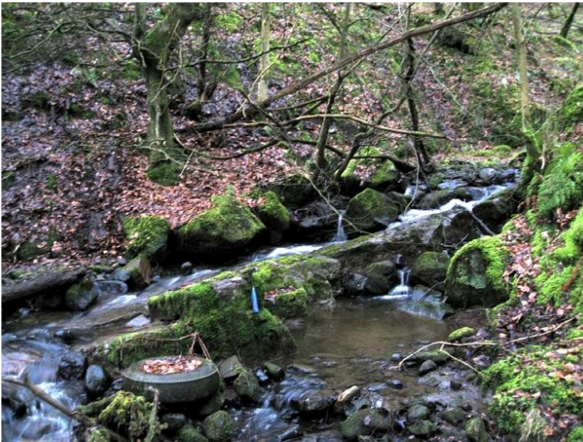
(Photo 84) Beds of crinoidal limestone outcropping in the stream. Looking SW.