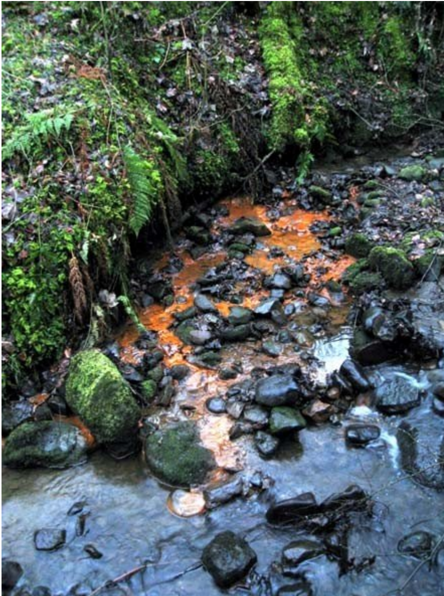
(Photo 86) Iron-rich water issuing from the bank- side. Looking SSE.