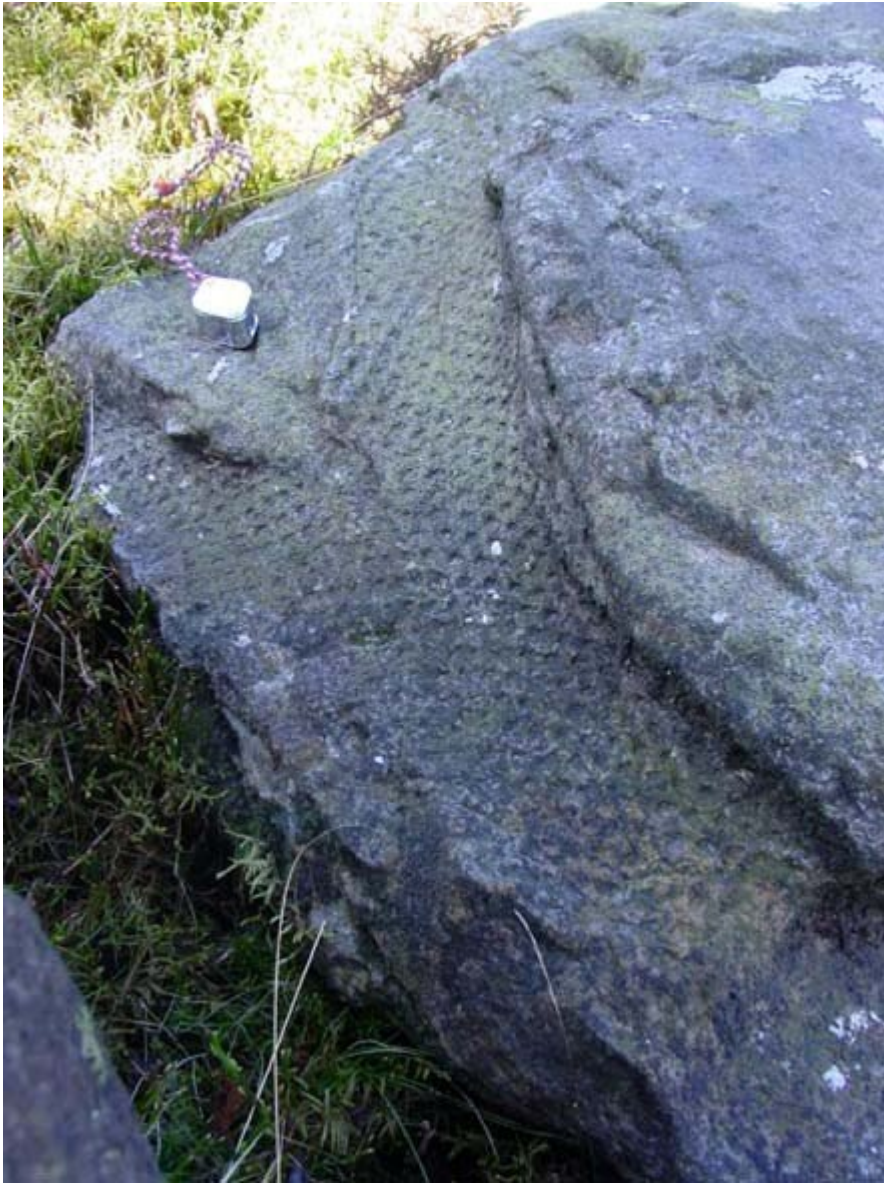
(Photo 88) Fallen block displaying an excellent example of the fossilised plant root 'stigmara'. The pitted surface represents where individual rootlets were attached.