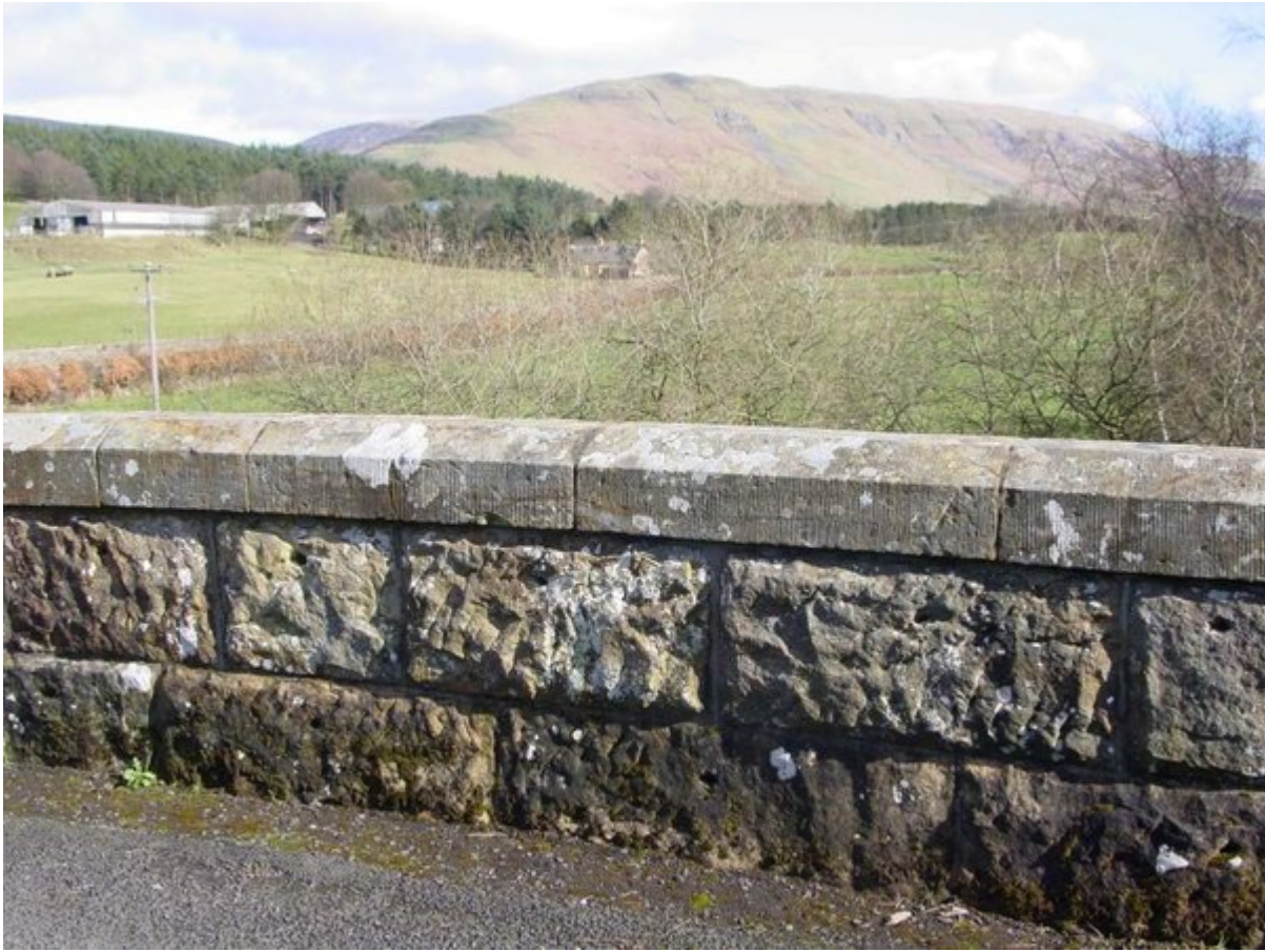
(Photo 93) Detail of the sandstone masonry used to build the road bridge over the railway. Looking.