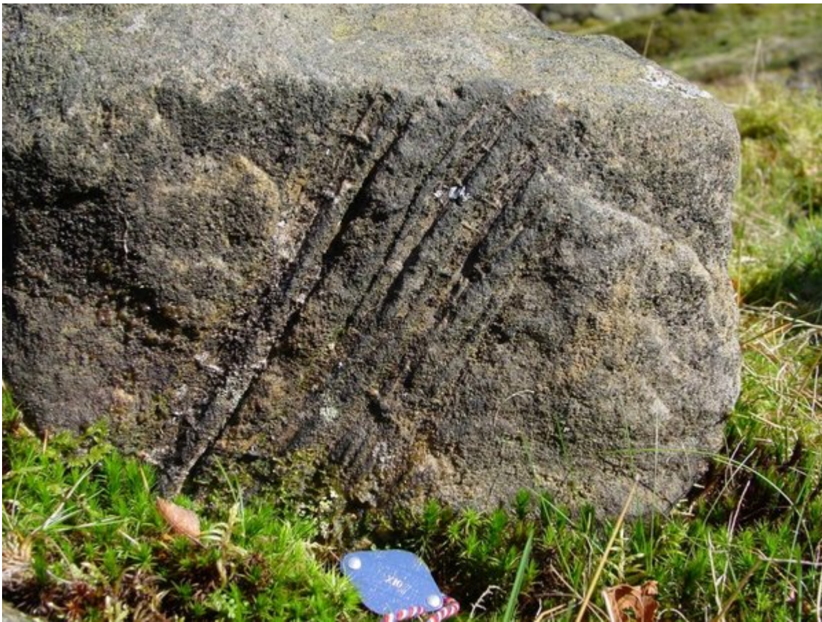
(Photo 89) A fallen block displaying an example of Lepidodendron , a fossilised tree trunk. The markings on the stone are the equivalent of the bark on a modern-day tree.