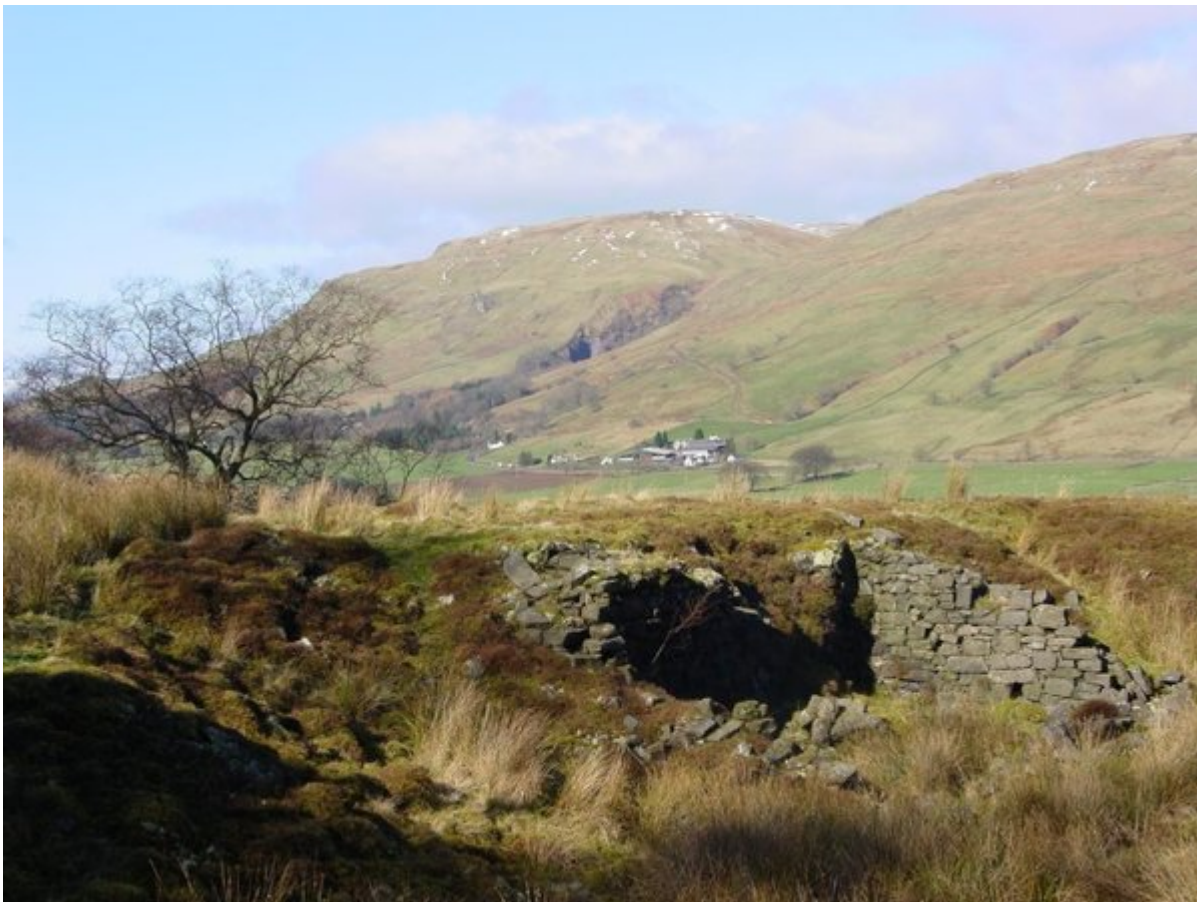
(Photo 90) View from the edge of the quarry looking NW to the Strathblane Hills. The remains of buildings in the foreground probably represent a workmen's hut or similar, built from waste quarry material.