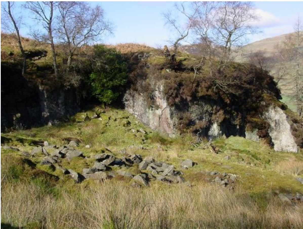
(Photo 91) Thick-bedded sandstone units, up to 4 m high, would have provided a good sized block of sandstone for making building stone. Many of the discarded blocks on the quarry floor show plant fossils. Looking NW.