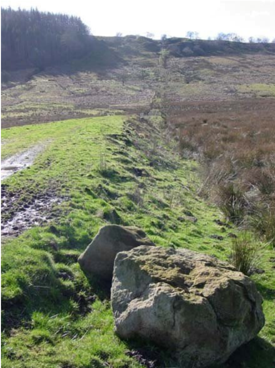
(Photo 87) Looking SSW up the trackway leading from Pattie's Bughts quarry (on the horizon) to Craigend Farm and the railway beyond. The quarry is thought to have supplied stone for the construction of the railway.