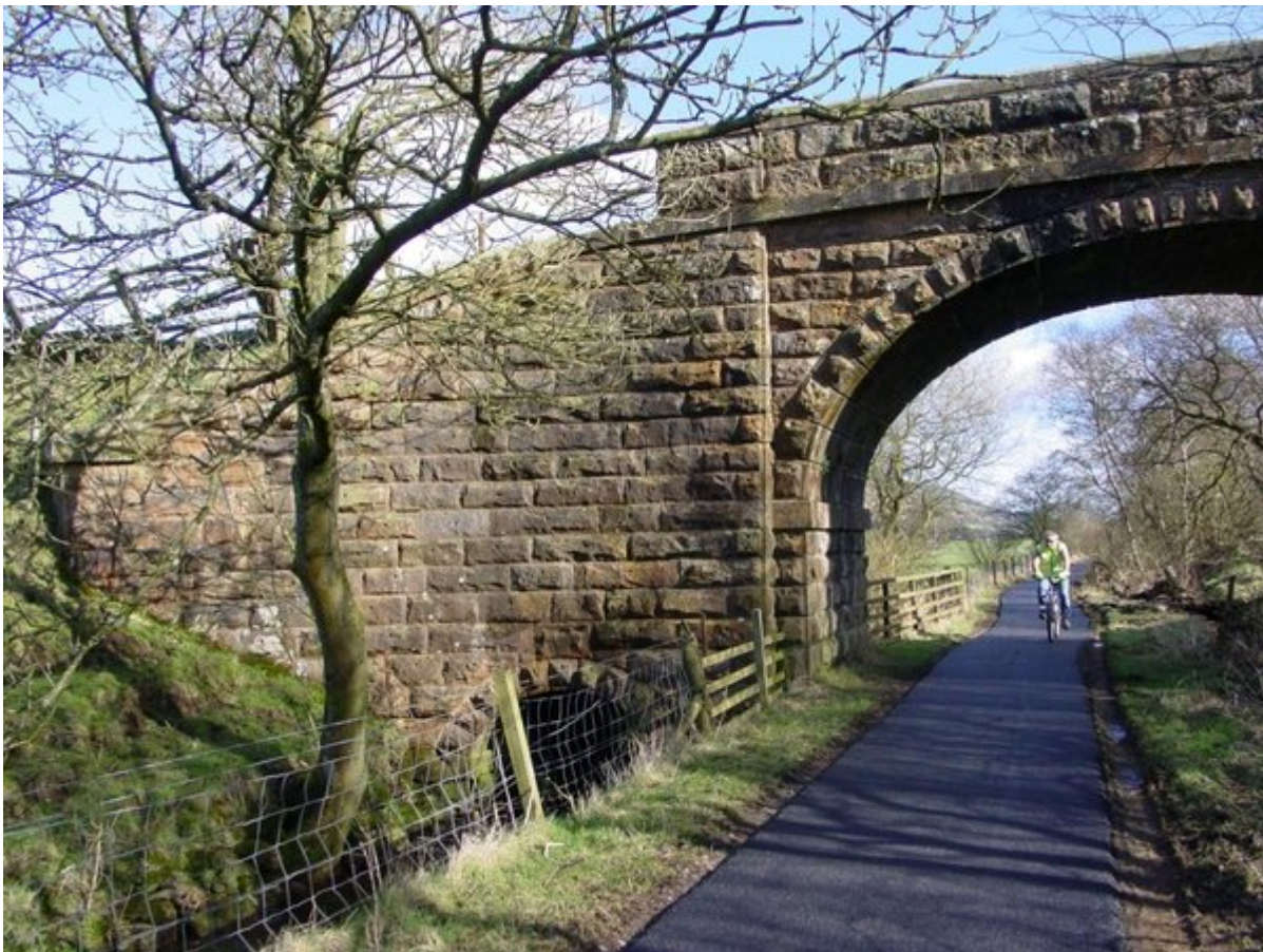
(Photo 92) Road bridge over the old Blane Valley Railway line. Stone for the bridge was likely sourced from Pattie's Bughts Quarry.