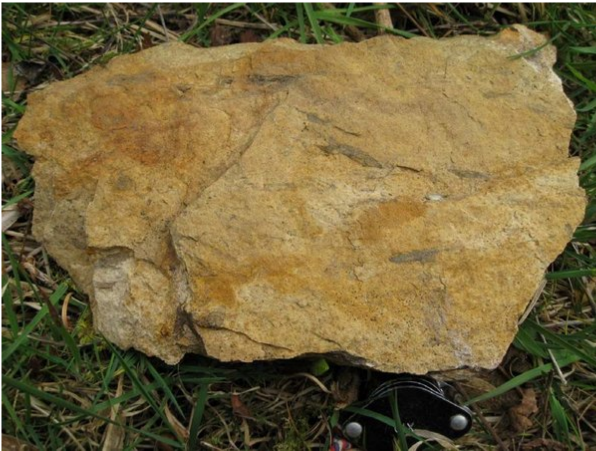
(Photo 188) Close up of the fine-grained, yellowy ochreous weathered sandstone, containing plant fragments and trace fossils.