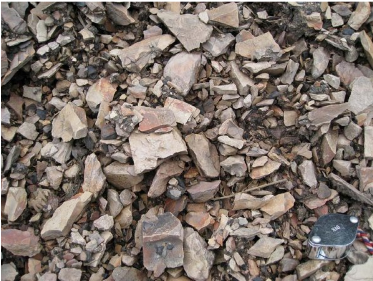
(Photo 192) Close-up of the burnt mudstone on a bing from workings of ?Hurlet Coal etc.