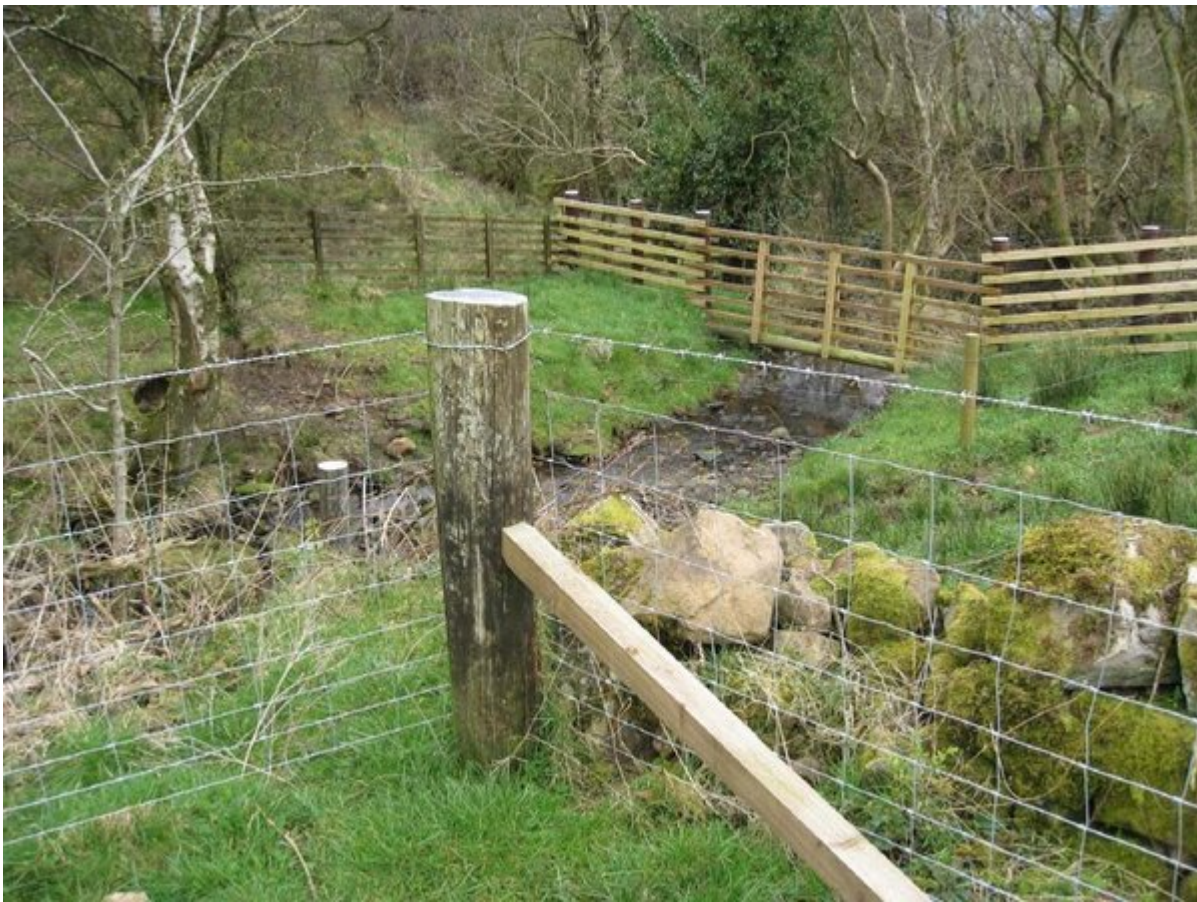
(Photo 194) New fencing above the lower waterfall in Craigen Glen makes access to the geology difficult.