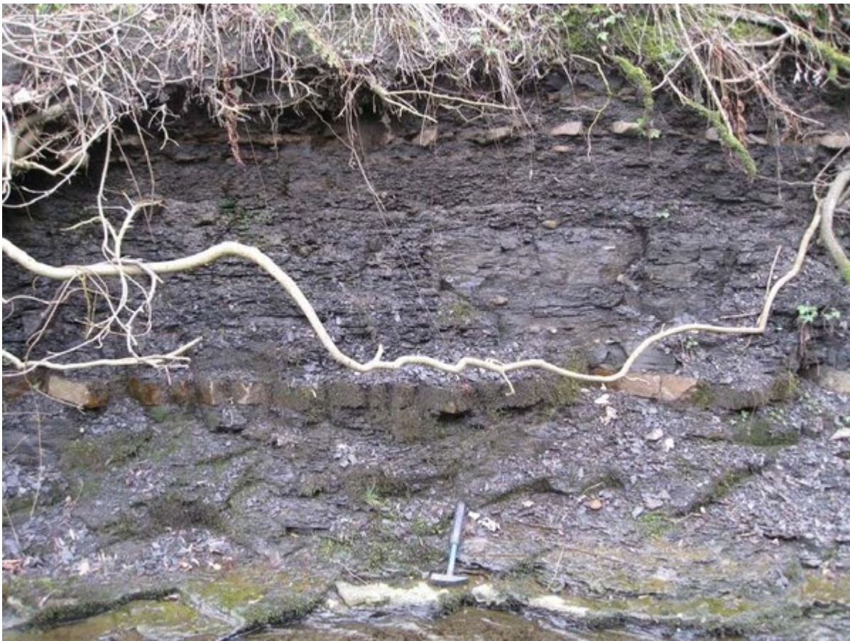
(Photo 190) Thin limestone bands (approximately 10 cm thick) and nodules in the bedded grey mudstones of the Lawmuir Formation. Looking NE.