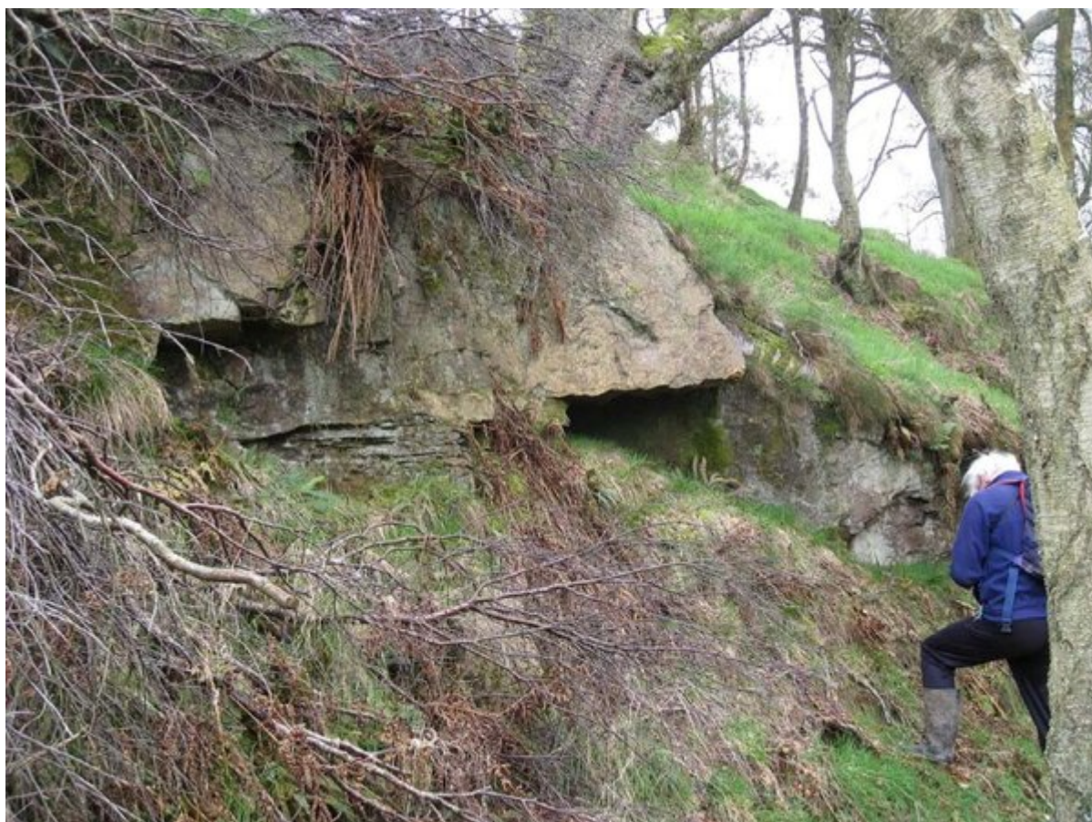
(Photo 187) Fine-grained, yellowish sandstone unit, approximately 1-1.5 m thick, in the Lawmuir Formation. Beneath this lies approximately 2 m of mudstone, seen in burn below. Looking SE.

EDC 30: Craigen Glen, Upper Carlestoun. Geoscientific merit.