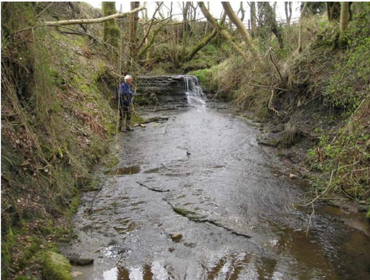
(Photo 189) View upstream of the lower waterfall in 2-4 m of bedded grey mudstones belonging to the Lawmuir Formation. Looking NW.