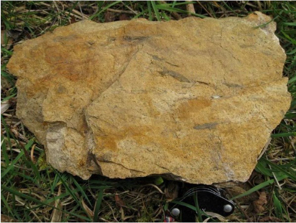
(Photo 188) Close up of the fine-grained, yellowy ochreous weathered sandstone, containing plant fragments and trace fossils.