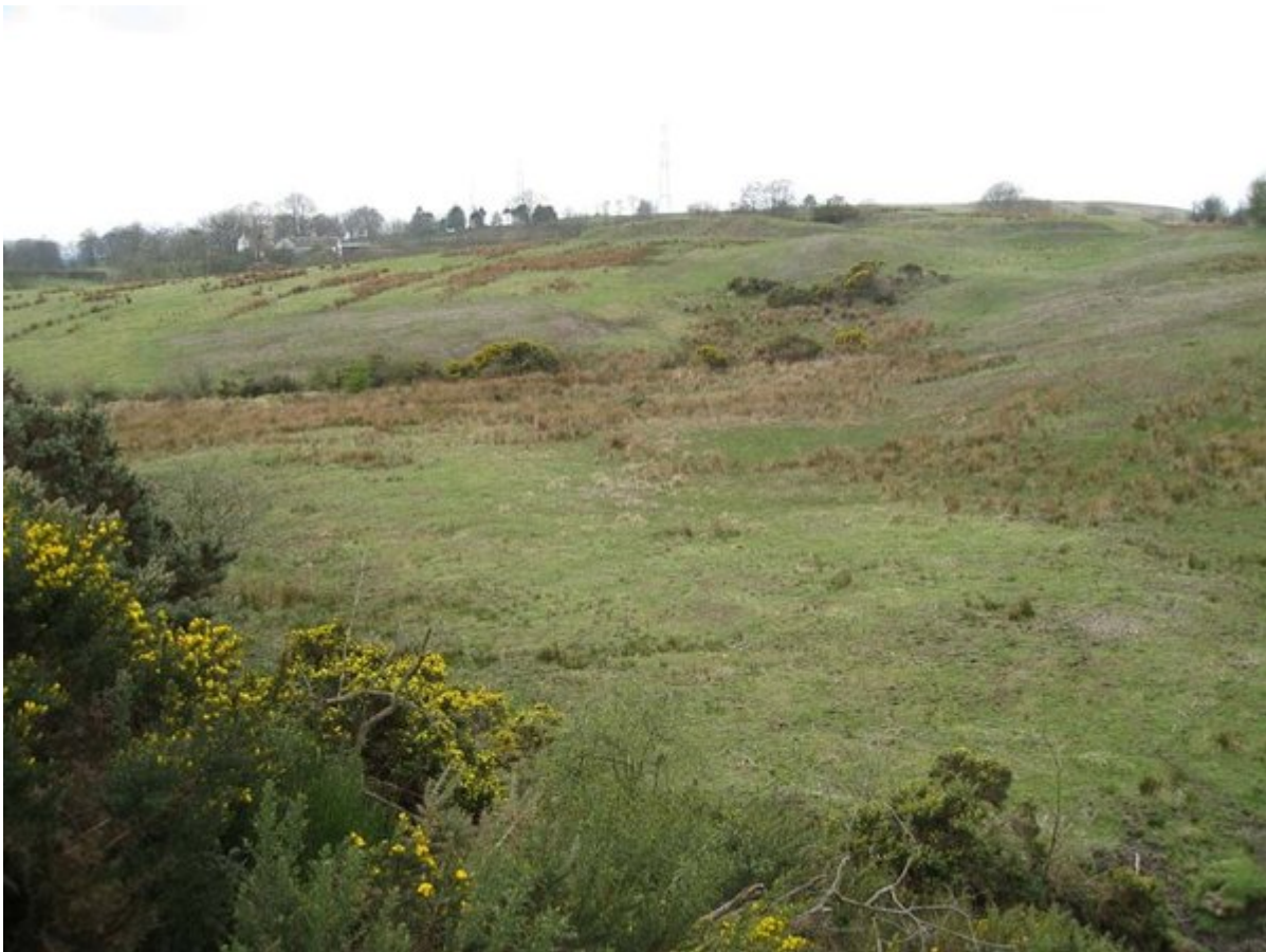
(Photo 191) View looking SW from a bing of burnt mudstone at the mouth of Craigen Glen towards the old workings.