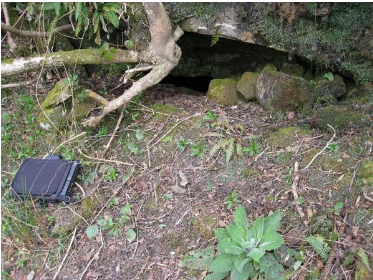
(Photo 193) Possible adit beneath a 1.5 m exposure of yellow fine-grained sandstone belonging to the Lawmuir Formation. Looking ENE.