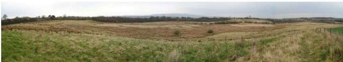
(Photo 203) Panorama across the former sand and gravel quarry at Cawder, which formerly exploited the Cadder Sand and Gravel Formation. No exposures of these sediments are known today.