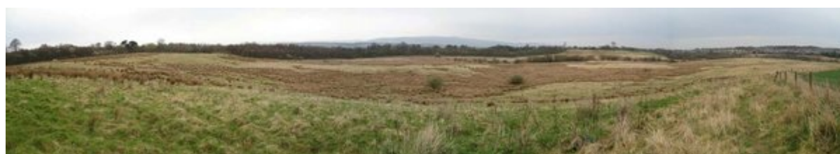
(Photo 203) Panorama across the former sand and gravel quarry at Cawder, which formerly exploited the Cadder Sand and Gravel Formation. No exposures of these sediments are known today.