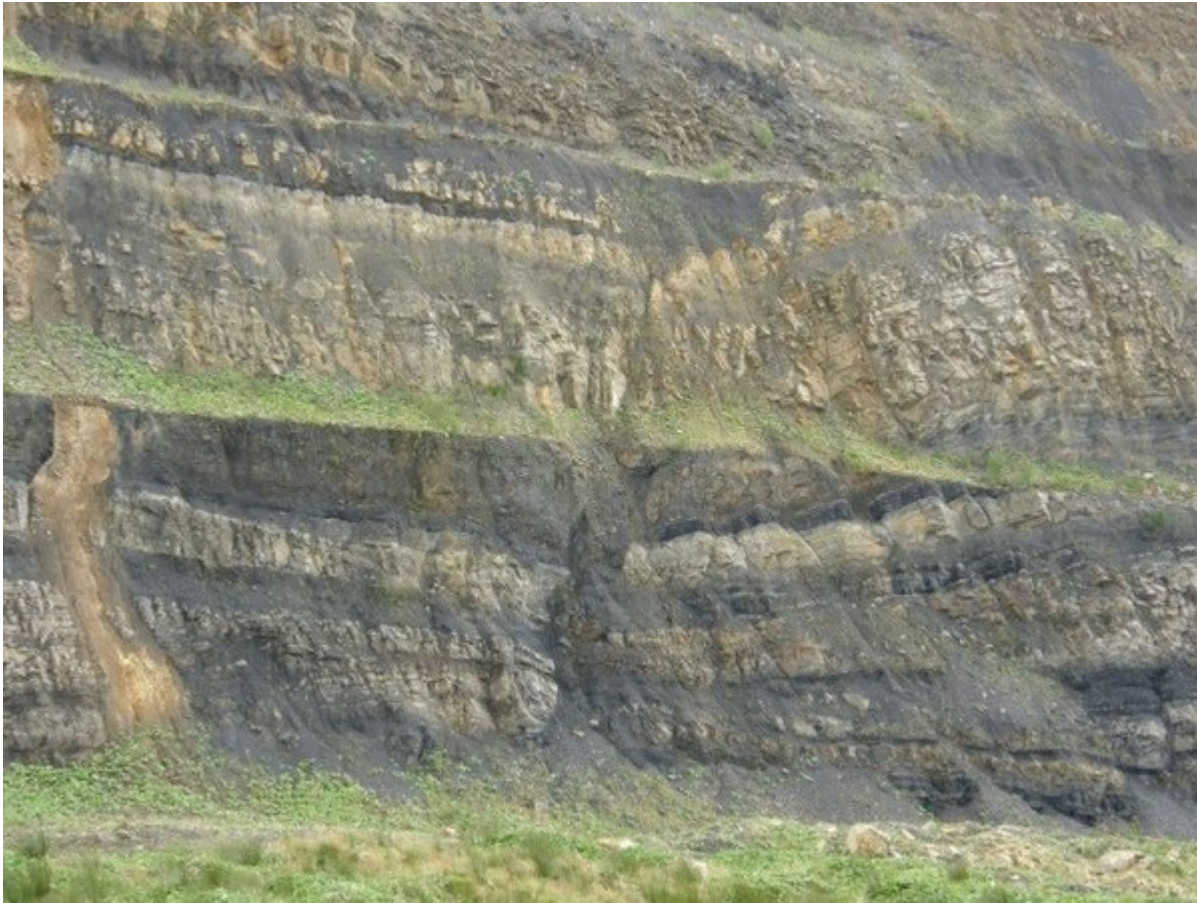
(Spireslack_6 P2) The same fault observed in the scarp, where it is seen in section cutting mudstones, coal and sandstones. This fault is best observed from the northern limestone pavement as its features are obscured up close.