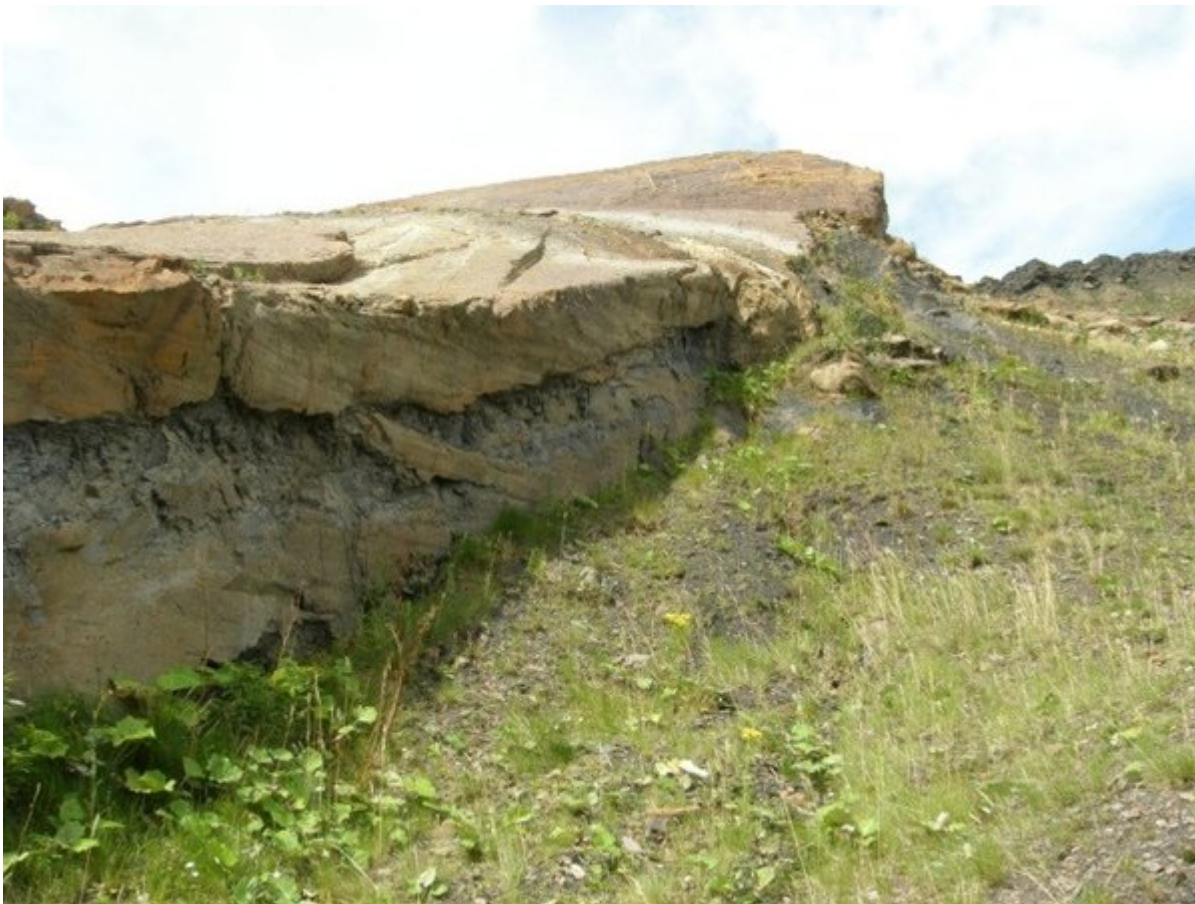
(Spireslack_6 P1) Fault plane with well-preserved slickenlines and smearing of limestone layers across fault plane. The dyke cross cutting the fault is indicated with an arrow.