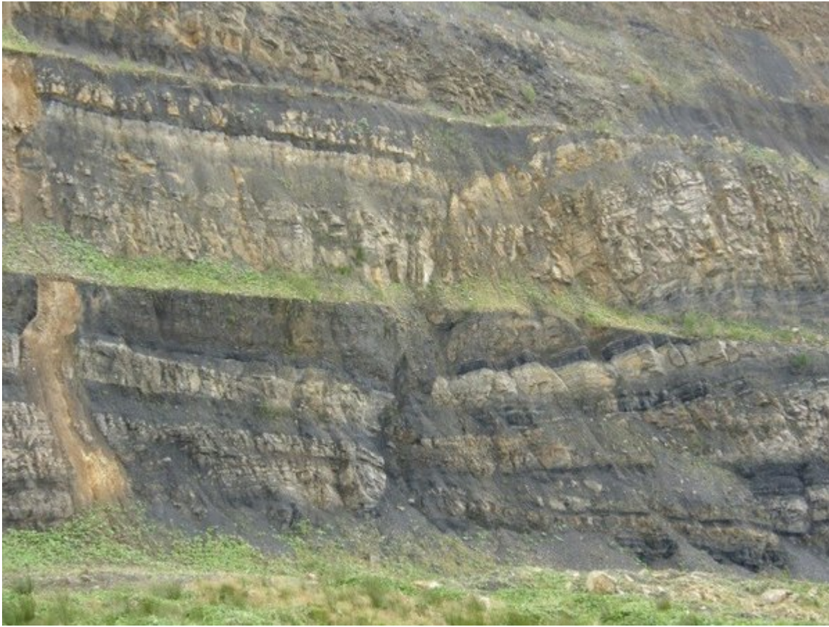
(Spireslack_6 P2) The same fault observed in the scarp, where it is seen in section cutting mudstones, coal and sandstones. This fault is best observed from the northern limestone pavement as its features are obscured up close.