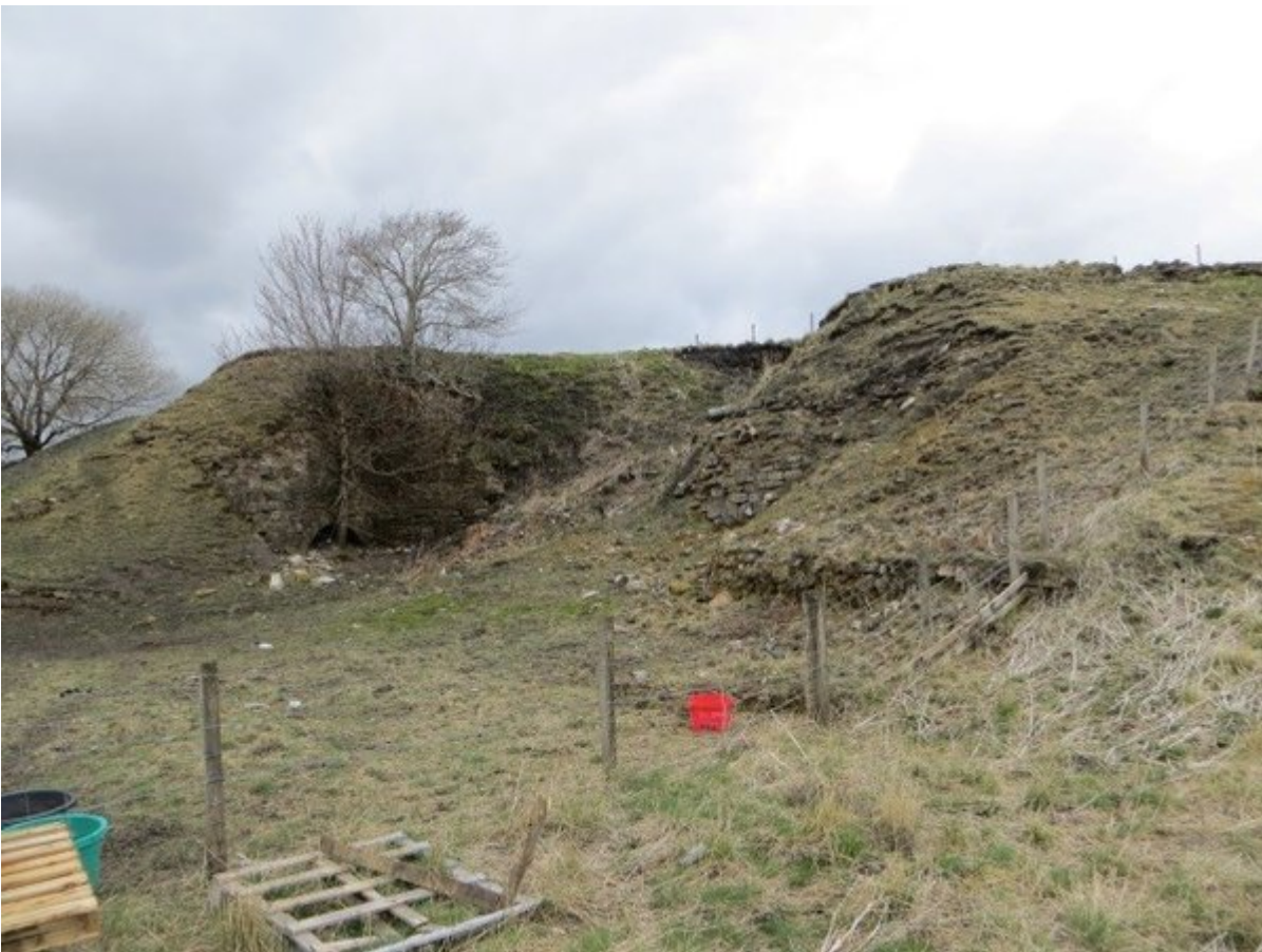
(Figure 9) The ruins of the Glenbuck Ironworks Furnace are visible at the base of the tree in the centre left of the photo. The furnace has been buried by later generations of mine waste.