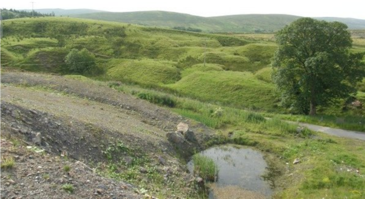
(Figure 8) Bell-pits at southern edge of Spireslack SCM. View looking toward the south-west. These disused bell-pits were historically associated with ironstone and limestone mining.