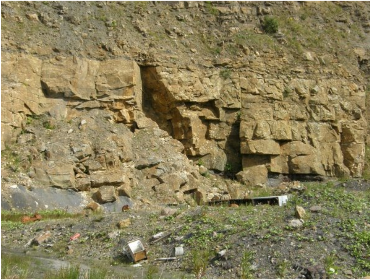
(Spireslack_18 P1) Stacked sandstone bodies within Area B1 at Spireslack. These thick tabular massive bodies of sandstone represent stacked bars formed as part of a channel complex. Closer inspection reveals cross- bedding within these stacked bars which can be used for palaeocurrent analysis. To improve access, spoil heap in front section should be levelled and the section cleared of loose material.