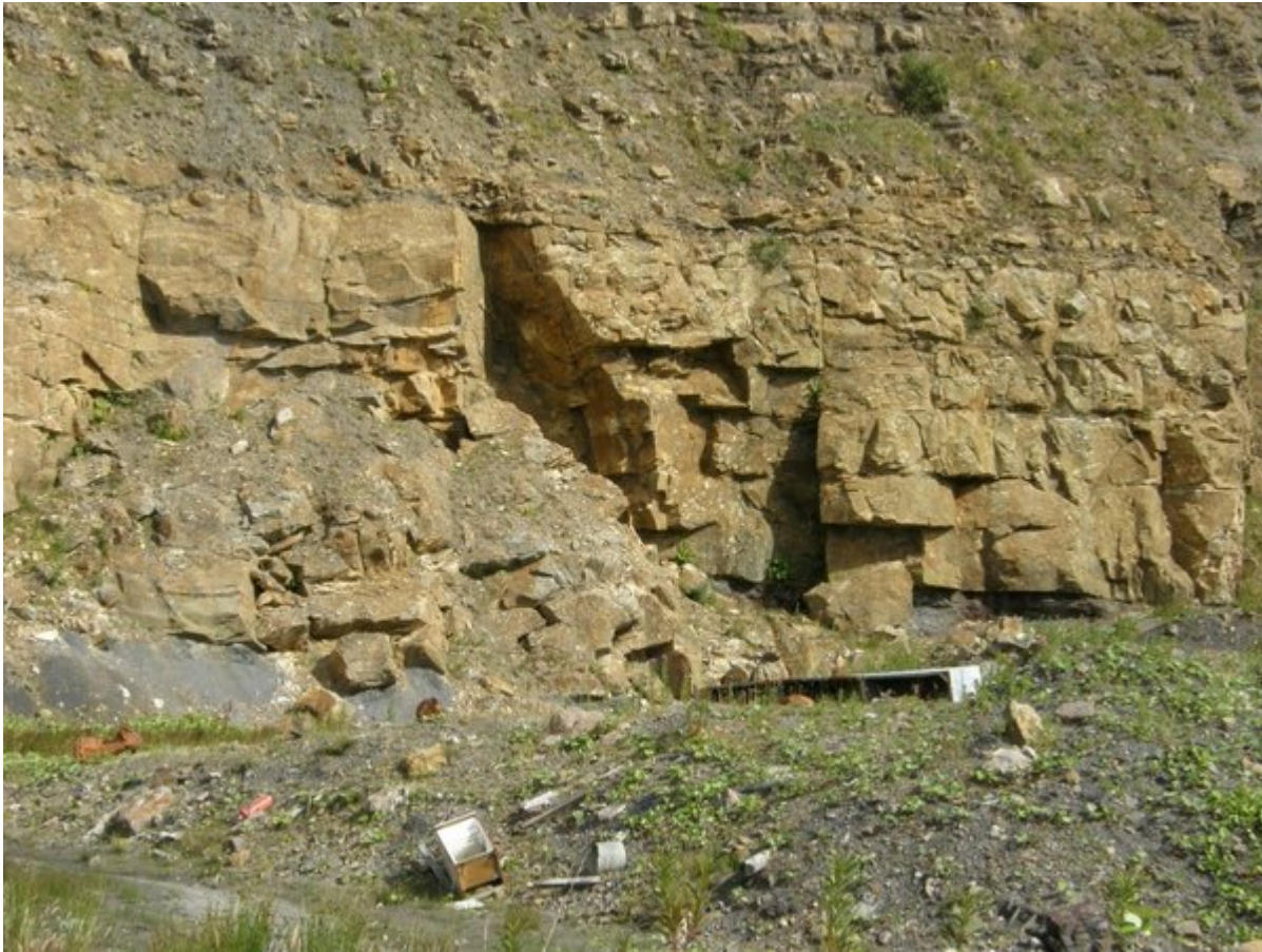
(Spireslack_18 P1) Stacked sandstone bodies within Area B1 at Spireslack. These thick tabular massive bodies of sandstone represent stacked bars formed as part of a channel complex. Closer inspection reveals cross- bedding within these stacked bars which can be used for palaeocurrent analysis. To improve access, spoil heap in front section should be levelled and the section cleared of loose material.