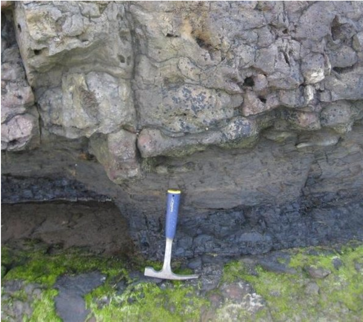
(ELC_14_P2) At the western edge of the site, a 20 cm thick coal seam is found beneath the Hurlet Limestone. In the photo the hammer is resting against a coal, with a brown shale layer above. The Hurlet Limestone caps this local sequence.