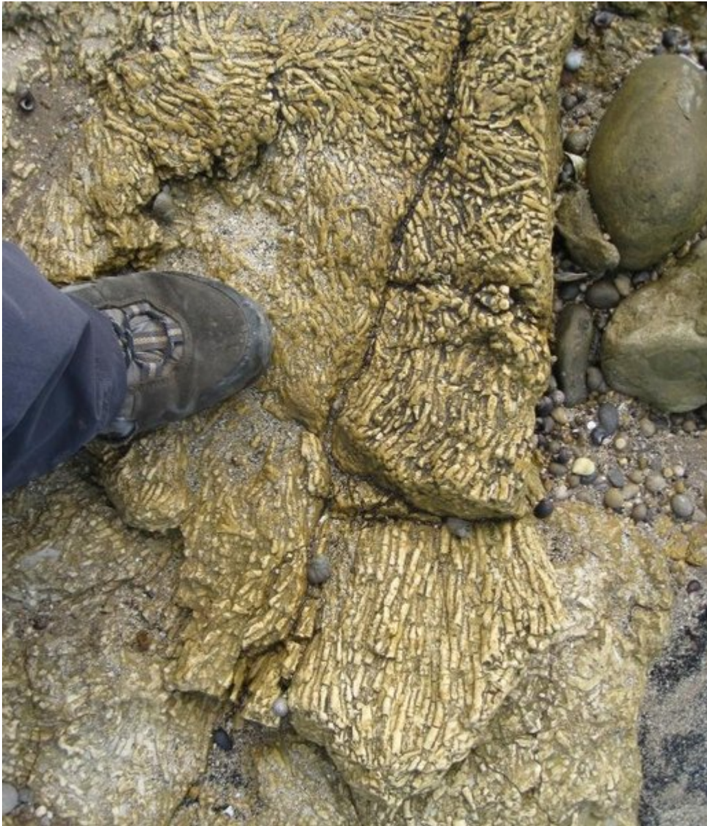
(ELC_14_P4) This remarkable texture within the Hurler Limestone is a dense concentration of the colonial coral fossil, Siphonodendron junceum. The fossils are so distinct that rocks bearing these fossils are locally given the name 'spaghetti-rock'. The bed is exposed just below high water mark, and large boulders or cobbles of the same rock type can be examined/collected at high tide.