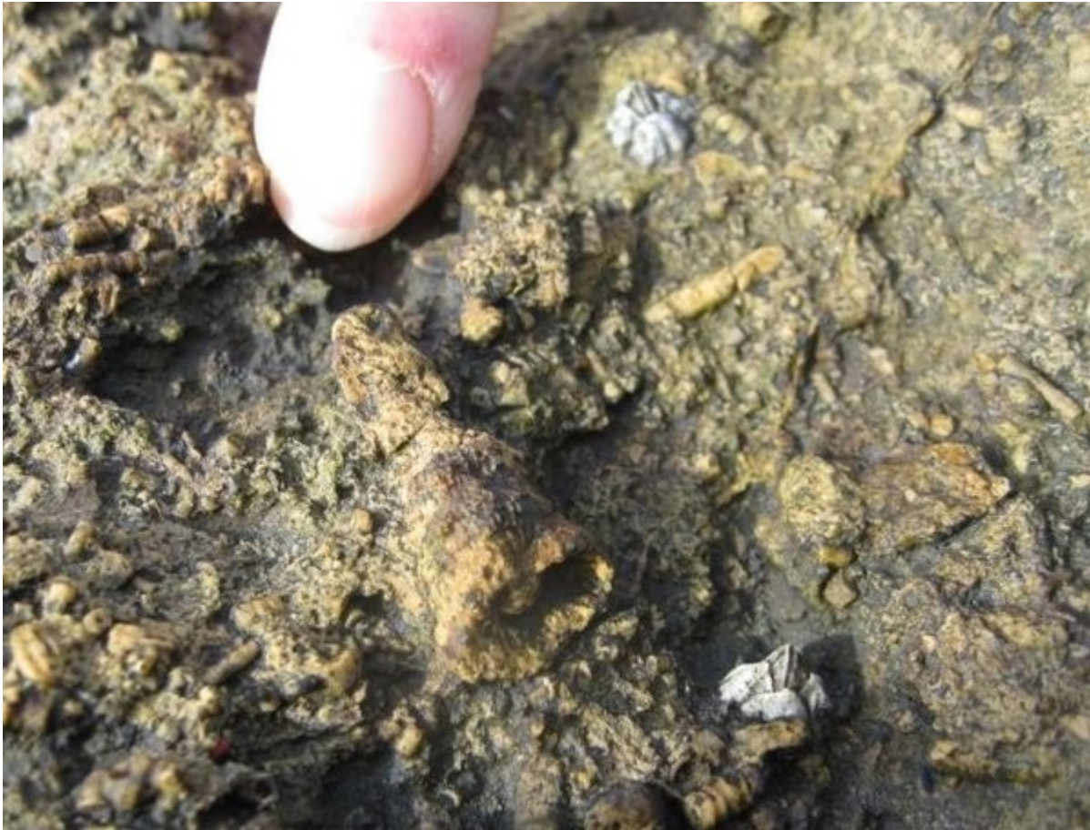
(ELC_14_P3) Amongst the many fossils identifiable within the Hurlet Limestone are those of Koninckophyllum, a solitary coral. Crinoid fragments are visible surrounding the coral. Modern day barnacles (white) are commonly found on the limestone.