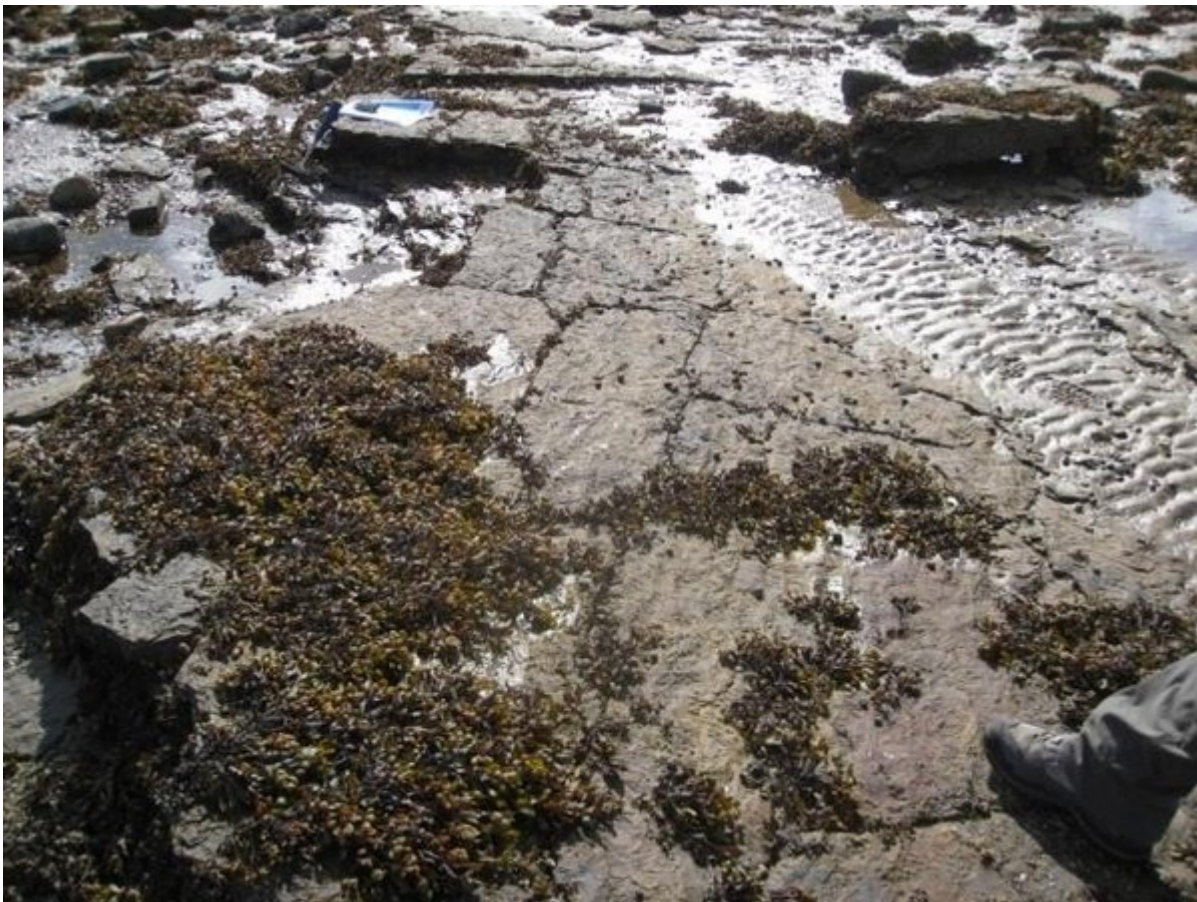
(ELC_14_P7) Sandstone beds of the Lower Limestone Formation display weakly rippled surfaces, evidence of flowing water over the top of the sediment as it was deposited, possibly in a river bed or in a tidal environment. Modern day sand