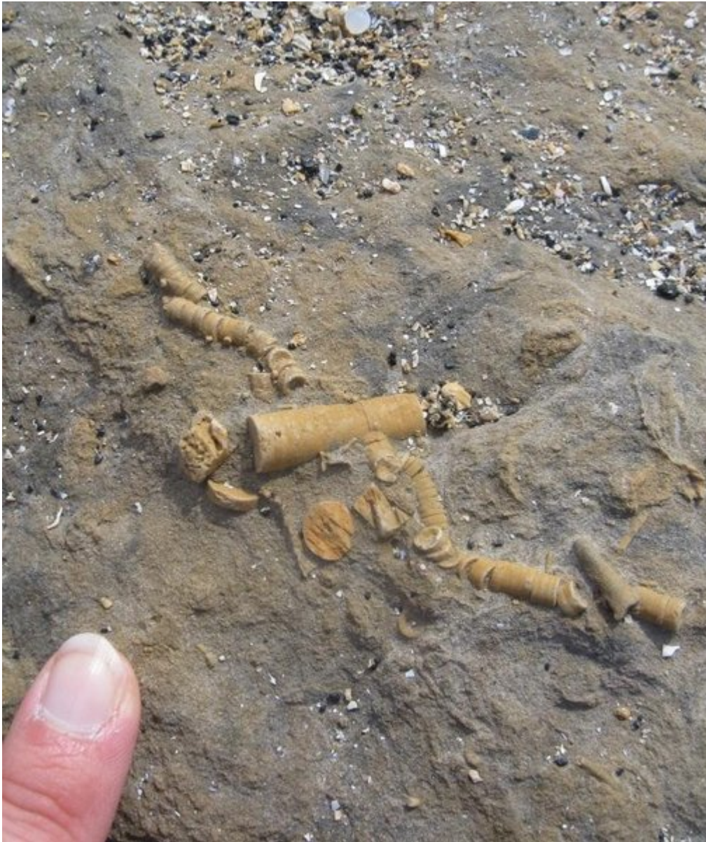
(ELC_14_P5) The Blackhall Limestone contains beautifully preserved crinoid stems, such as the ones imaged above. These crinoids lived in shallow waters, and would have been attached to the sea bottom by a stalk, the segmented remains of which are usually preserved in the fossil record.