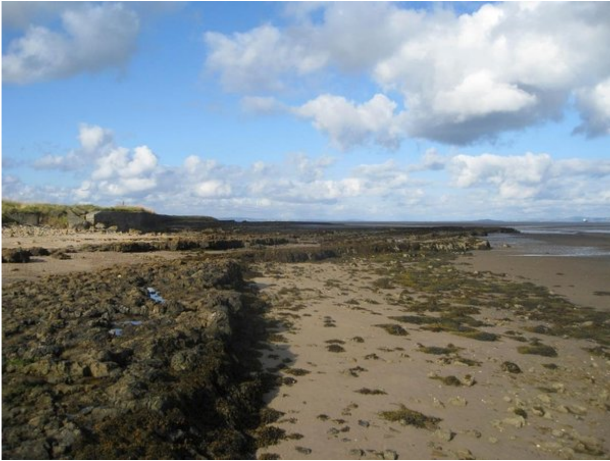
(ELC_14_P1) The Hurler Limestone forms a striking rock platform along the shore at the eastern edge of the site. Thin beds of shale between limestones bed have been eroded out, leaving a stepped appearance to the limestone. Photo looking north-west.