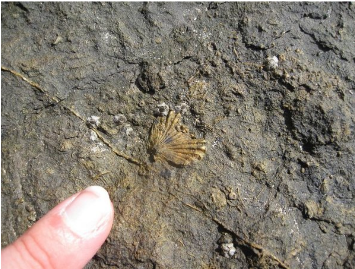
(ELC_14_P6) The Blackhall Limestone also contains beautifully preserved brachiopods, where the intricate details on their shells can still be seen today.