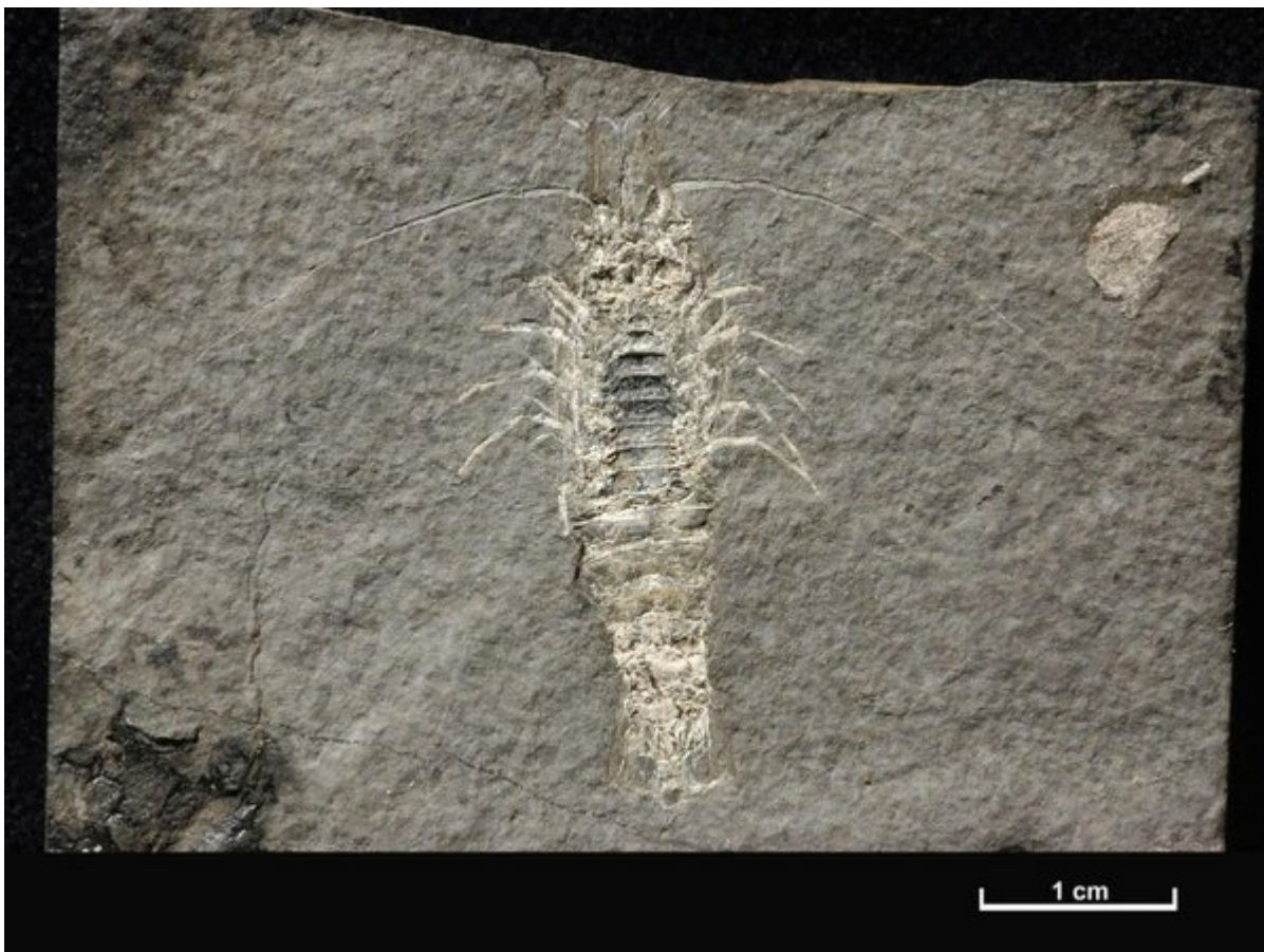
(ELC_21_P1) Tealliocaris woodwardi is a crustacean that lived during the Carboniferous. This specimen was collected at Cheese Bay, and lived during a period of fluvio-deltaic conditions with short-lived marine incursions. This fossilised shrimp has three sections: a head with eye on stalks and antennae, a thorax, and an abdomen.