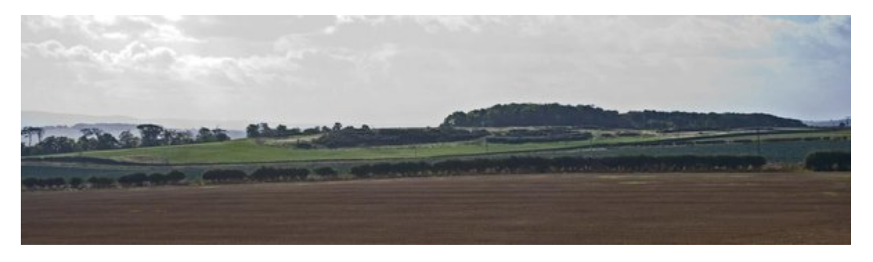
(ELC_27_P2) Streamlined ridge east of Merrylaws. View to the south.