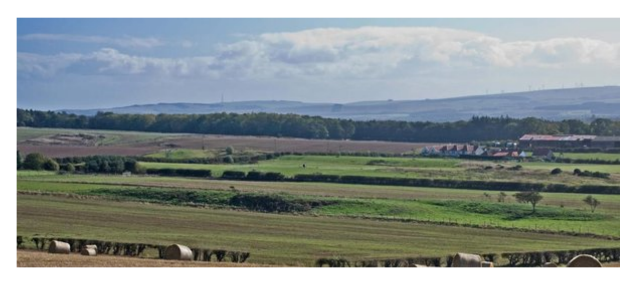
(ELC_27_P3) Ice-moulded bedrock near Stonelaws (right), view to the south