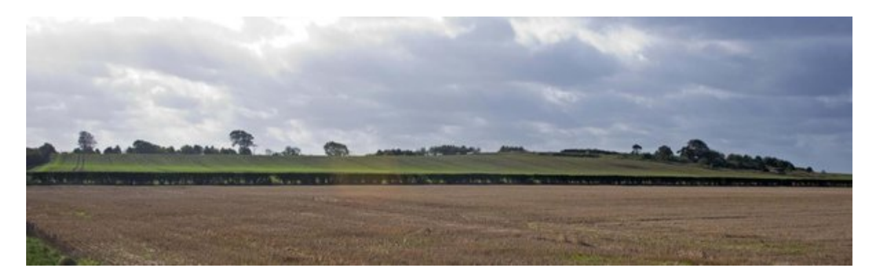
(ELC_27_P1) Streamlined ridge at Pleasants west of Whitekirk. View to the south.