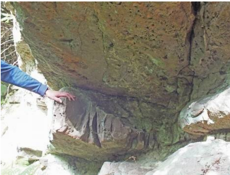
(Figure 14) SP 10. Sandstone exposure. [NT 3745 5963] Trough cross-bedding..