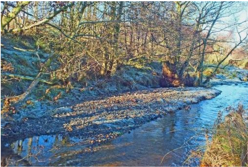
(Figure 21) SP 17. Point bar and alluvial terrace. [NT 3523 6007]. 30th November 2016