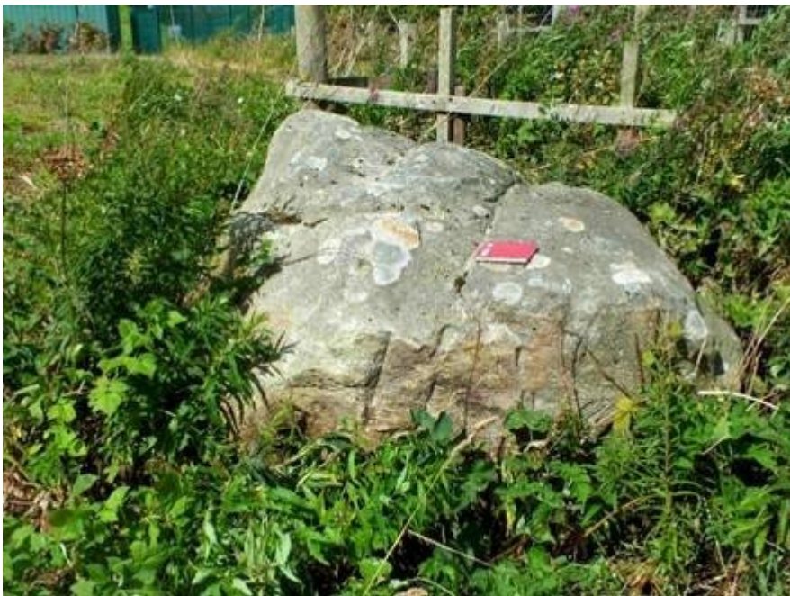
(Figure 30) SP 27. Coarse-grained well cemented sandstone. [NT 3518 6298].