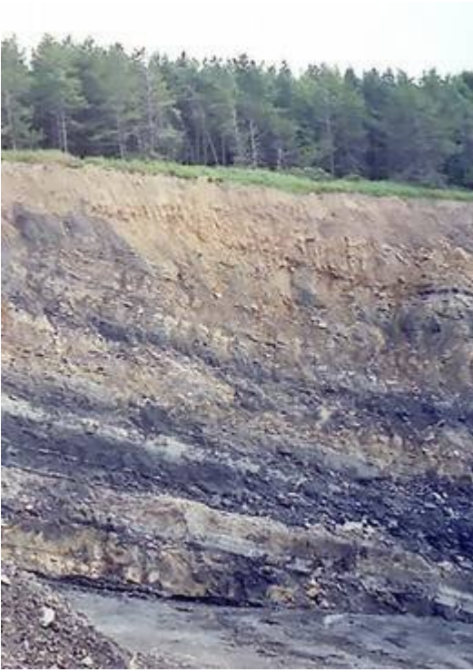
(Figure 29) SP 26. [NT 3536 6212]. Open-pit Coal Mine. Typical rock face.