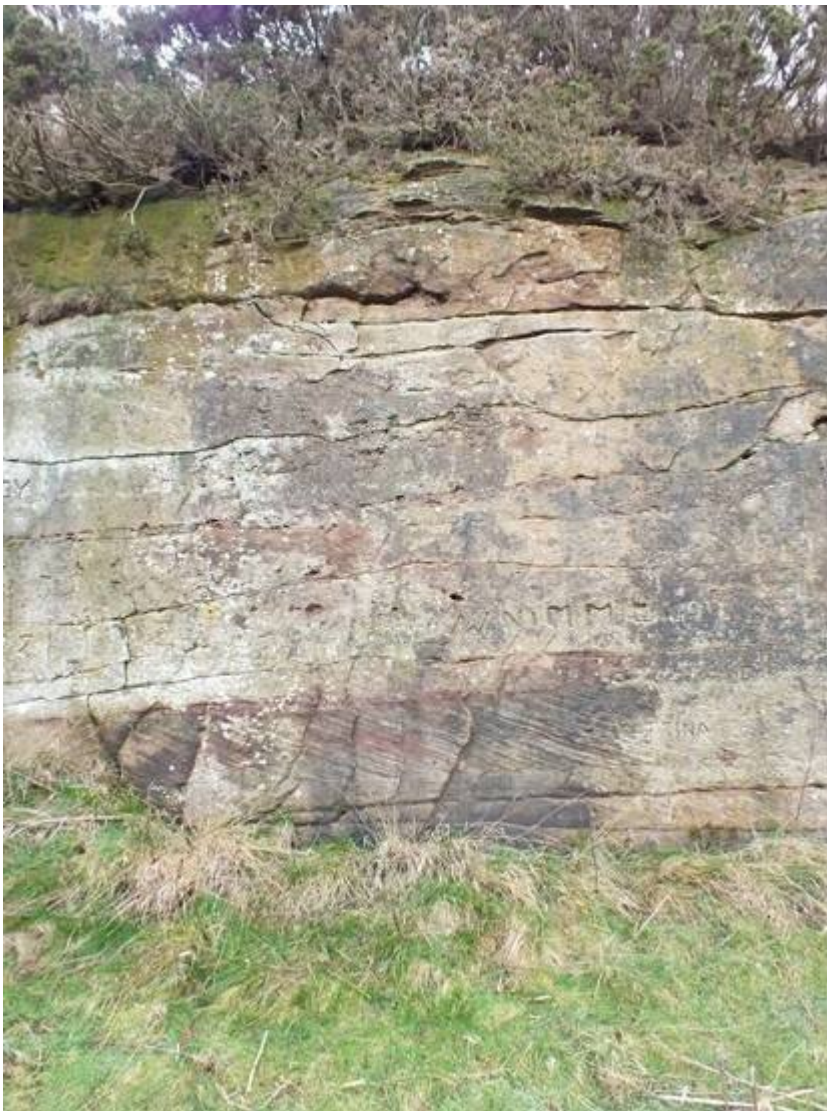
(Figure 9) SP 5. Crichton Castle. NT 3807 6103]. Quarry of yellow sandstone, Aberlady Formation