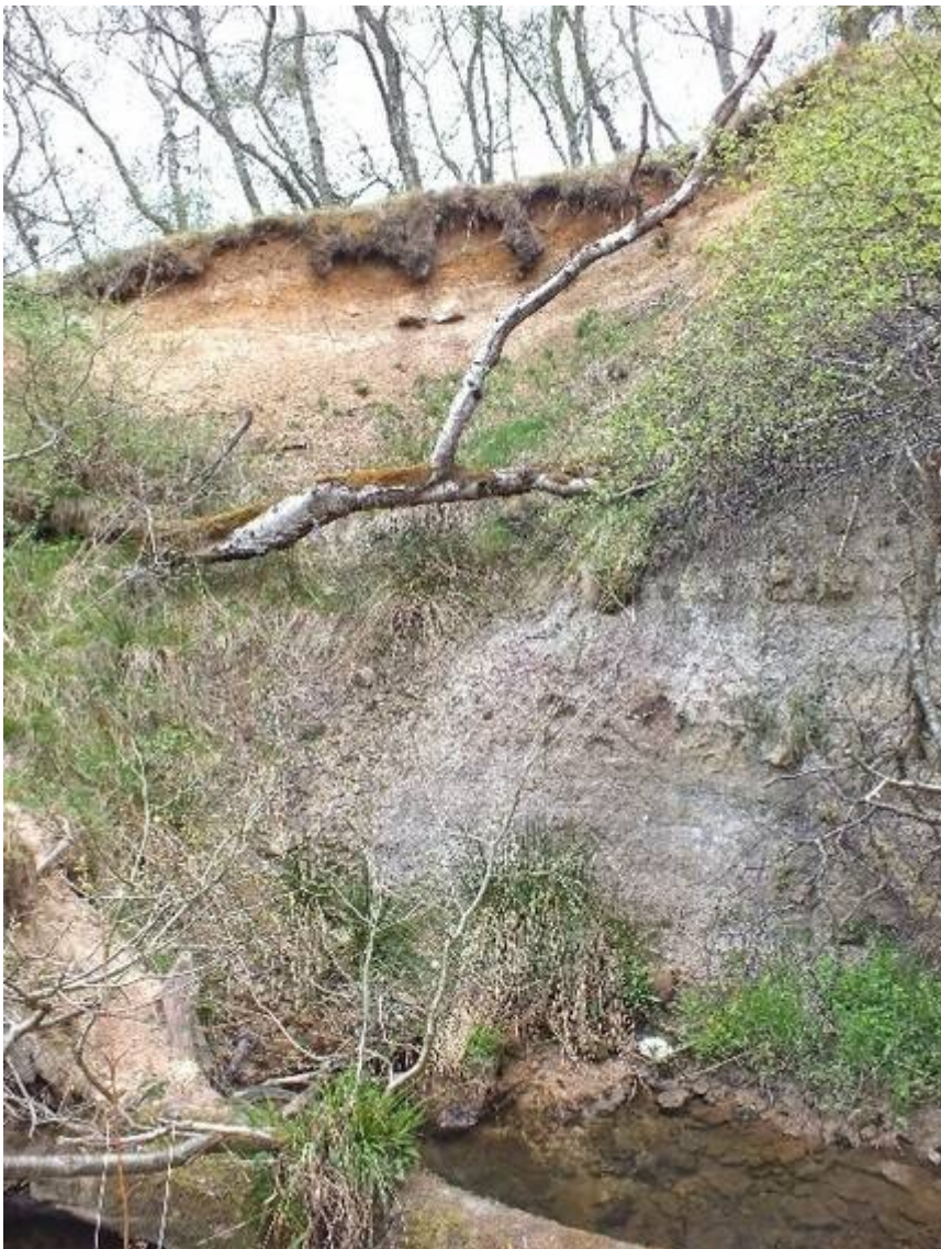
(Figure 11) SP 6. Tyne Water exposure. [NT 3804 6052]