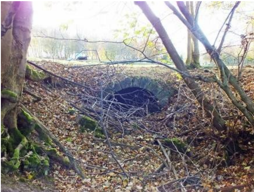
(Figure 34) SP 30. Arch over a shallow trench. A former waggonway for hauling lime down to Mayfield and beyond. [NT 3519 6335].