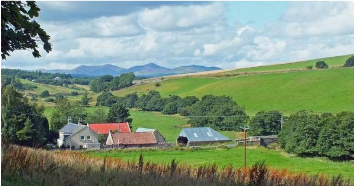
(Figure 17) View down the Gore Valley from the entrance to Borthwick Castle.