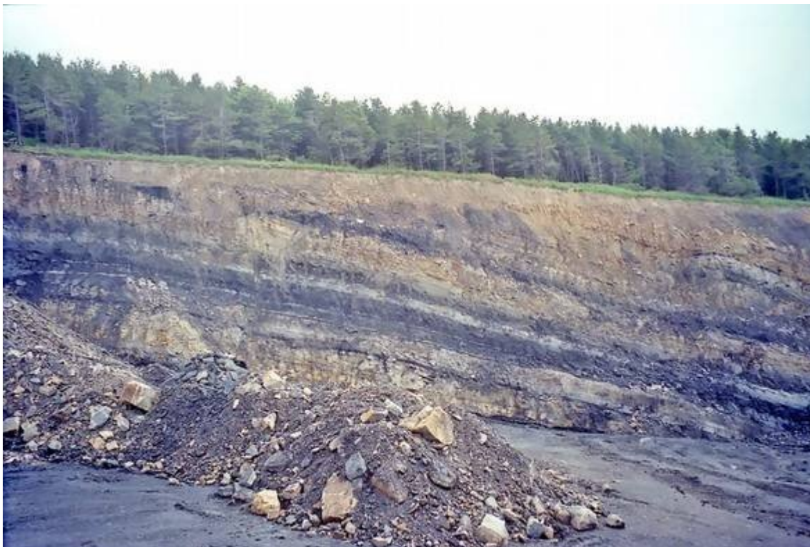
(Figure 28) SP 26. [NT 3536 6212]. Opencast Coal Mine. Typical rock face.