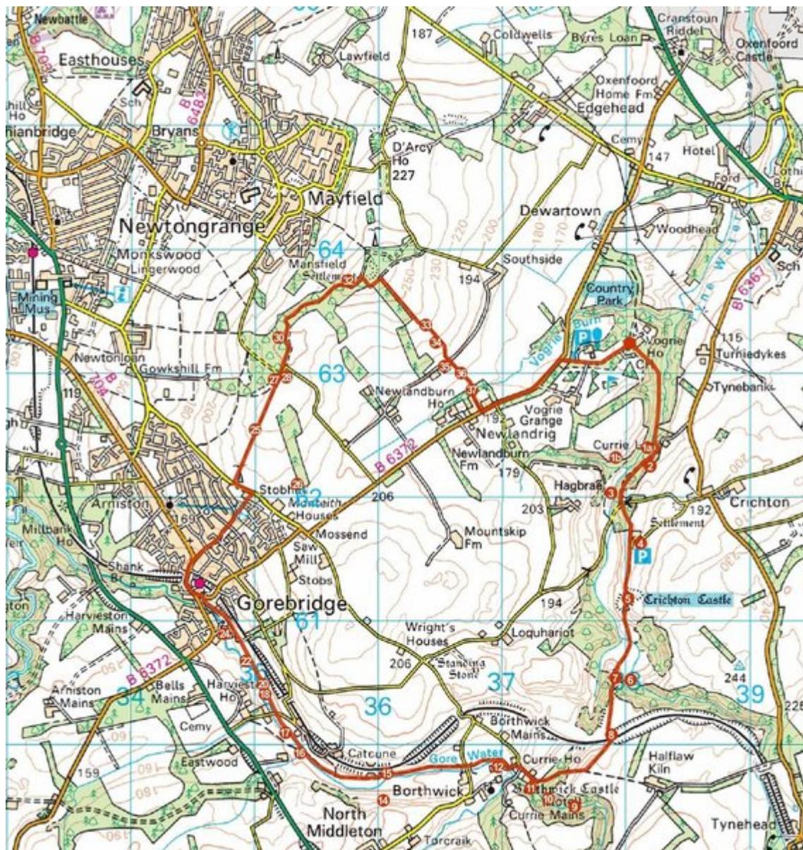
(Figure 1) Location map.

(Figure 36) SP 36 (Walk 1 SP 4). Boulders beside path. Left after the retreat of the ice after the last glaciation. [NT 366 630].