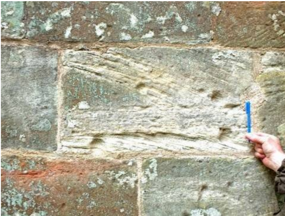
(Figure 6) SP 4. Crichton Kirk. [NT 3811 6161]. Geologically, this block is laid upside-down: the first layers deposited are at the top of the block, and were laid down at an angle. Then the tops of these layers were eroded before the second set of layers were laid down horizontally