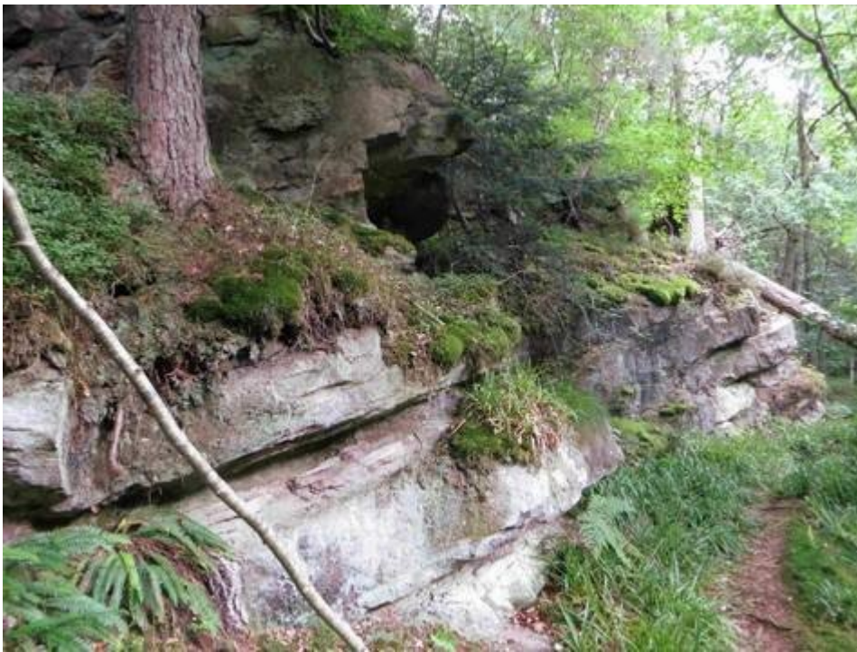
(Figure 13) SP 9. 10 m thick sandstone exposure on Gore Water. [NT 376 595].