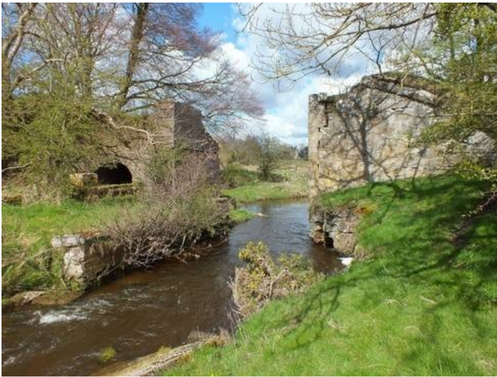
(Figure 19) SP 16. Broken Bridge. [NT 3539 5990].