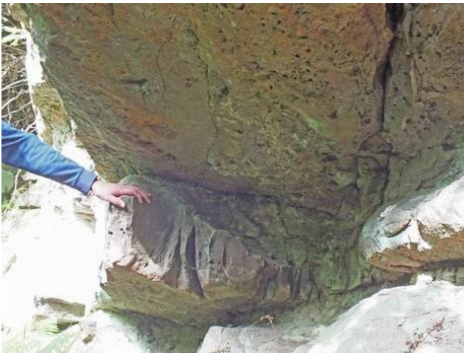
(Figure 14) SP 10. Sandstone exposure. [NT 3745 5963] Trough cross-bedding..