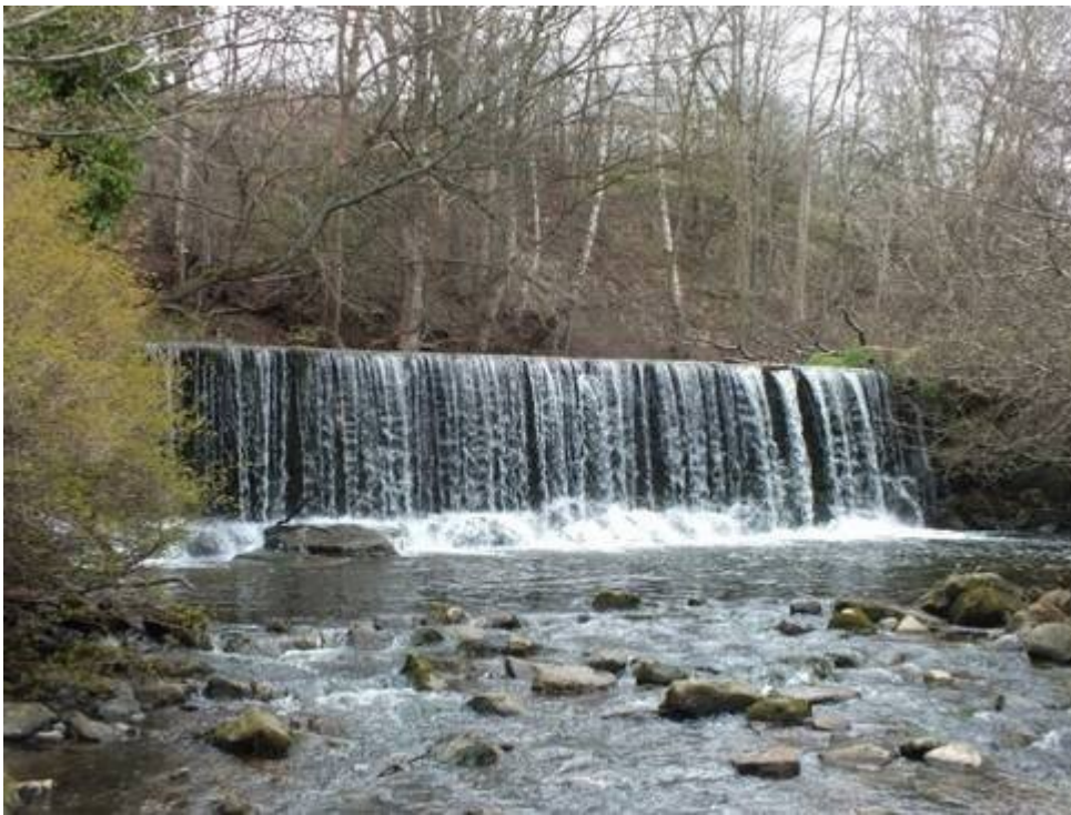
(Figure 23) SP 20. Weir, downstream from Catcune Mills. [NT 3502 6050]