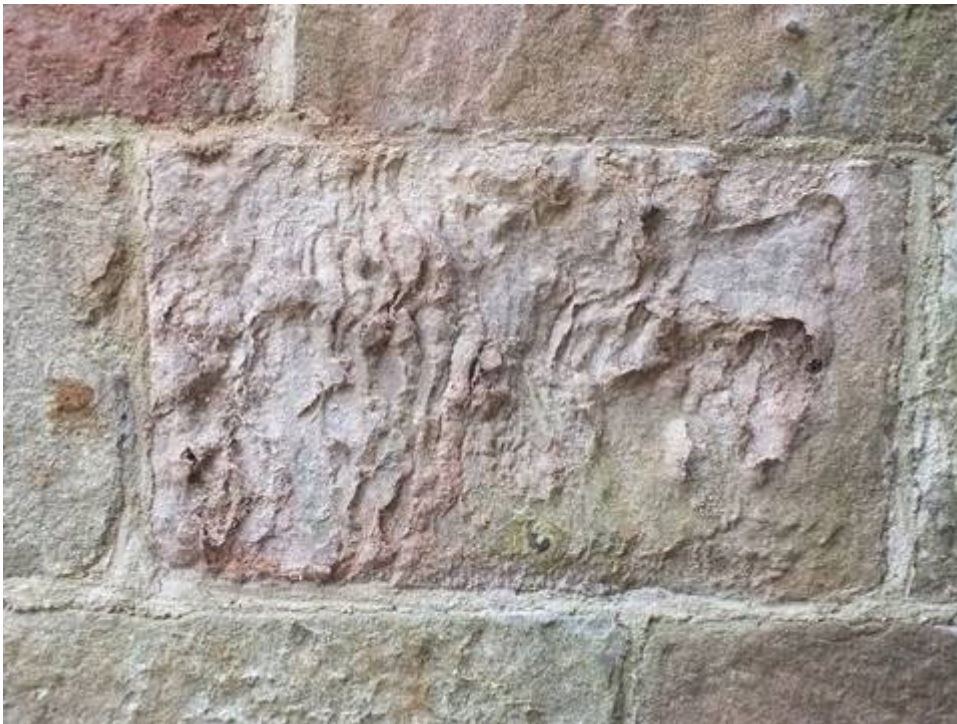
(Figure 8) SP 4. Crichton Kirk. [NT 3811 6161]. Cross bedding. Weathering has accentuated the features.