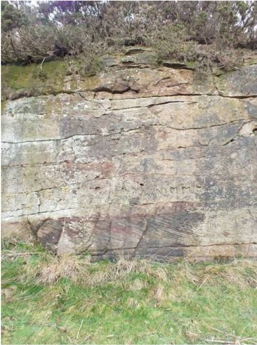
(Figure 9) SP 5. Crichton Castle. NT 3807 6103]. Quarry of yellow sandstone, Aberlady Formation