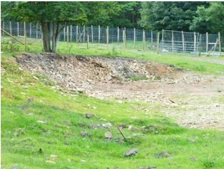
(Figure 33) SP 30. Spoil heap from old limestone quarry. [NT 3519 6335].