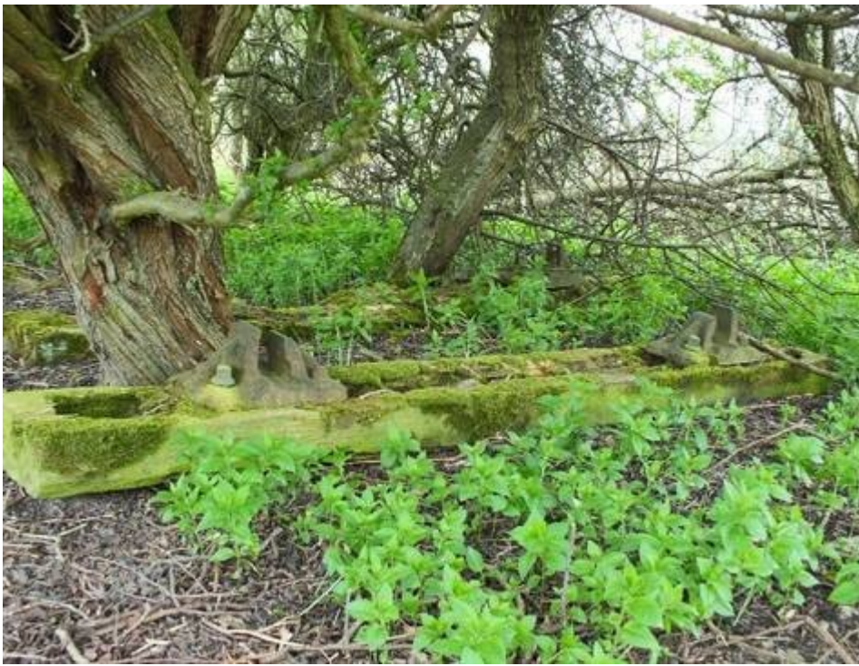
(Figure 12) SP 8. Former Railway. [NT 3788 6036]. Old sleeper left behind after dismantling of the railway sidings.