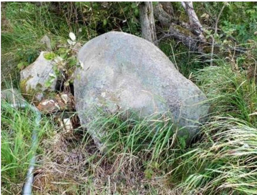
(Figure 31) SP 28. Igneous Boulder carried along by glacier ice until it melted and was dumped here 15,000 years ago. [NT 3522 6295].