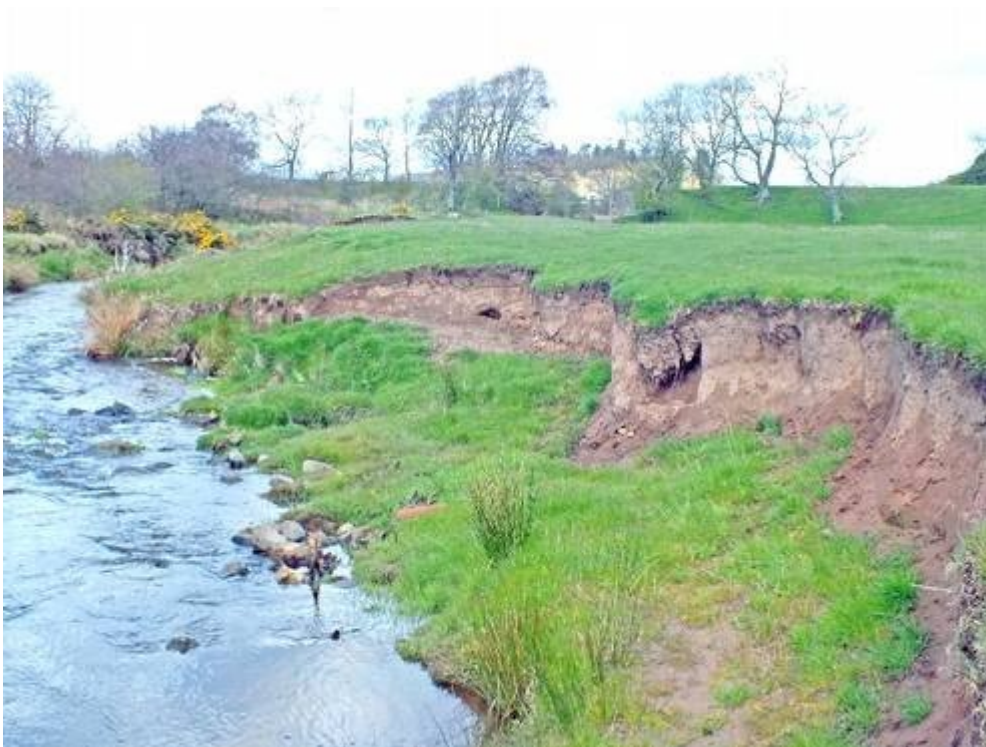
(Figure 18) SP 15. Slumping on River Bank. [NT 3627 5974].