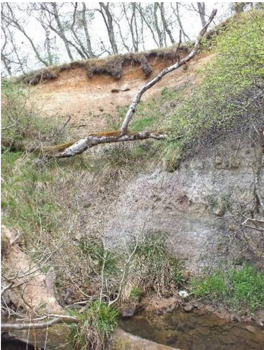
(Figure 11) SP 6. Tyne Water exposure. [NT 3804 6052]