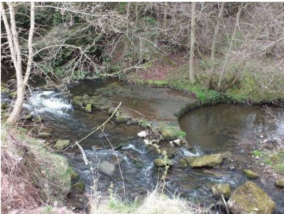
(Figure 24) SP 21. Ford? [NT 3501 6048].