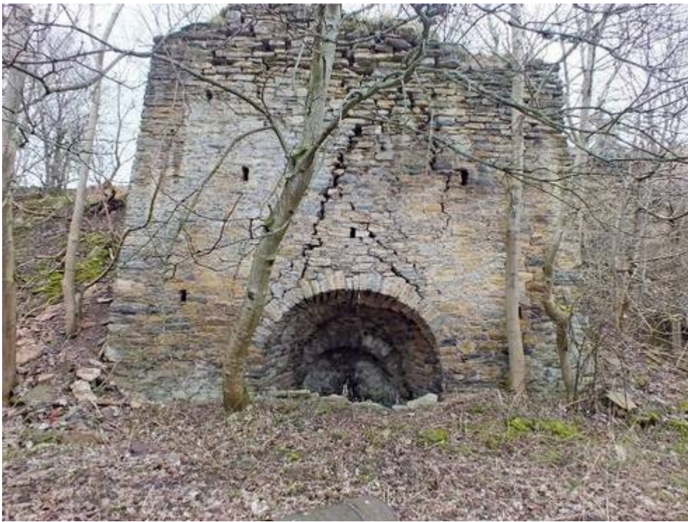
(Figure 3) SP 1b. Lime Kiln.