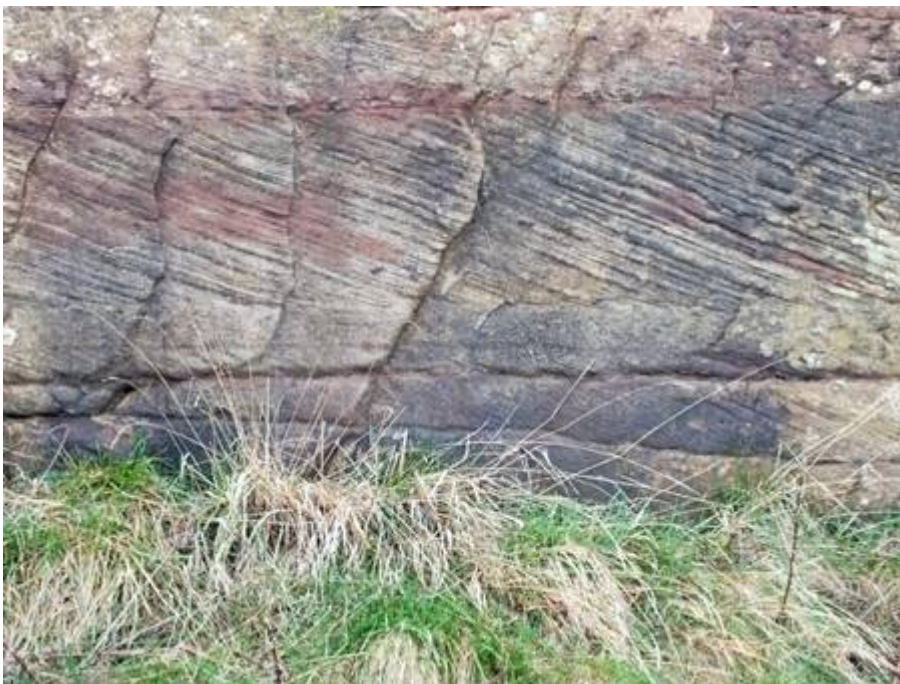
(Figure 10) SP 5. Crichton Castle. [NT 3807 6112]. Quarry of red sandstone, Aberlady Formation