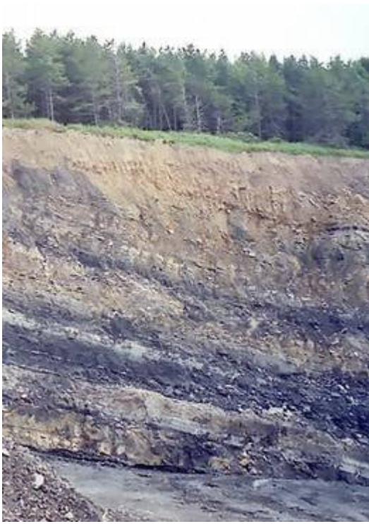
(Figure 29) SP 26. [NT 3536 6212]. Opencast Coal Mine. Typical rock face.