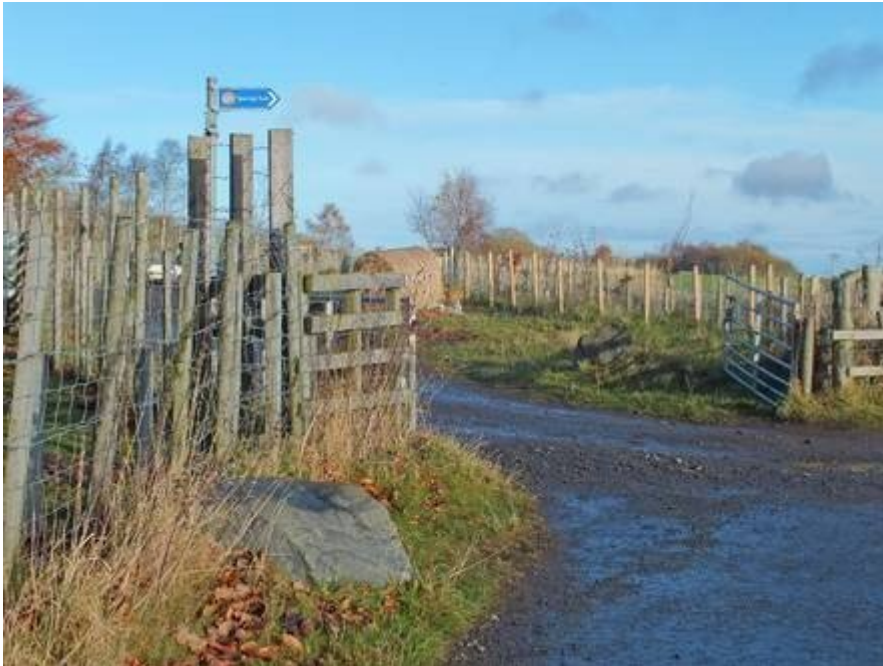
(Figure 32) SP 29. Limestone Boulders [NT 3521 6303]. Two boulders can be seen either side of the gate at the entrance to the track towards Newlandrig.