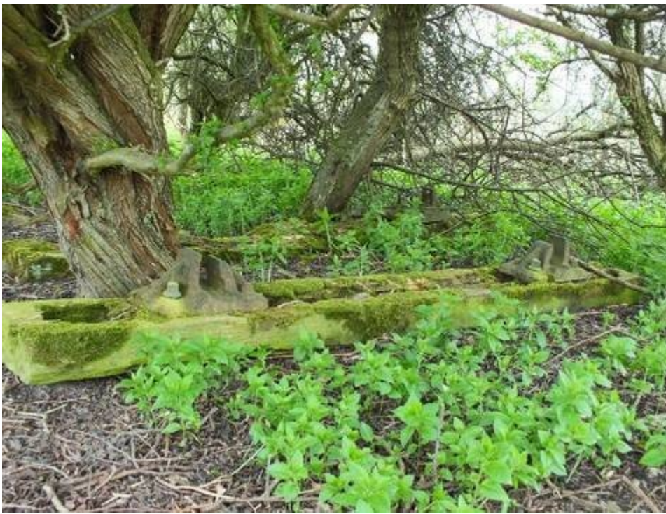
(Figure 12) SP 8. Former Railway. [NT 3788 6036]. Old sleeper left behind after dismantling of the railway sidings.