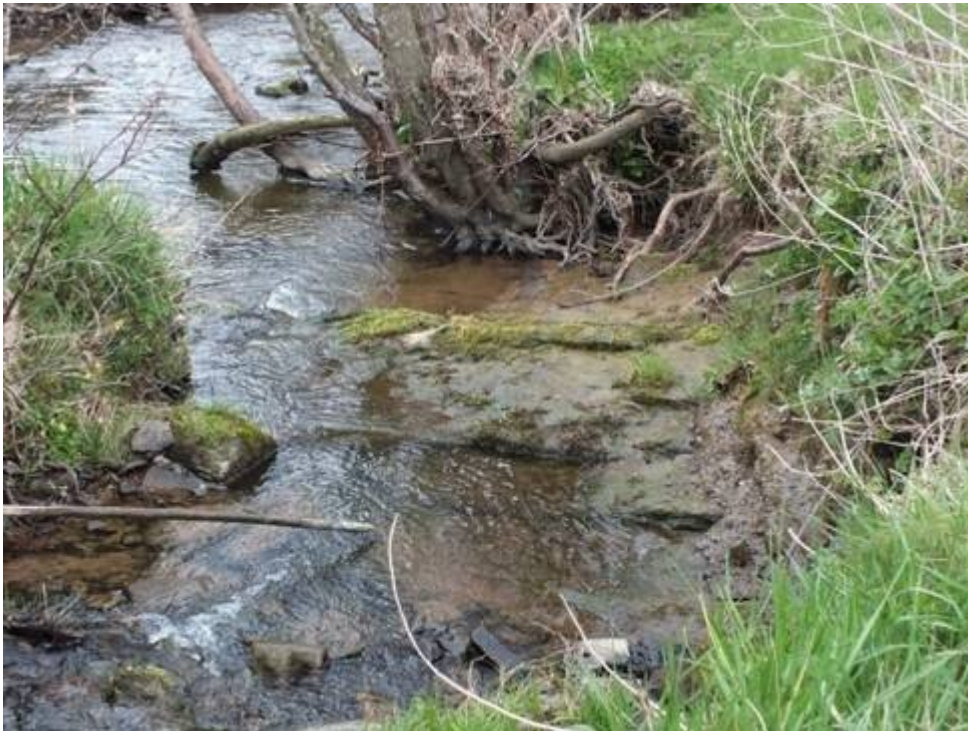
(Figure 22) SP 19. Sandstone. [NT 3505 6044].