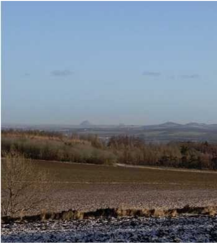
(Figure 3) North Berwick Law in the distance.