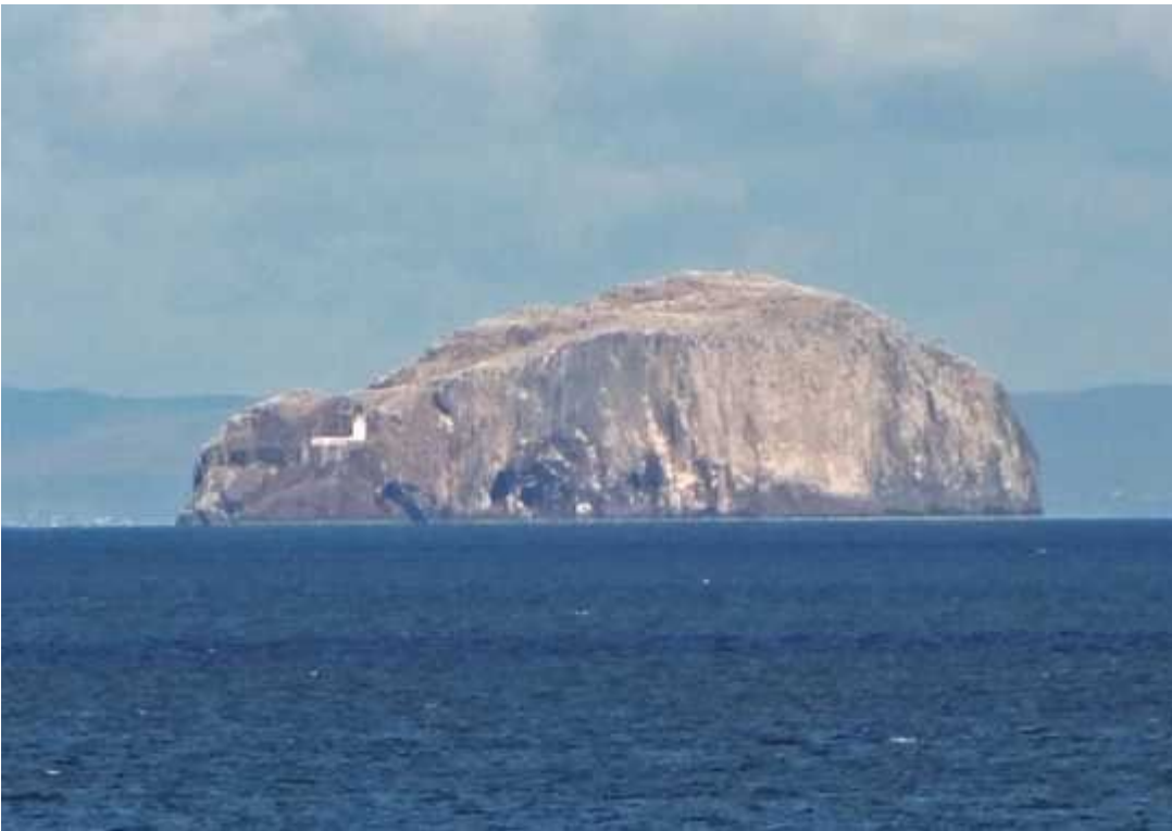
(Figure 4) The Bass Rock.