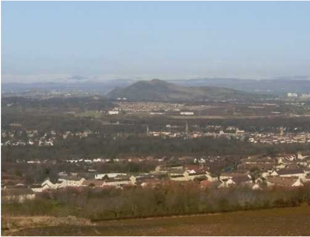
(Figure 5) Arthur's Seat.