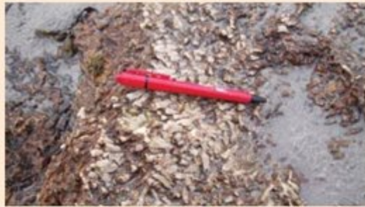
Body fossil: Colonial coral Siphonodendron

Barns Ness is a great place to find fossils, the remains of the life that thrived in tropical seas 320 million years ago.