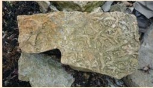
Trace fossil: Thalassinoides (burrow)