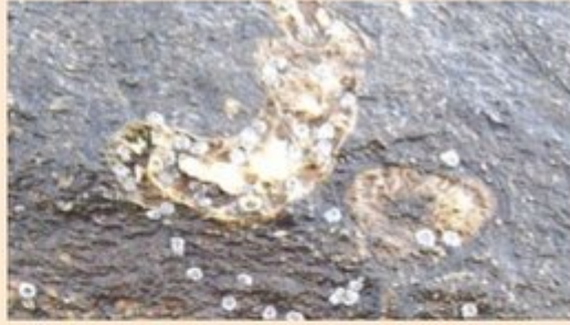
Body fossil: Solitary coral