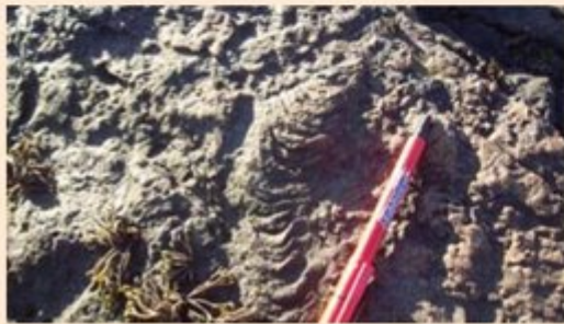
Trace fossil: Rhizocorallium (burrow) – left of pen