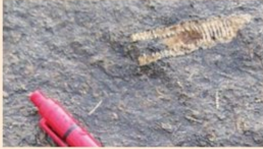
Body fossil: Crinoid Parazeacrinites sea lily