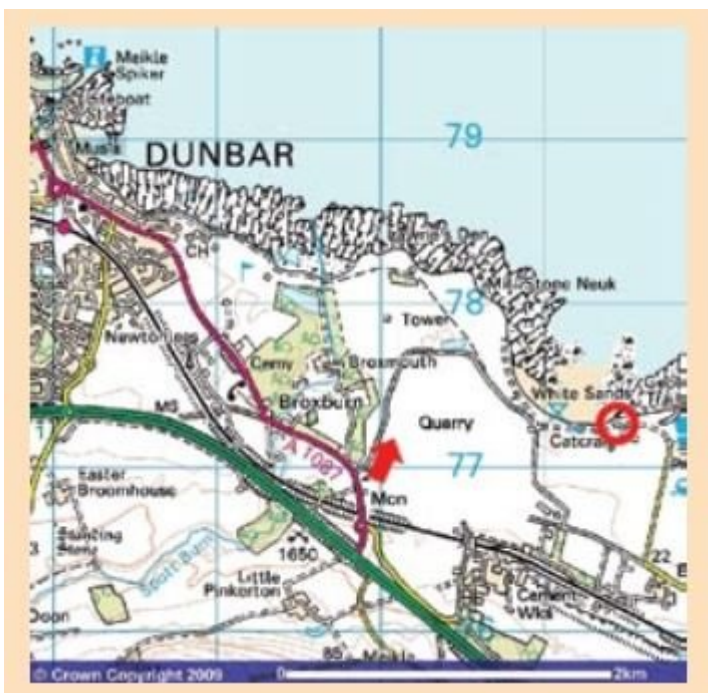
(Figure 1) Location map.

Proceed around the small headland of lumpy limestone and look out for rare fossils called Chaetetes. This is a demosponge and was a common reef-building organism of the Carboniferous. Look closely and you can see tiny holes similar to a bath sponge.