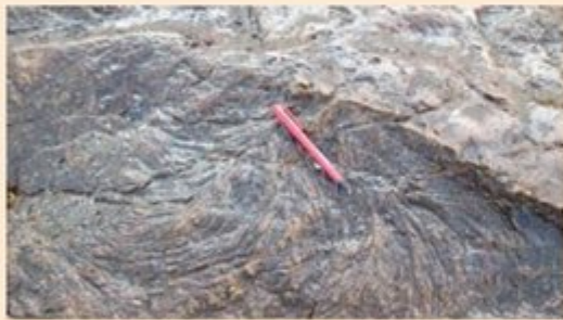
Trace fossil: Zoophycos (burrow)