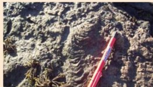
Trace fossil: Rhizocorallium (burrow) – left of pen