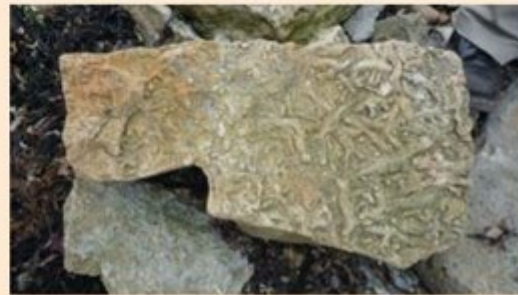
Trace fossil: Thalassinoides (burrow)