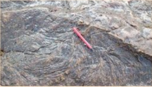
Trace fossil: Zoophycos (burrow)