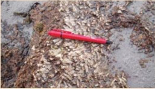
Body fossil: Colonial coral Siphonodendron

At Barns Ness you can see body fossils - the remains of the actual animal or plant, and trace fossils which are the remains of the burrows or trails left by an animal.