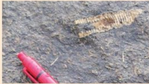
Body fossil: Crinoid Parazeacrinites sea lily