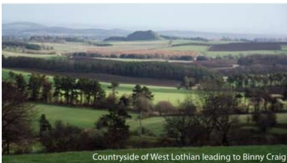
(Figure 4) Countryside of West Lothian leading to Binny Craig.