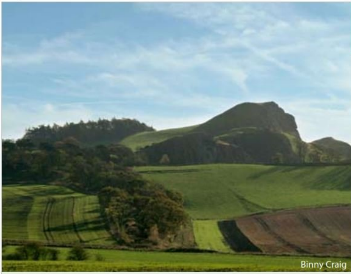
(Figure 2) Binny Craig.