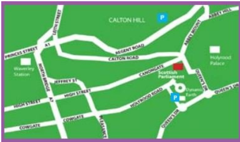
How to find the Canongate Wall.