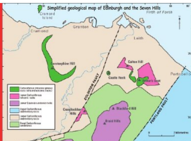
Simplified geological map of Edinburgh and the Seven Hills.

Craiglockhart really consists of two hills of Lower Carboniferous basalt lavas and ashes lying on sandstone. Easter Craiglockhart with a summit of 158m is separated from Wester Craiglockhart (175m) by a dry valley Glenlockhart. The valley took its present form over 17000 years ago when a great ice sheet covered the area. Meltwater from the Water of Leith, then dammed by ice, cut this channel eastwards.