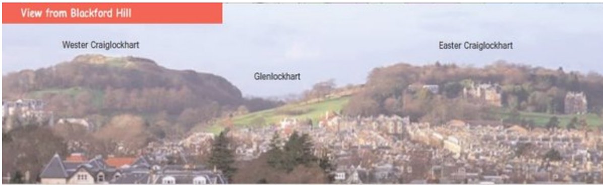
View of the Craiglockhart Hills from Blackford Hill.