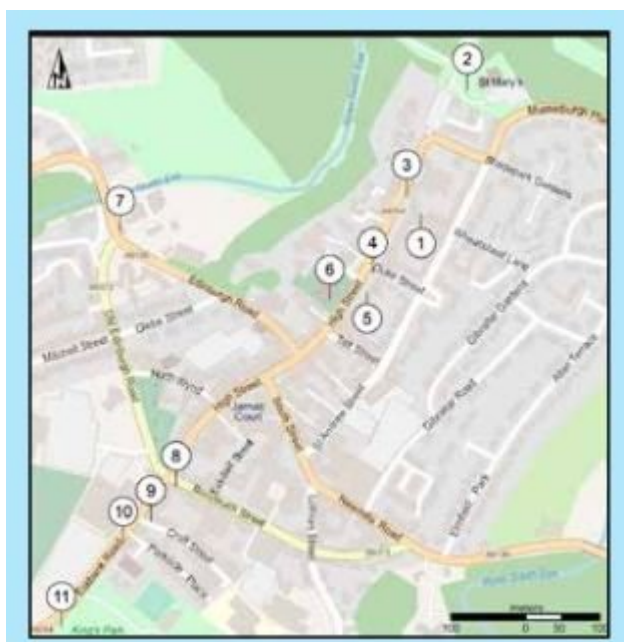
(Figure 1) Map showing stops on the Dalkeith building stones walk.