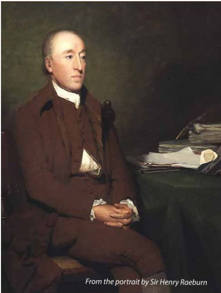
From the portrait by Sir Henry Raeburn