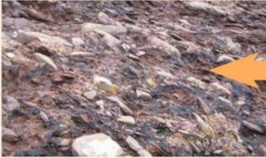
THE UNCONFORMITY Intricate, three-dimensional surface representing a 65-million year gap in deposition.