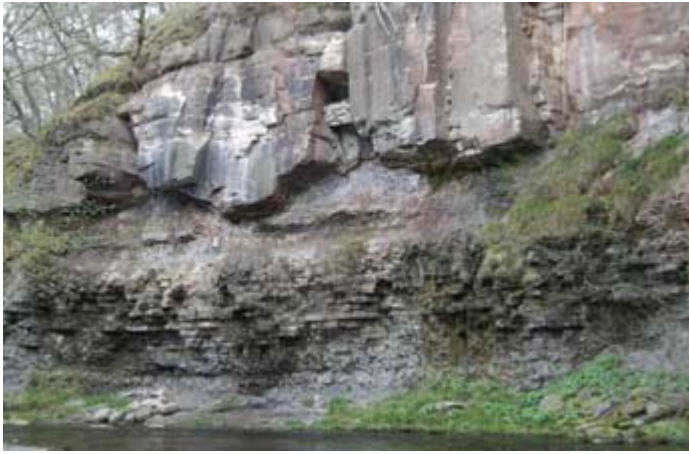
(Figure 12) The base of ancient river channels in Carboniferous sandstone in Roslin Glen, by the Gunpowder Mill, with finer horizontal beds underlying it.