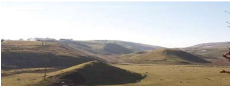
(Figure 4) Meltwater channels southwest of Carlops.