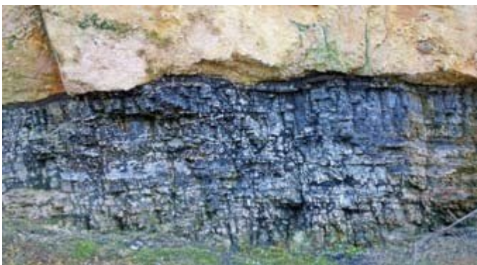
(Figure 11) The coal seam in the Upper Carboniferous sandstones in Midlothian Coalfield under the A68.