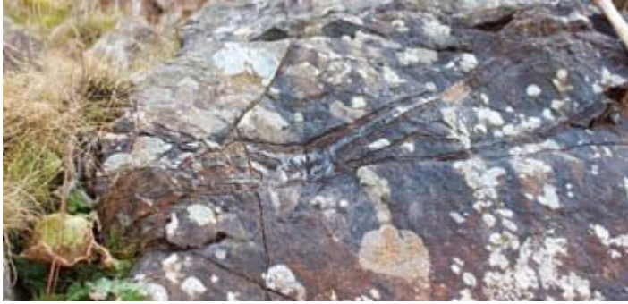
(Figure 9) Veins in Devonian igneous rock in Carlops.