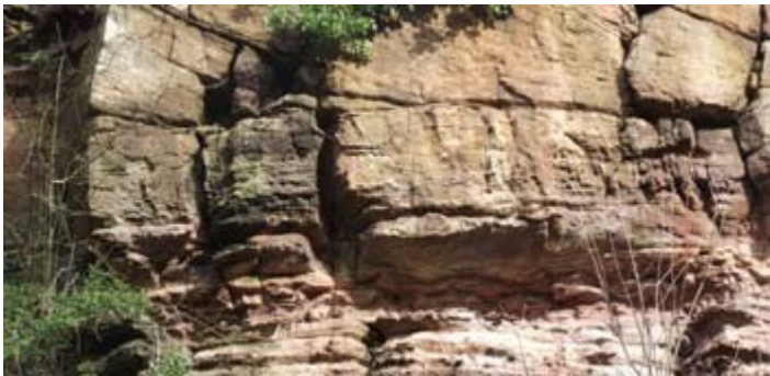
(Figure 10) Sandstone in Auchendinny [NT 258 616] from the Early Carboniferous showing a boundary between two different sets of sandstone layers deposited by river currents. The upper set shows cross-bedding, where sand is deposited at an angle by moving sand 'ripples'.