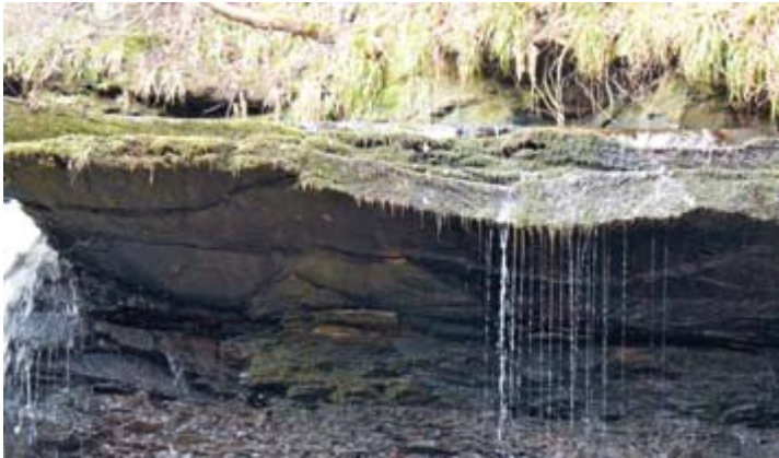
(Figure 13) Upper Carboniferous mudstone in Gore Glen [NT 33343 61799], it is interbedded with sandstones along the river.