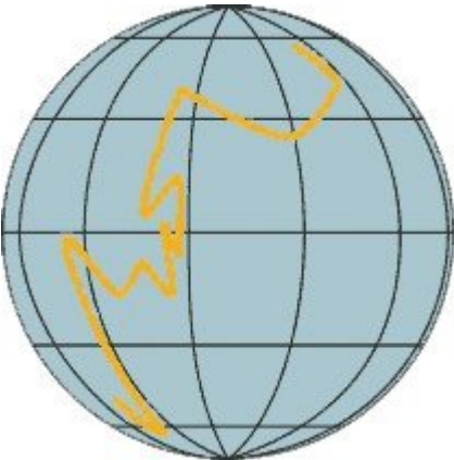
(Figure 2) The globe shows Scotland's journey from south of the equator to the northern hemisphere.