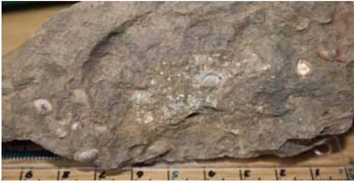
(Figure 8) Fossils from the Silurian Inlier.