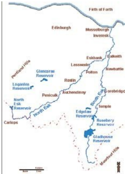
(Figure 1) Location map.

(Figure 13) Upper Carboniferous mudstone in Gore Glen [NT 33343 61799], it is interbedded with sandstones along the river.