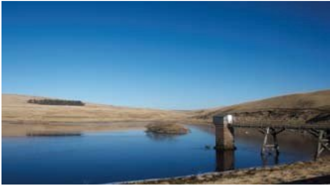
(Figure 6) North Esk Reservoir.