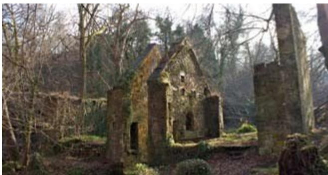
(Figure 5) Gunpowder Mill in Roslin Glen.