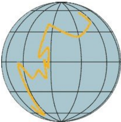
(Figure 2) The globe shows Scotland's journey from south of the equator to the northern hemisphere.