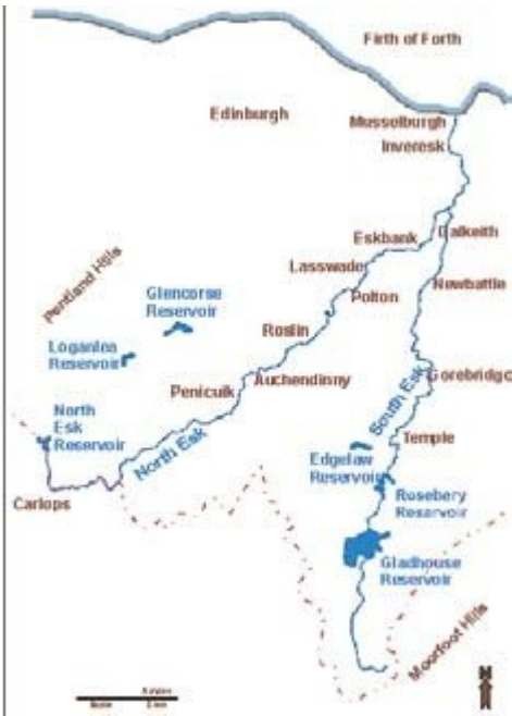
(Figure 1) Location map.

(Figure 13) Upper Carboniferous mudstone in Gore Glen [NT 33343 61799], it is interbedded with sandstones along the river.