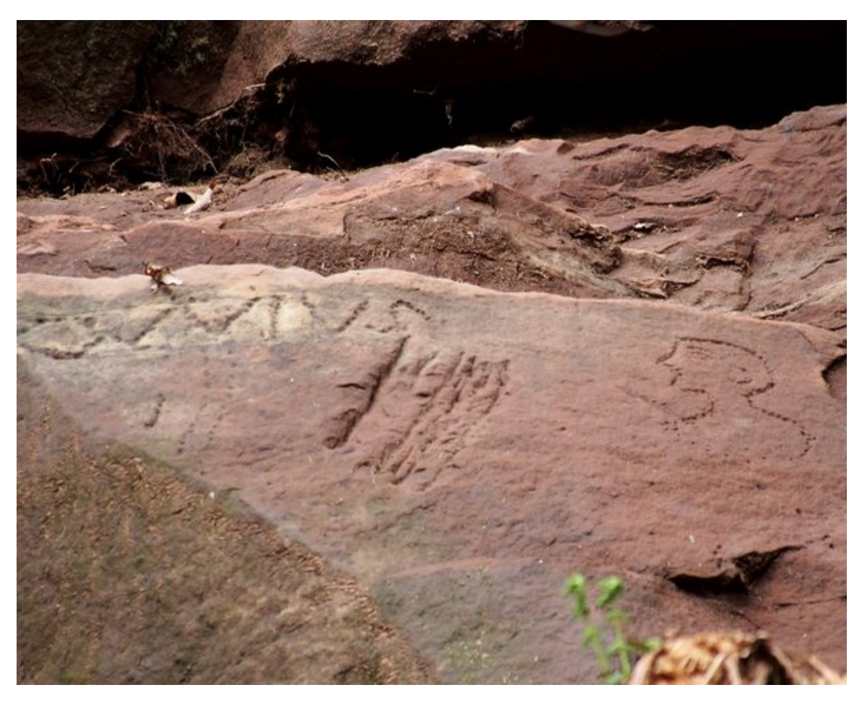
(Photo 03-1) Roman carvings in a quarry in St Bees Sandstone in the Gelt gorge.