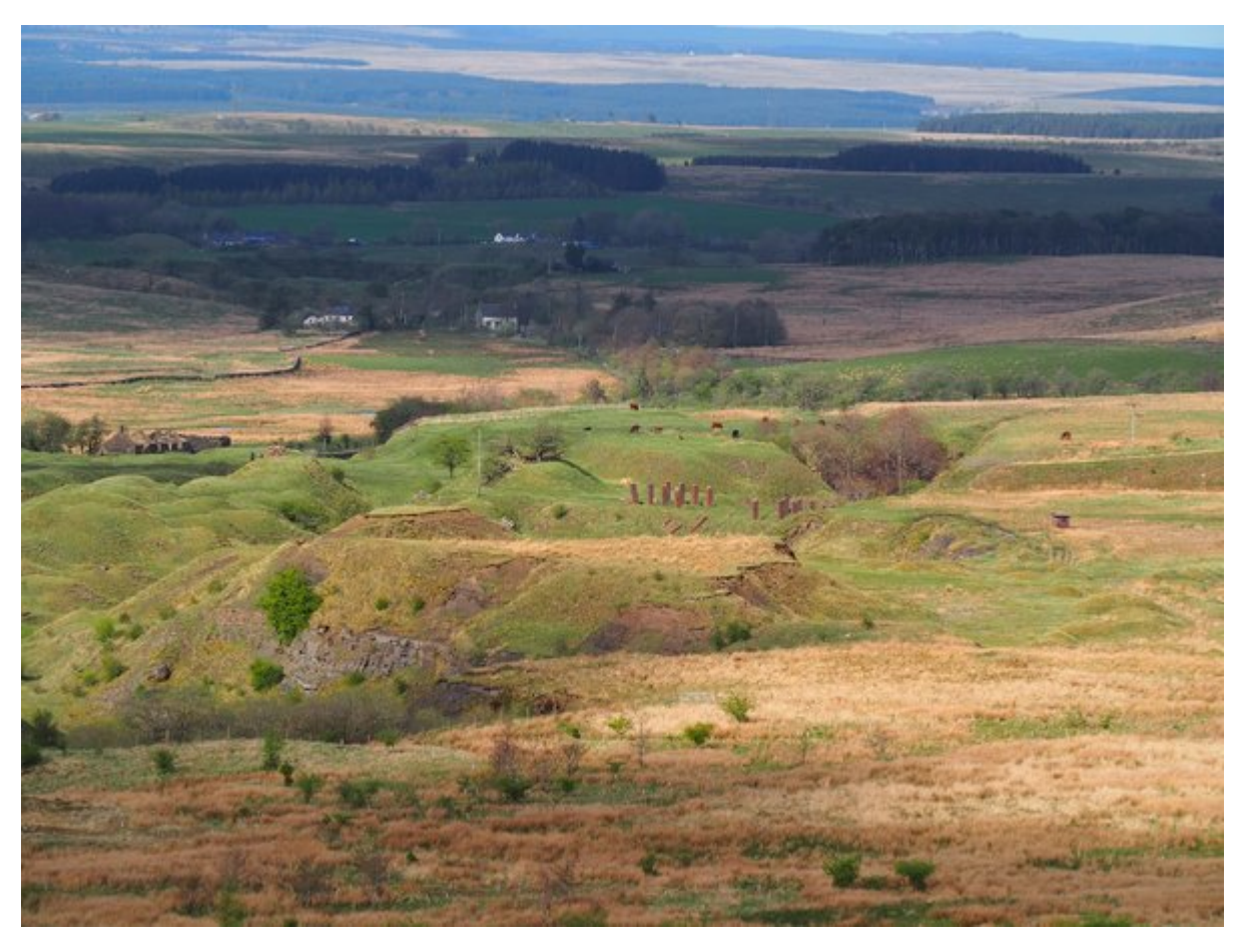
(Photo 49-1) View northeast over limestone and brickshale workings near Hallbankgate.