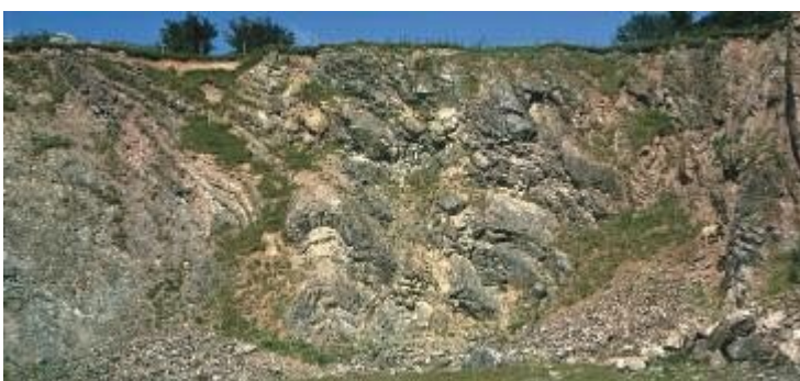
Keisley Limestone Quarry, Dufton.

The currently accepted classification of the Ordovician and Silurian rocks of the AONB is shown in the table above.