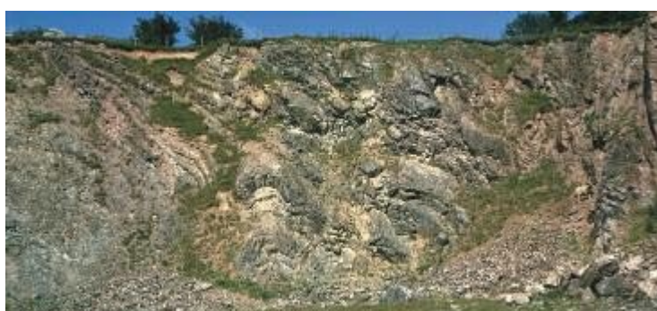
Keisley Limestone Quarry, Dufton.

The currently accepted classification of the Ordovician and Silurian rocks of the AONB is shown in the table above.