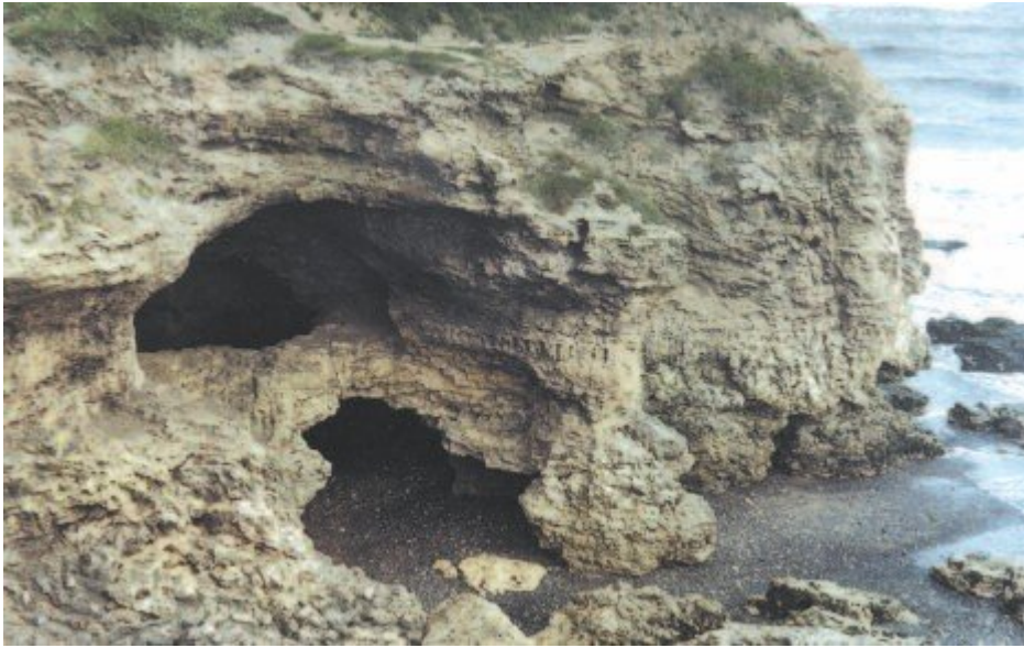
(Photo 27) Blackhall Rocks. Caves in Ford Formation.