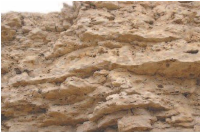
(Photo 25) Thrislington Quarry, Ferryhill. Dolomitic limestone with cavities, characteristic of part of the Raisby Formation.