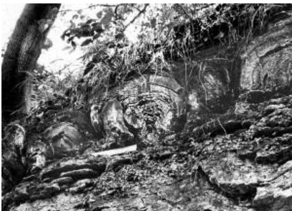
(Photo 26) Hesleden Dene. Algal domes in Magnesian Limestone.