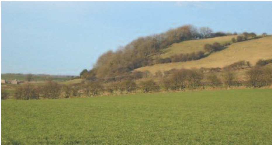
(Photo 28) Quarrington. The escarpment of the Magnesian Limestone.