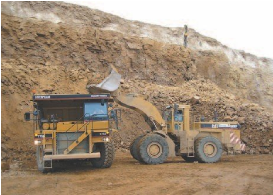
(Photo 30) Coxhoe (Raisby) Quarry. Dolomitic limestone of the Raisby Formation.