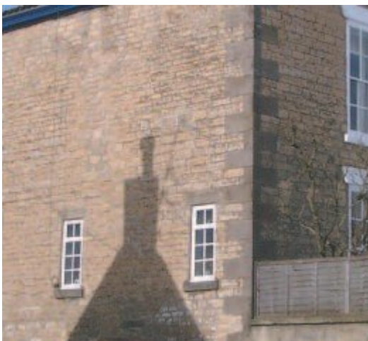
(Photo 29) Heighington. Magnesian Limestone as a building stone: the quoins are Coal Measures sandstone.