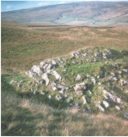
(Photo 52) Herdship Fell, Teesdale. Large erratic mass of Dinantian limestone.