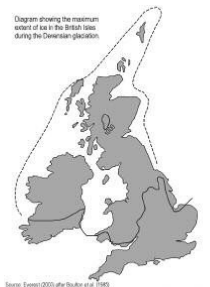
(Figure 23) Maximum extent of ice in Great Britain during the Devensian glaciation.