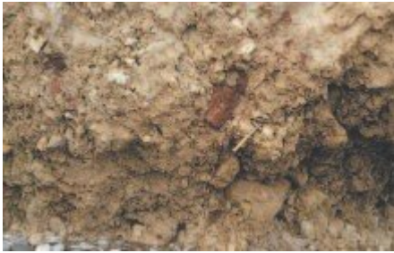
(Photo 49) Shippersea Bay, Easington. Quaternary debris filling fissure in Magnesian Limestone.