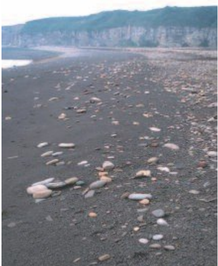
(Photo 55) Hawthorn Hive. Pyrite-rich sand derived from colliery spoil.