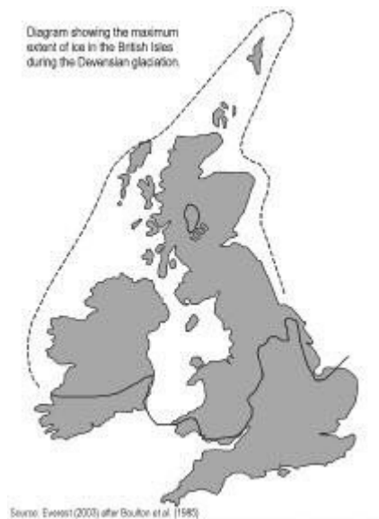
(Figure 23) Maximum extent of ice in Great Britain during the Devensian glaciation.