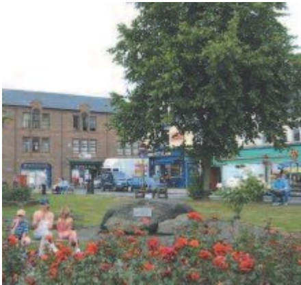
(Photo 51) Devil's Stones, Crook. Erratic boulders of volcanic rocks from the Lake District.