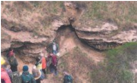
(Photo 54) Shippersea Bay, Easington. The Easington Raised Beach.