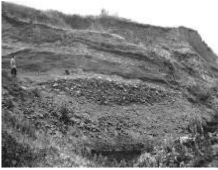
(Photo 56) Durham Gravel Pit. Glacial sands and gravels. Photographed 1965.