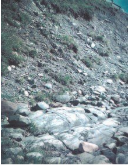
(Photo 50) Haugh Hill, Harwood, Teesdale. Till overlying striated pavement of Whin Sill dolerite.