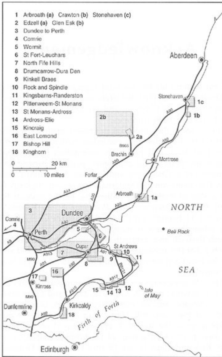
(Map 1) Excursion location map.