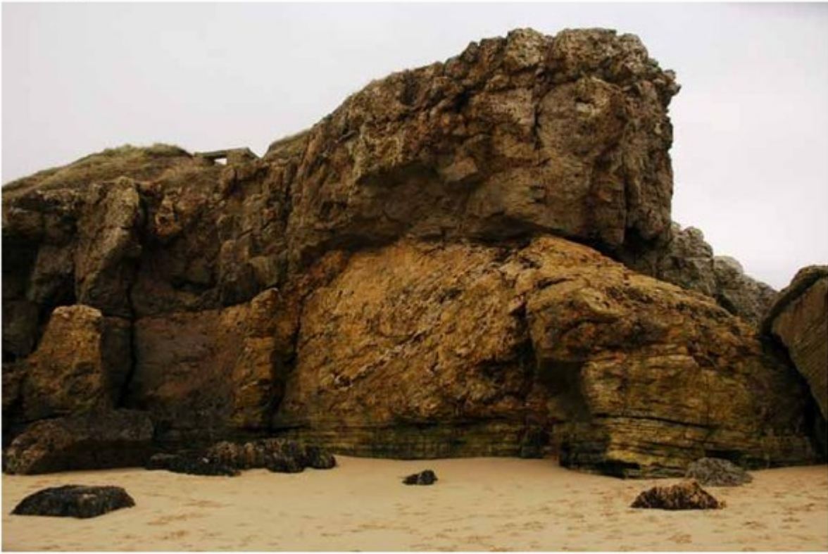
(Plate 6) The Concretionary Limestone overlying slide debris in the Ford Formation at Trow Point.